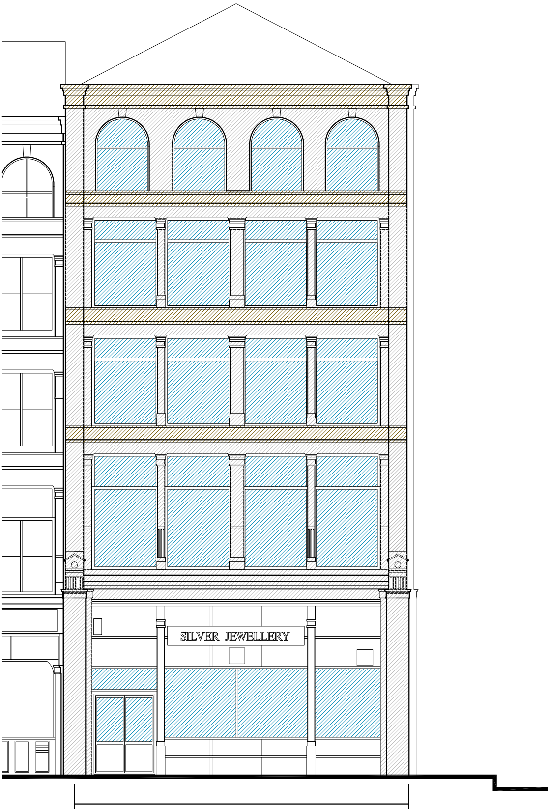
Existing East Elevation Scale 1:100

This drawing may be based on site information as supplied by third parties and as such RBA make no guarantees as to it's accuracy. The features as illustrated are thus approximate and subject to a detailed Topographical and/or Measured Building Survey, Statutory Service enquiries and the confirmation by the client of all legal boundaries.