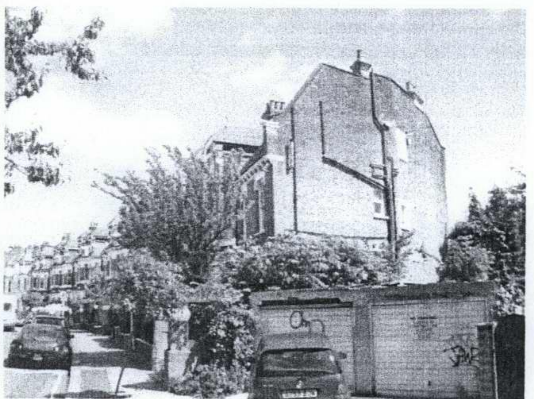
The garage (above left) that separates the proposed house from the parade of town houses in Inglewood Road (pictured above right).