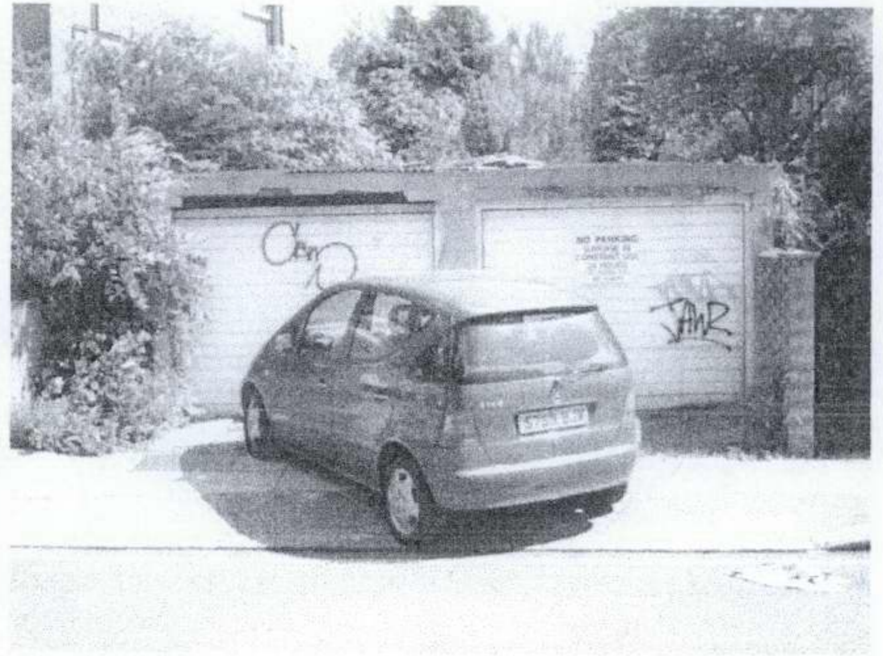
The house at 11 Holmdale Street (above left) with rear yard extending all the way back to include the two carports (pictured above right) currently used for storage.