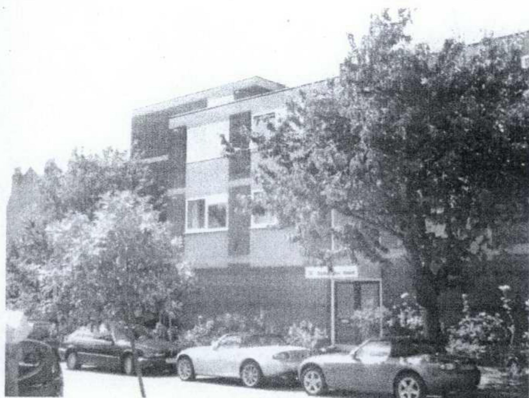
Welbek Mansions (above left) dominates the opposite side of the road while the Ambassador Court flats (above right) turns the corner between Inglewood and Holmdale Road in very conventional 60's terms...