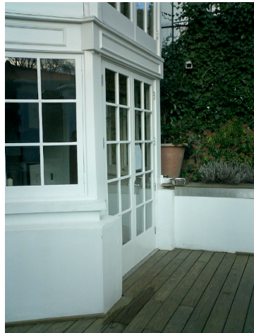
Bay Window of no.34 Queens Grove