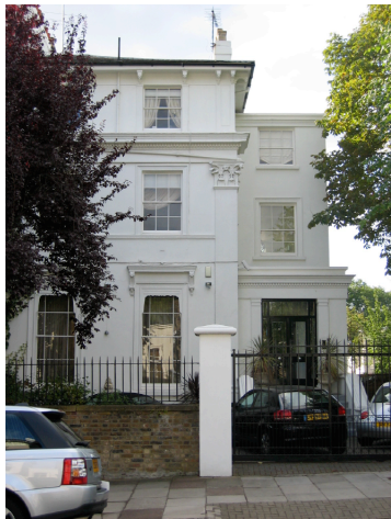
Front Elevation of no.34 Queens Grove