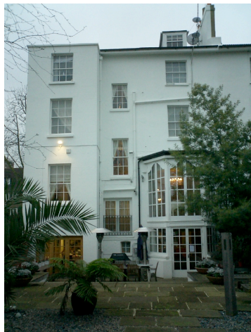
Rear Elevation of no.34 Queens Grove