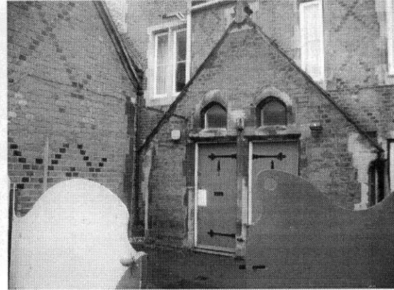
2. Close-up of front door to No 1.