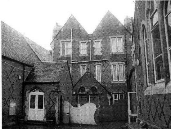
1. Nos 1 & 3 (No 1 to left)