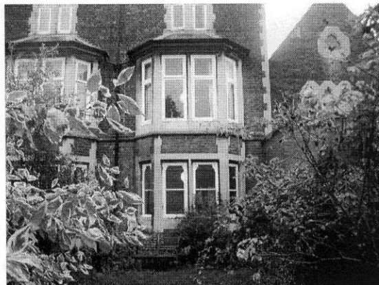
3. No 1 Rear Elevation