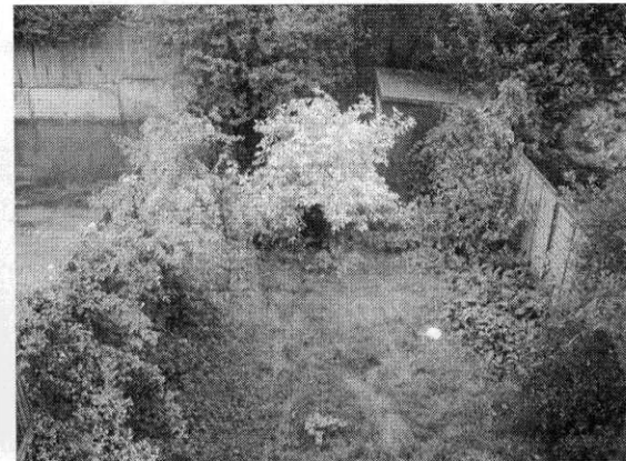
4. No 1 Rear Garden