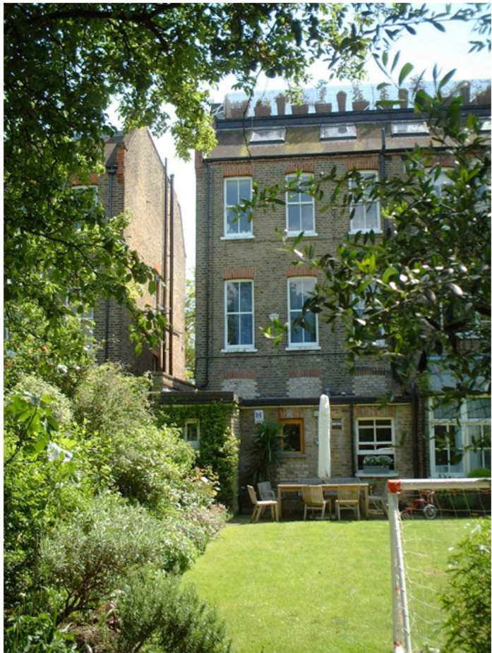
No. 84 Greencroft Gardens : Left Rear Elevation