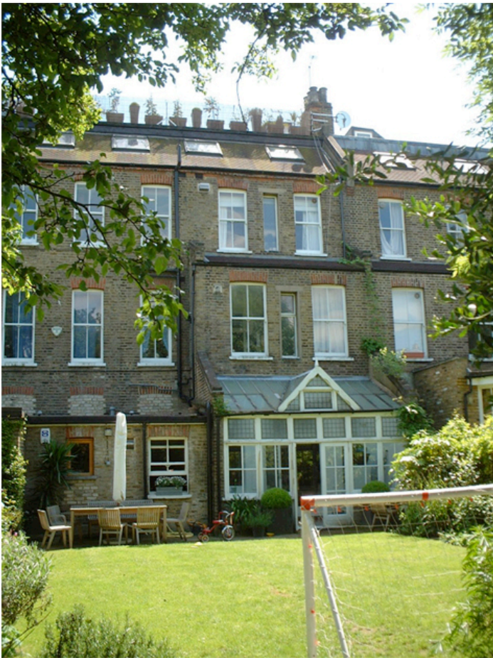
No. 84 Greencroft Gardens : Right Rear Elevation