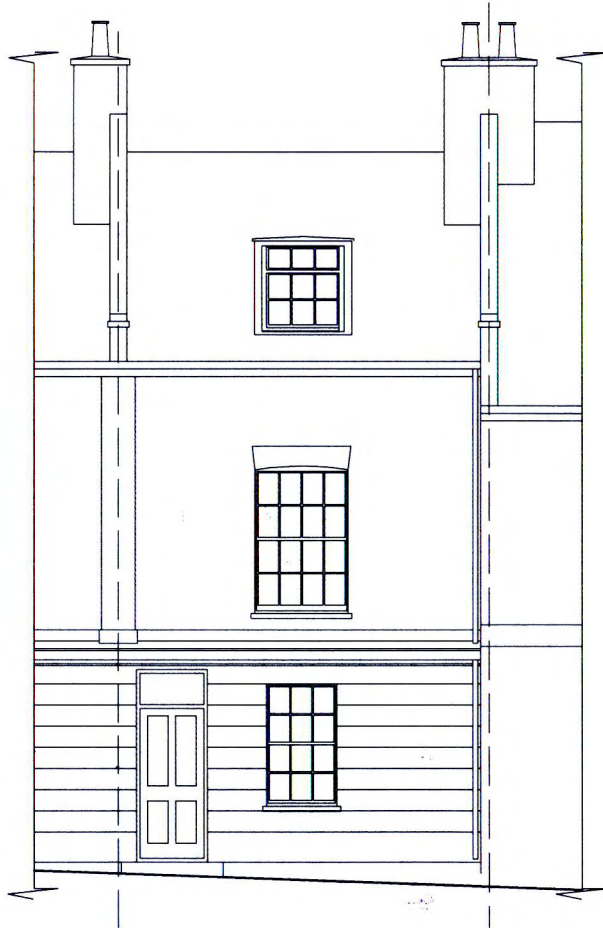
FRONT ELEVATION (Unchanged)