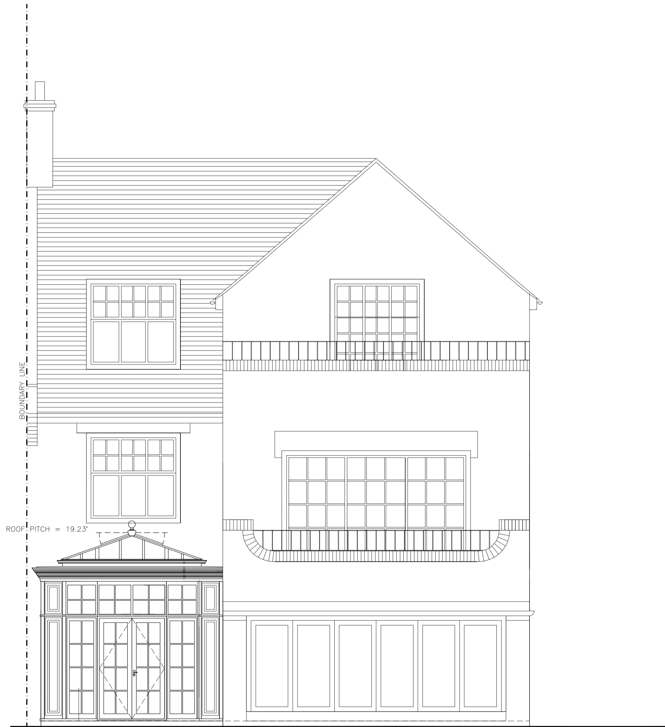
ORANGERY FINISHED FLOOR LEVEL AS EXISTING KITCHEN FINISHED FLOOR LEVEL. PROPOSED SOUTH WEST ELEVATION