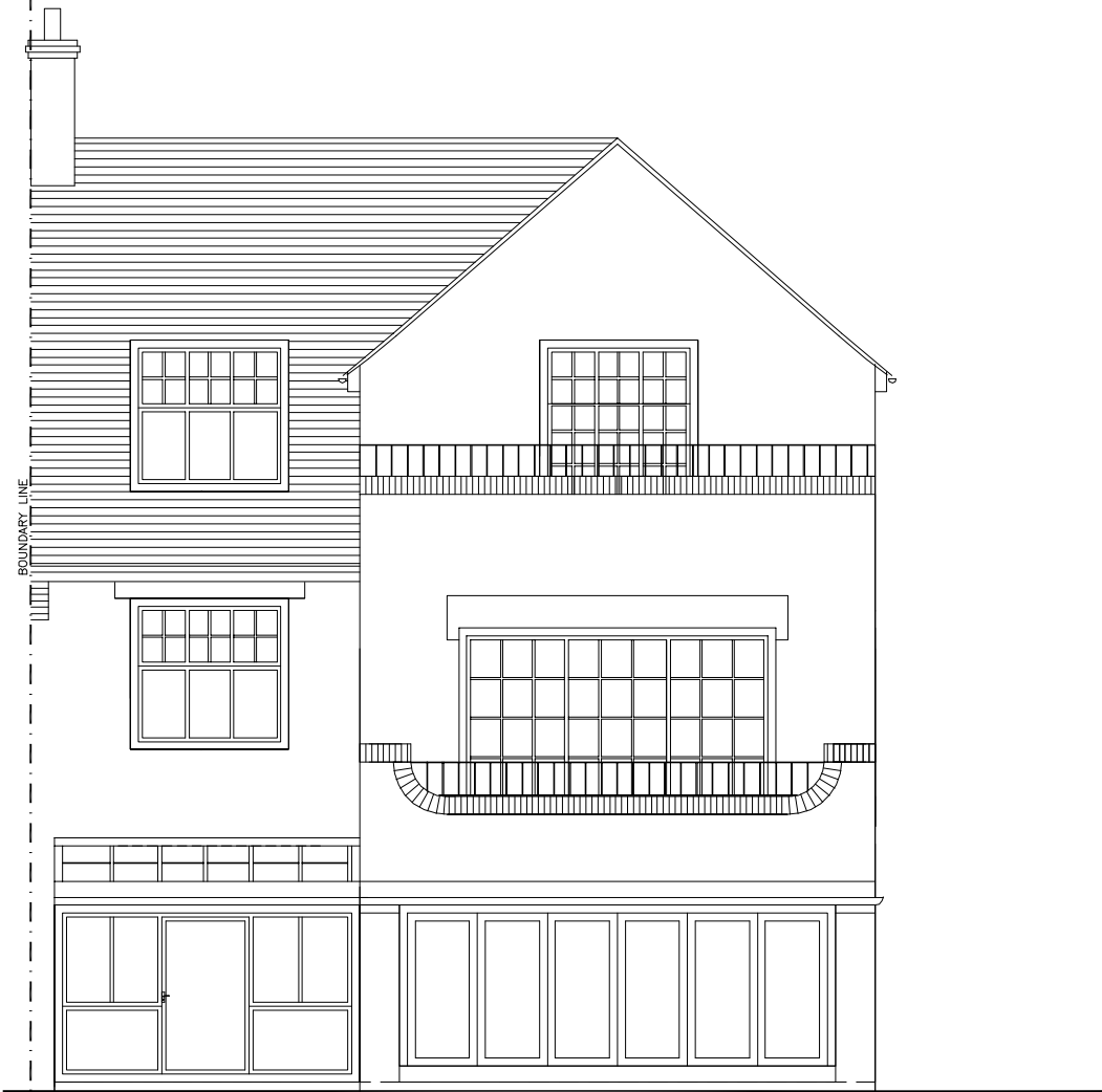
EXISTING SOUTH WEST ELEVATION