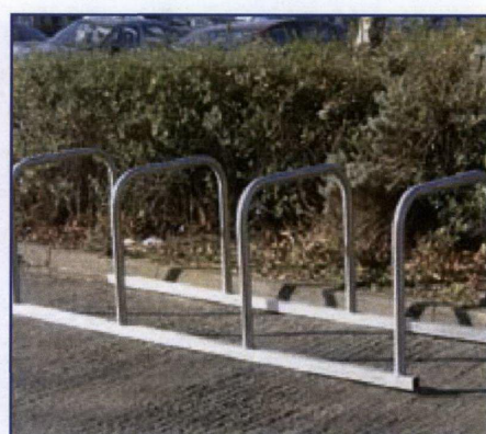
Stainless steel finish