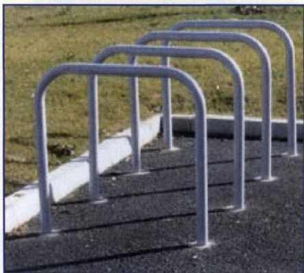
Galvanised finish, ragged ends