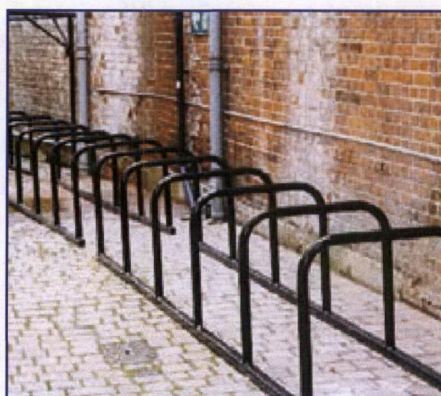
Galvanised & painted black finish