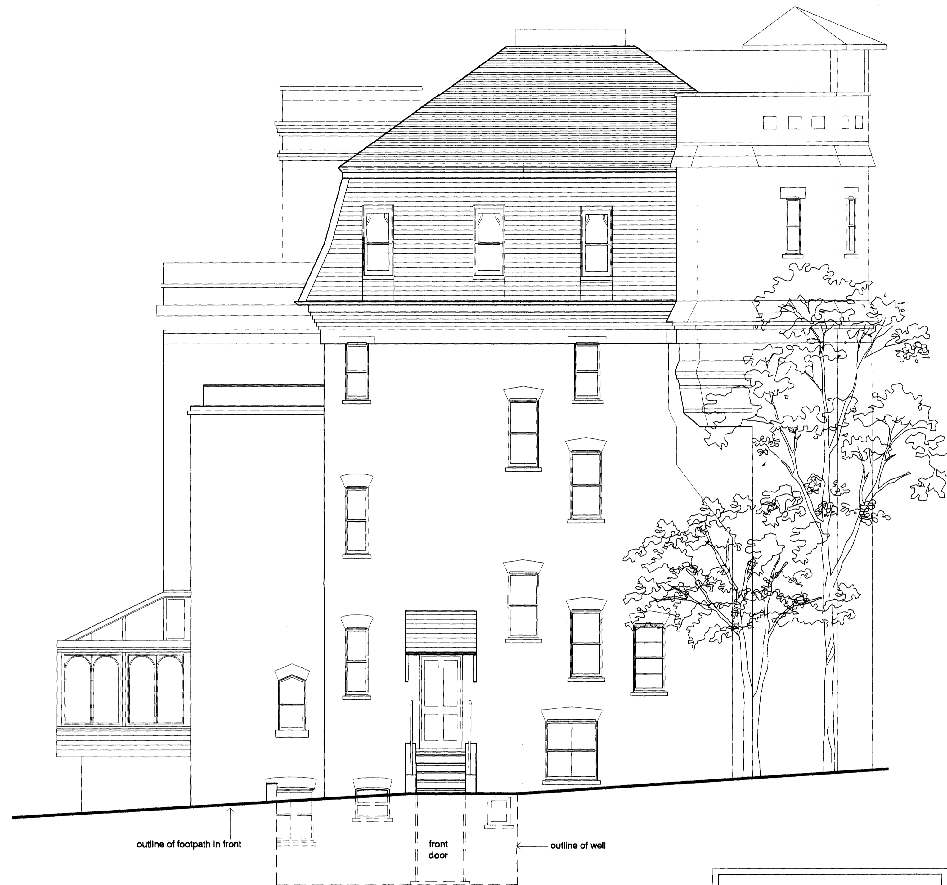
east elevation as existing (windows to front area dotted )