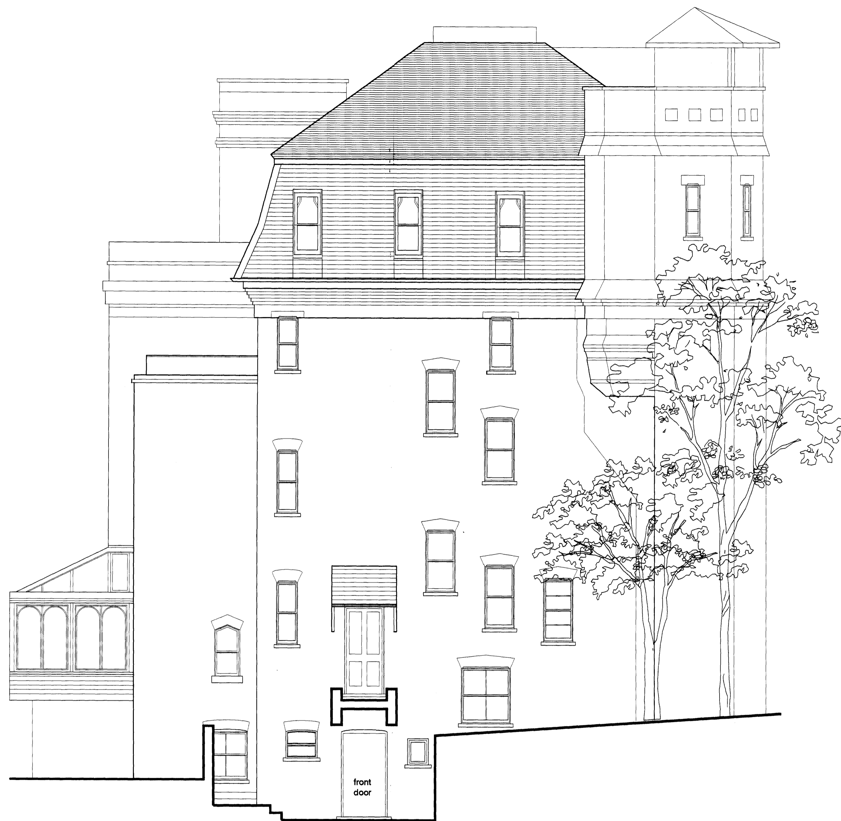
east sectional elevation as existing (true elevation into front area)