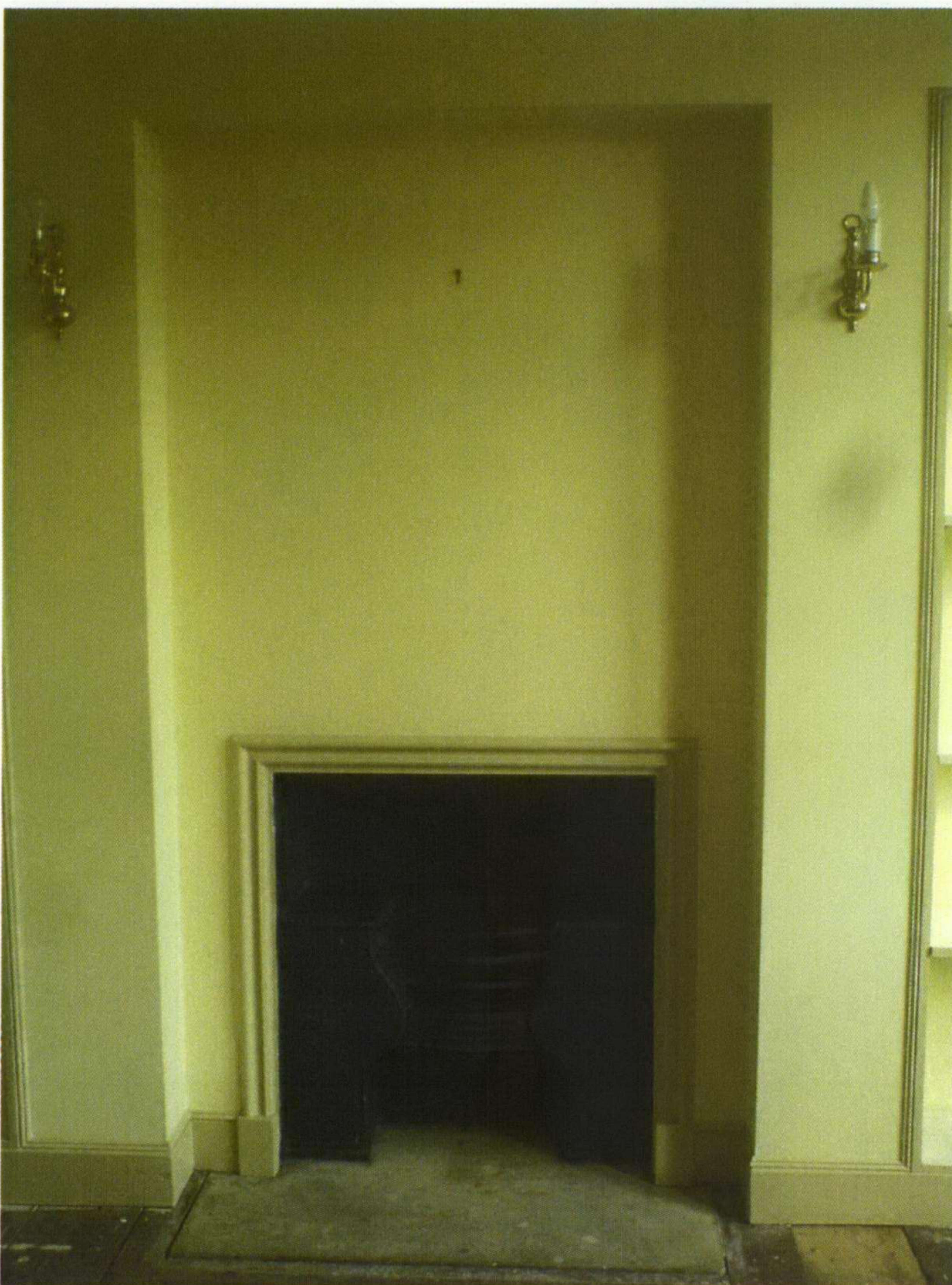
Photograph 29. Third Floor. Office fit-out; but early hearth still in place to be retained.