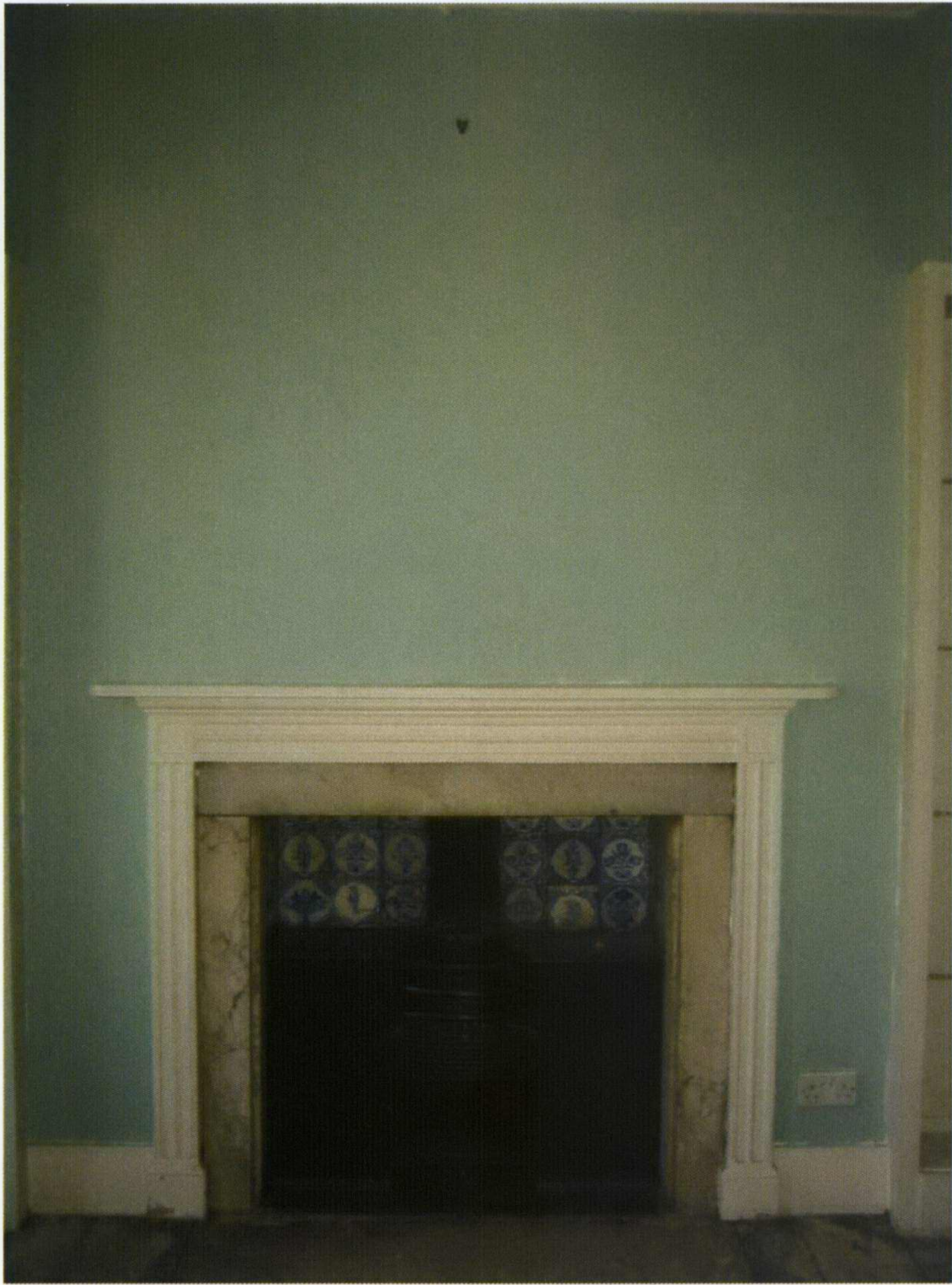
Photograph 24. Second Floor Front – original fireplace.