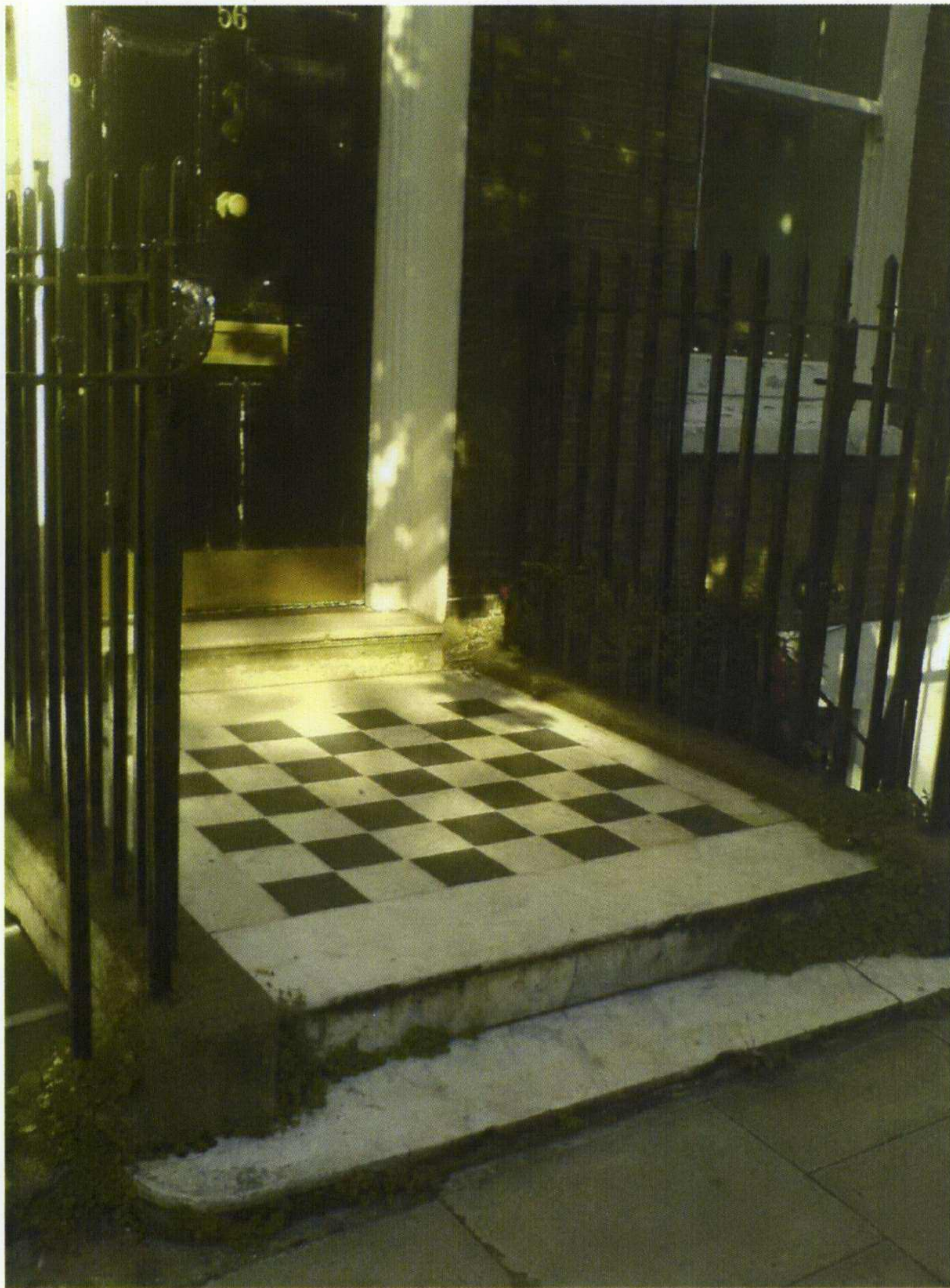
Photograph 30. Front step. (Defective and leaking).