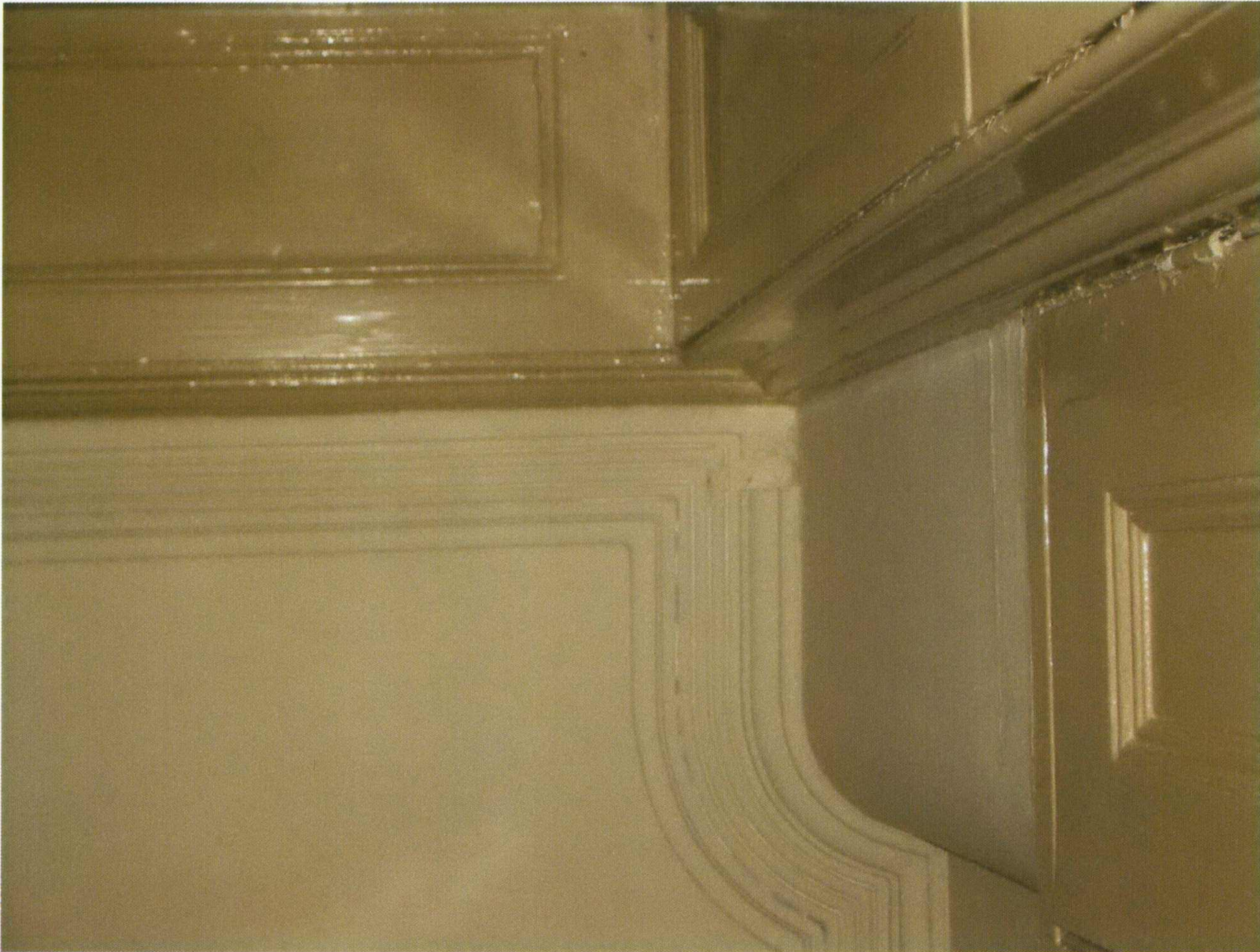
Photograph 27. Original detailing above the hearth referred to above.