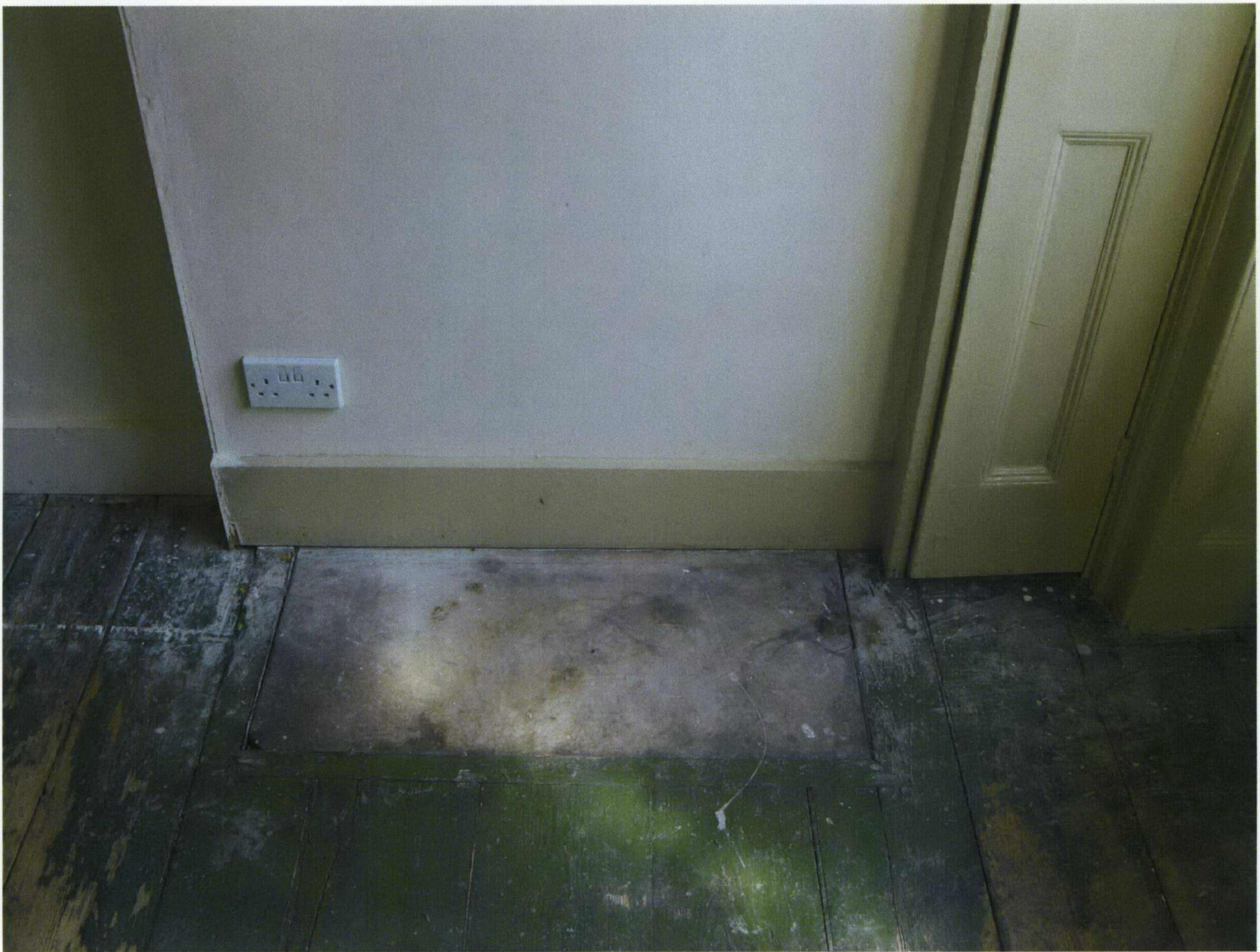
Photograph 26. Second Floor Front. Second fireplace hearth in the room. Very unusual feature.