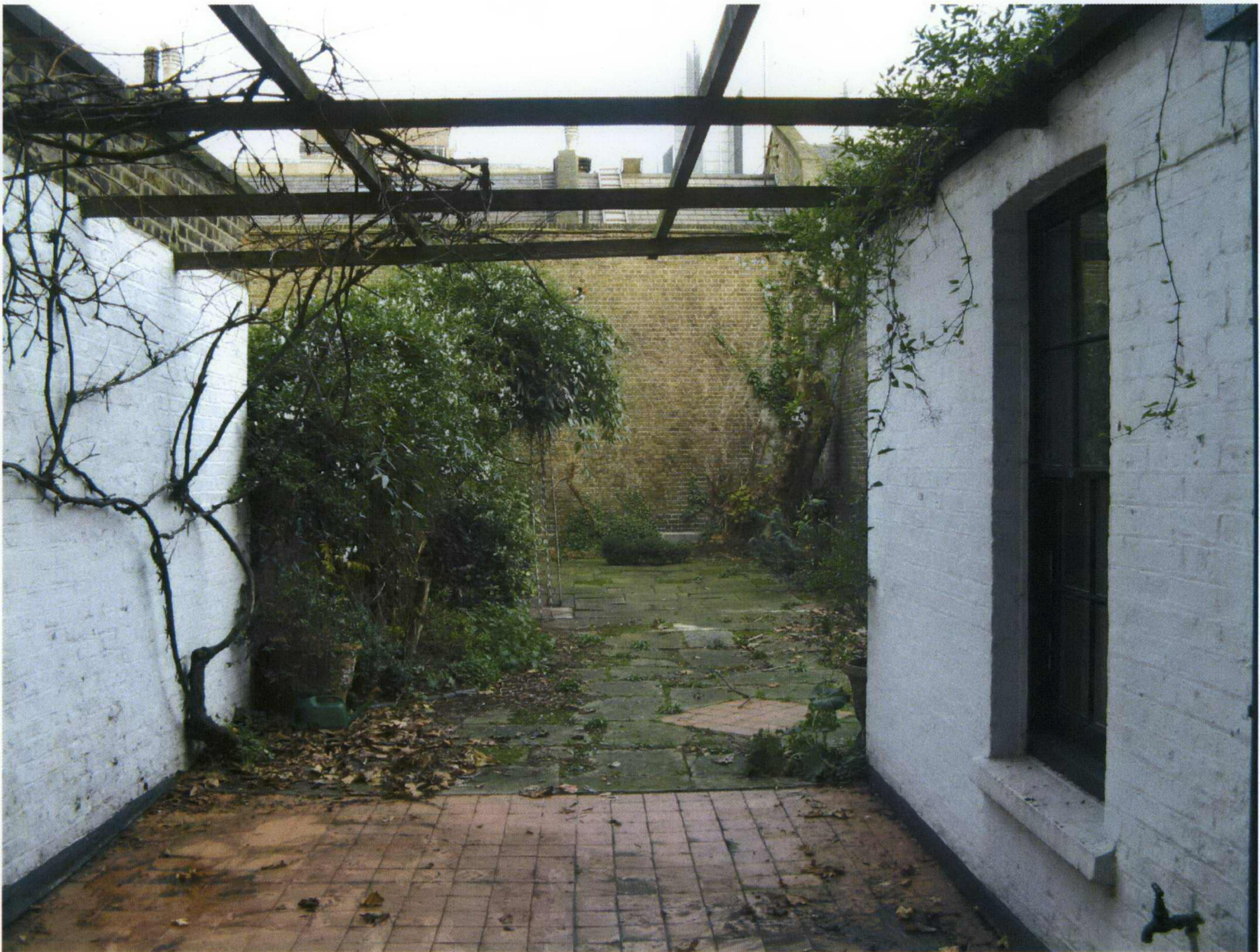
Photographs 32 and 33. Views into rear garden No. 56 Doughty Street.