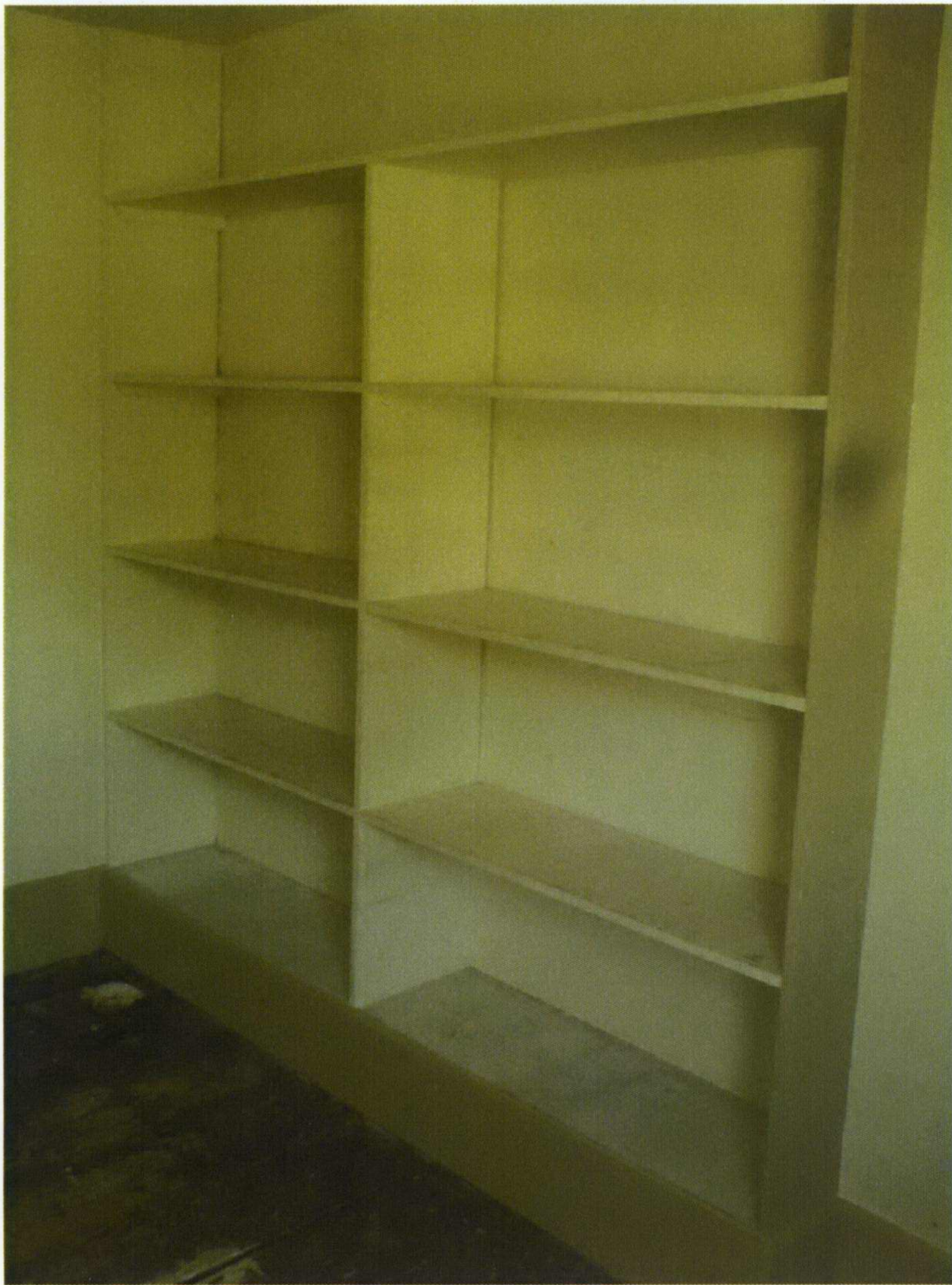
Photograph 28. Third Floor. Office fitting out typical of this floor.