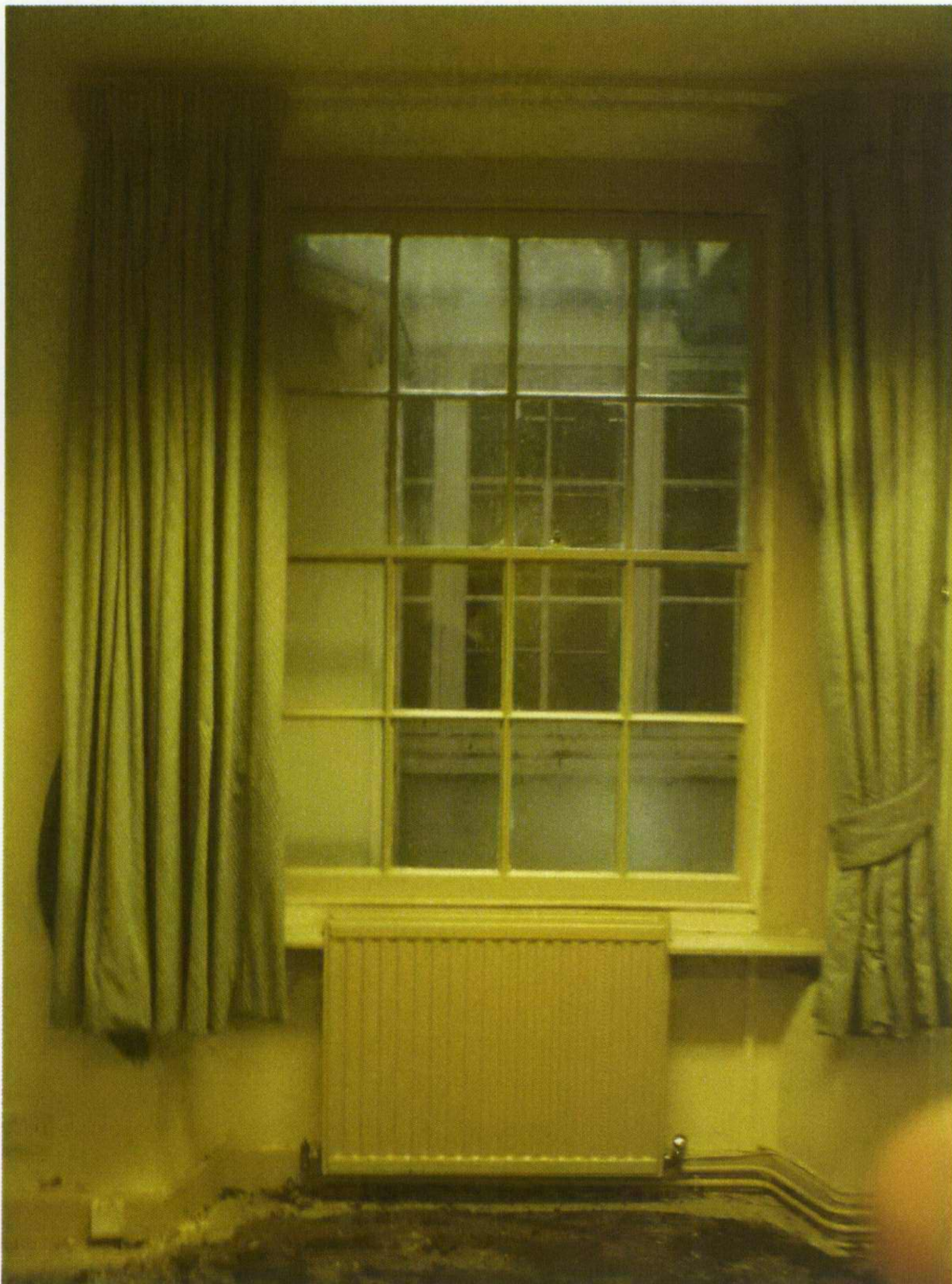
Photograph 31. Basement window into small rear gridded area. Proposed to be glazed double doors using mouldings to match. NB: This window has been a doorway in the past at some stage.