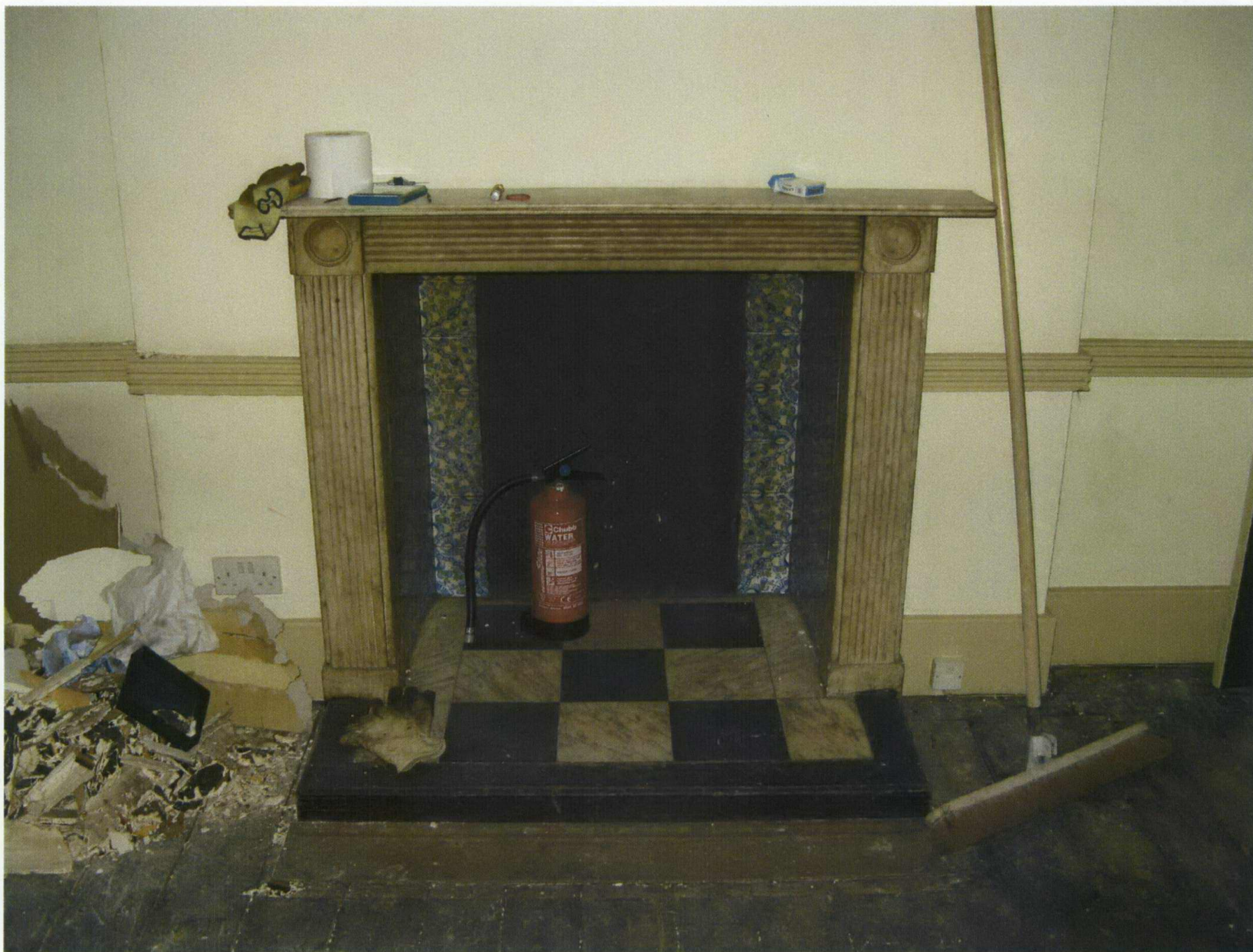
Photograph 22. Ground Floor Rear. Original fireplace with altered hearth (original is underneath). (The original fireplaces survives in damaged state to front room). Also note original dado rail and skirting.