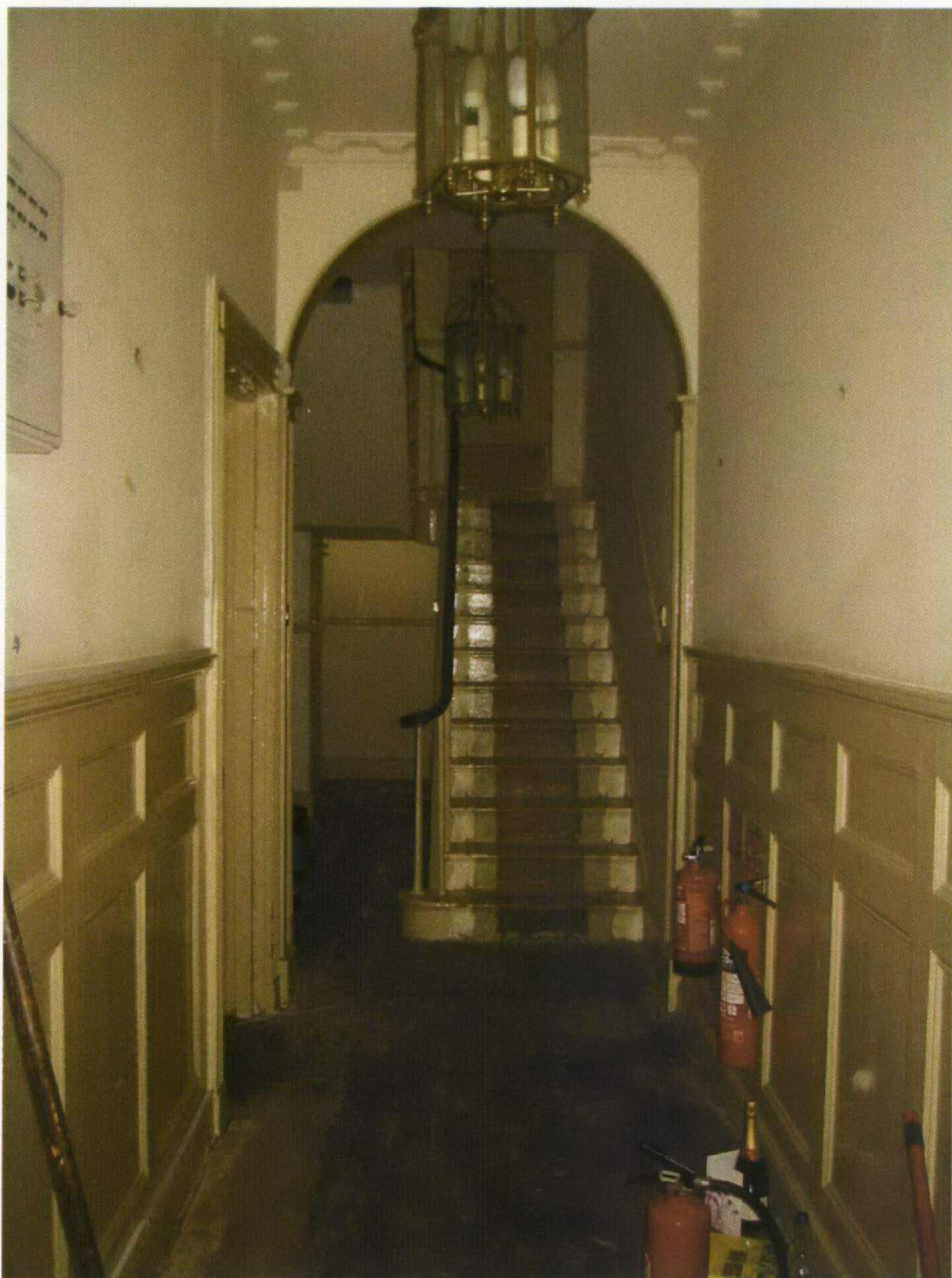
Photograph 17. Looking through the hallway from the front; there is no light at the end of the hall or from the landing due to the modern interventions.