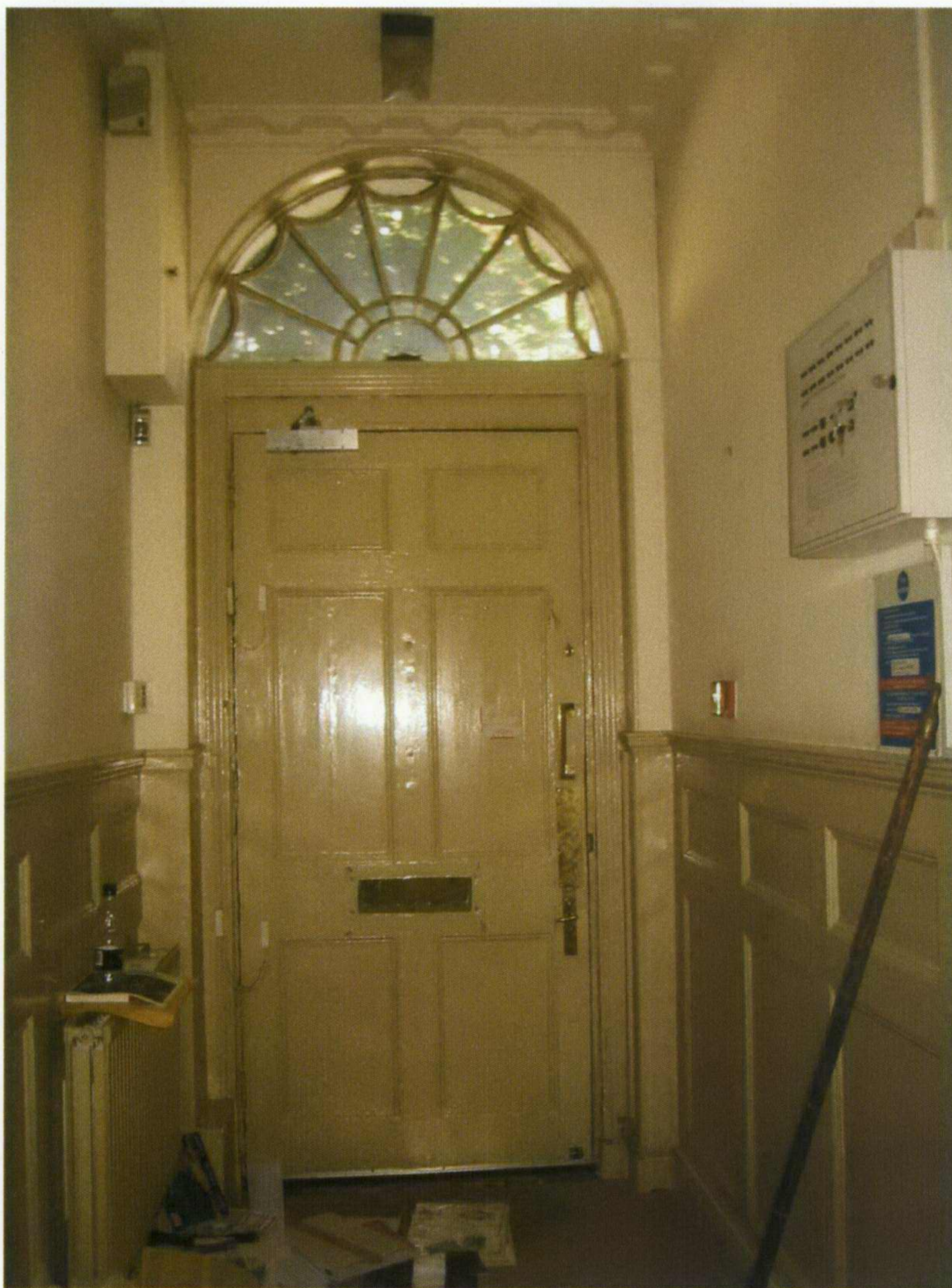
Photograph 16. Back of front door. Much good original detailing but obtrusive services.