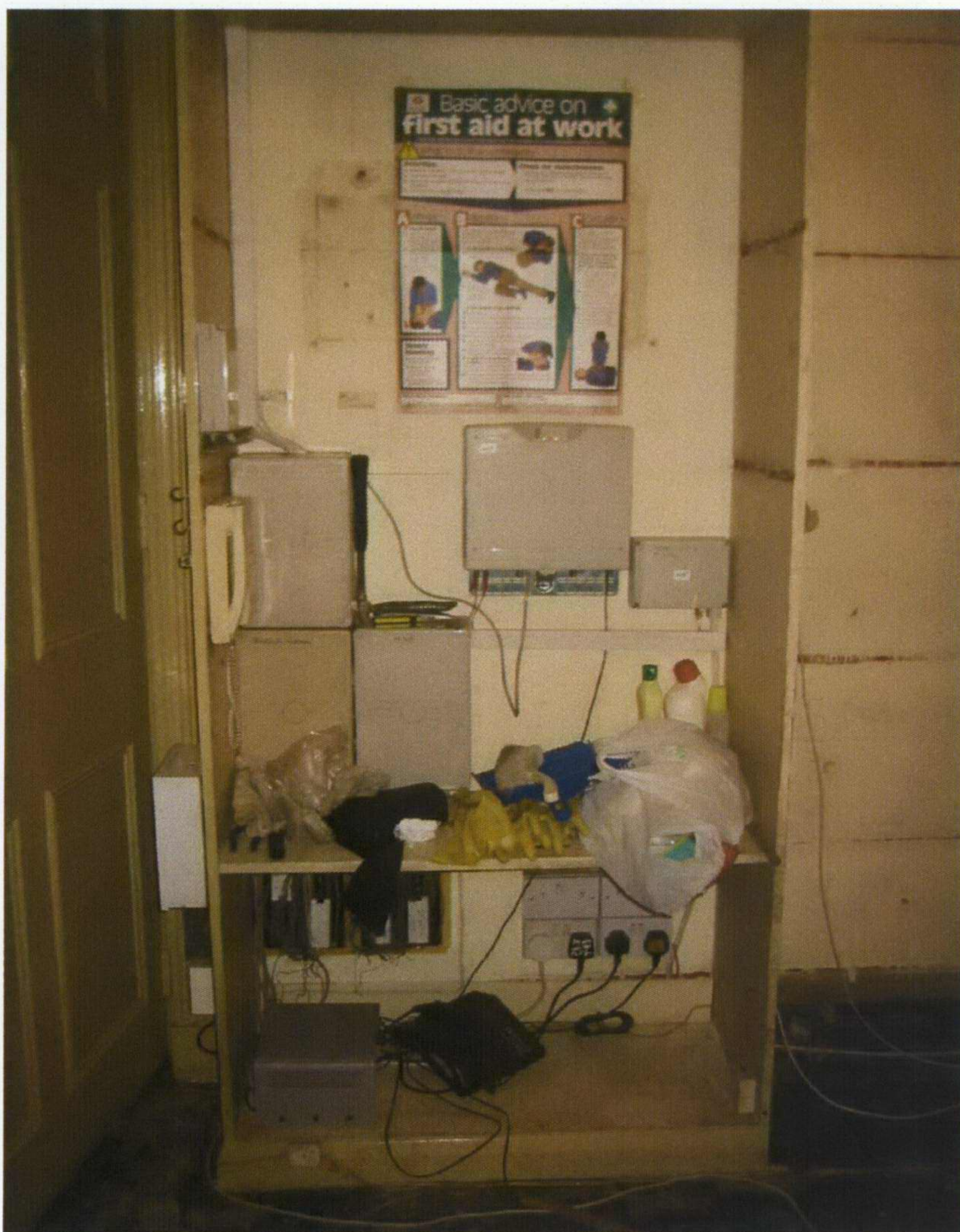
Photograph 19. Ground Floor. Typical of office installations throughout the house.