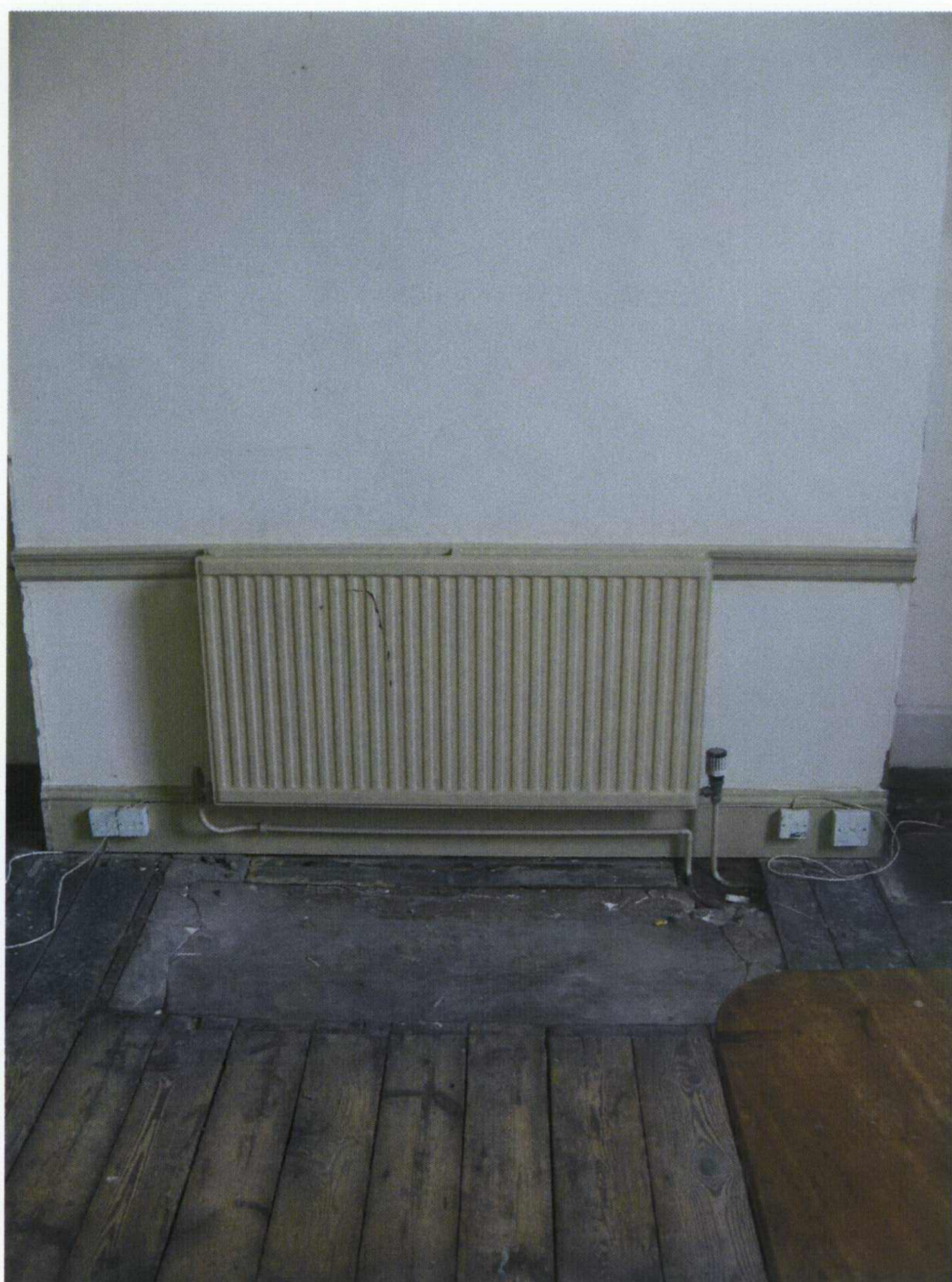
Photograph 23. First Floor Room (Rear). Fireplace removed and blocked – to be reinstated (original was marble to match (damaged) fireplace in front room; proposed to be instated to original design.