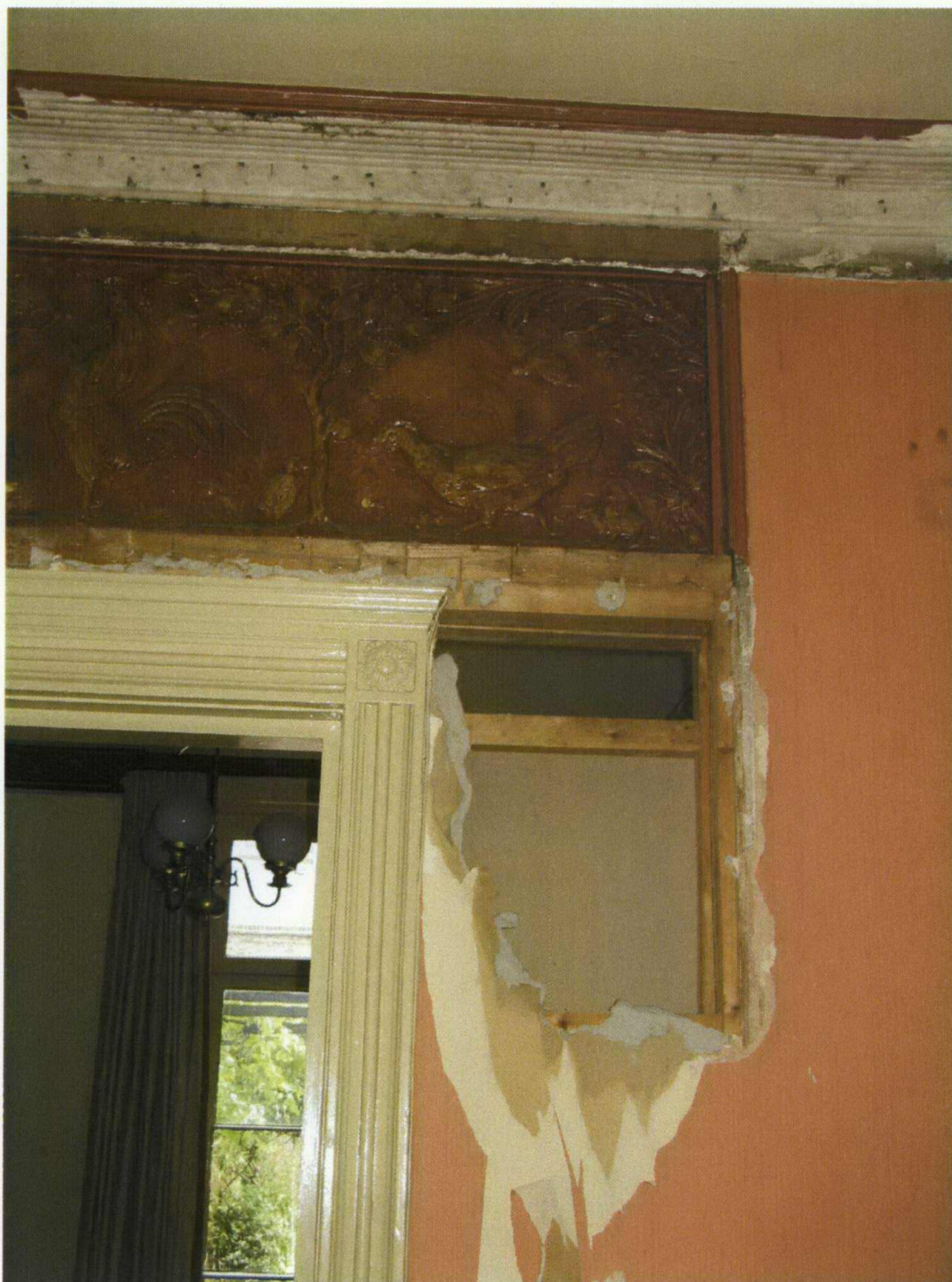
Photograph 21. Original cornice behind crude over-cornice. Also note blocking up of wide doorway and "alien" panel above the door.