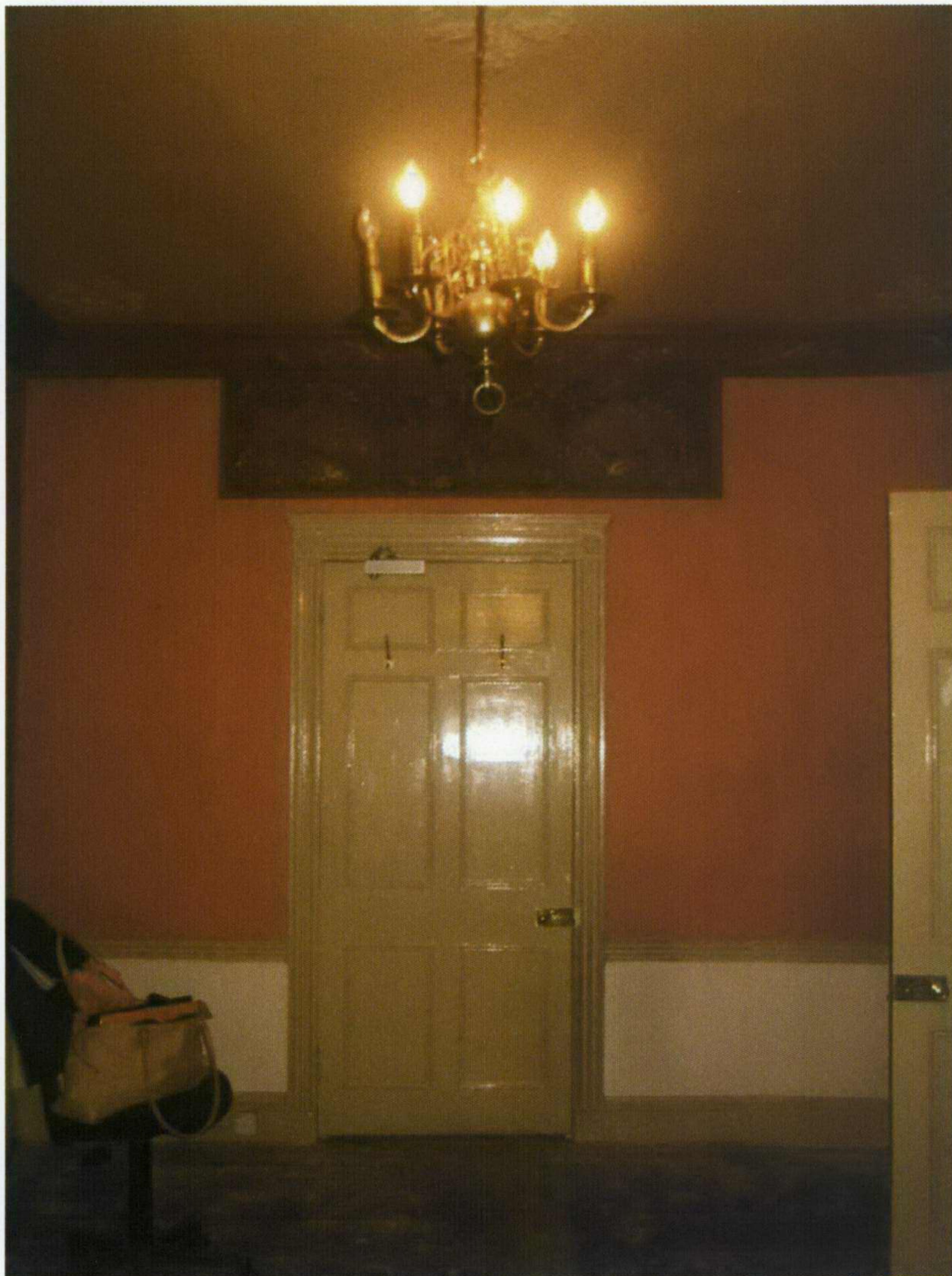
Photograph 18. Ground Floor. Original door in wrong location (to be resited to hallway). Interconnecting rooms recently blocked up.