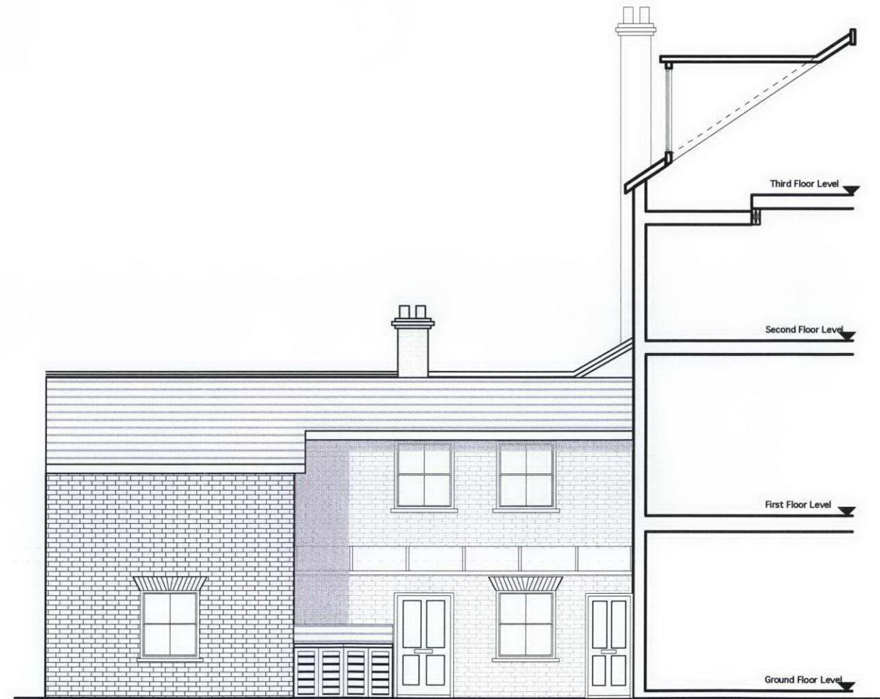
PROPOSED SECTIONAL ELEVATION

Only figured dimensions are to be used; do not scale from drawings.