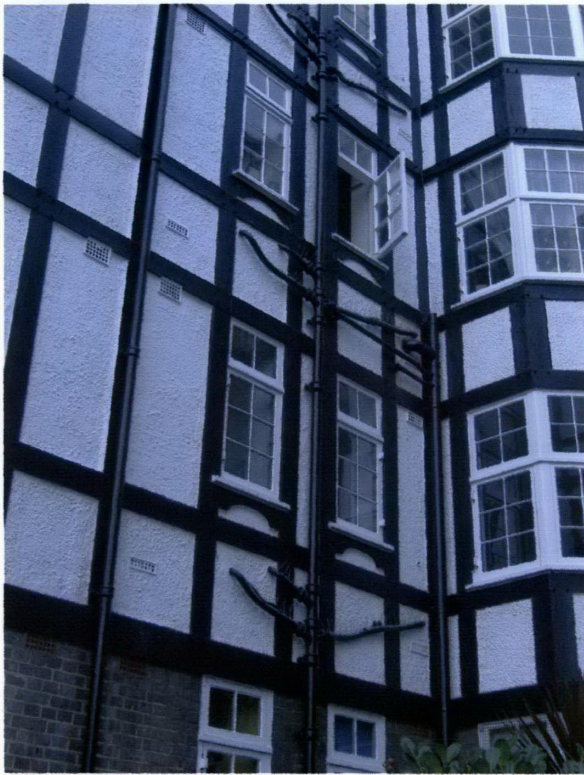
Present exterior piping 01