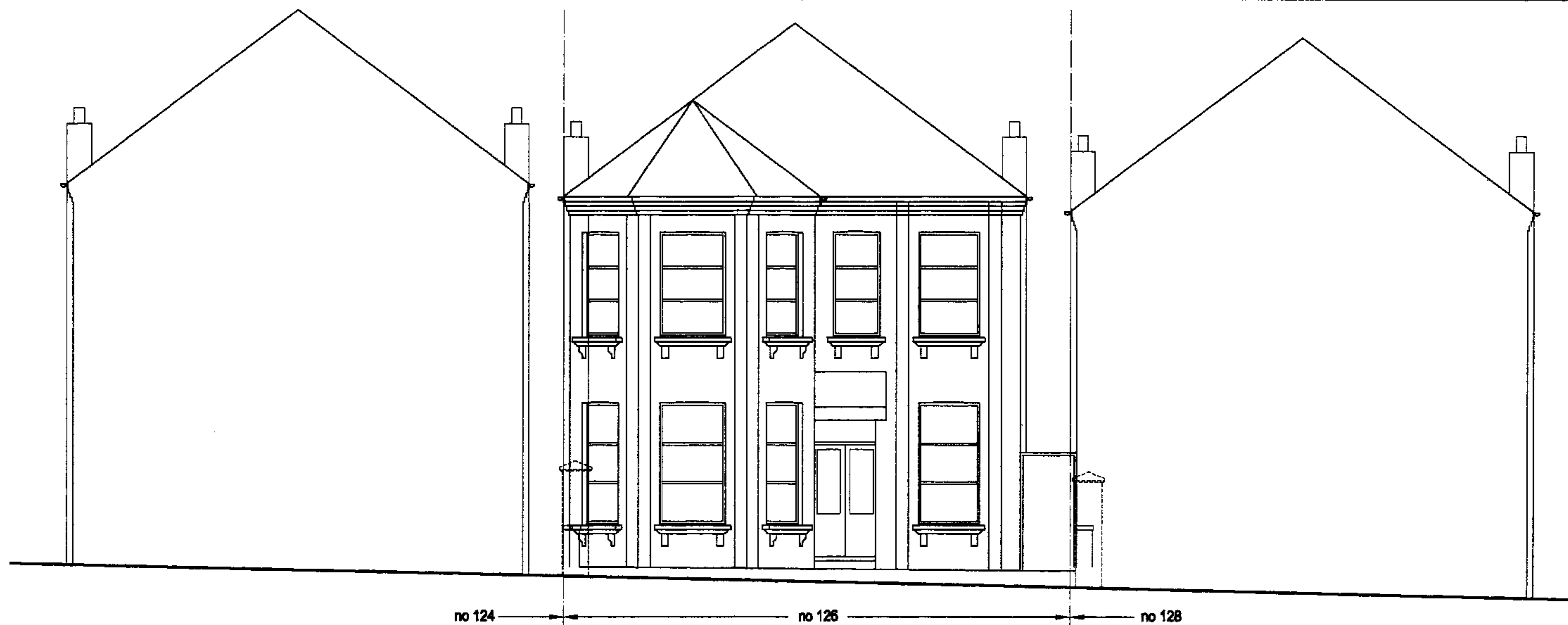
North East Elevation - to Fordwych Road