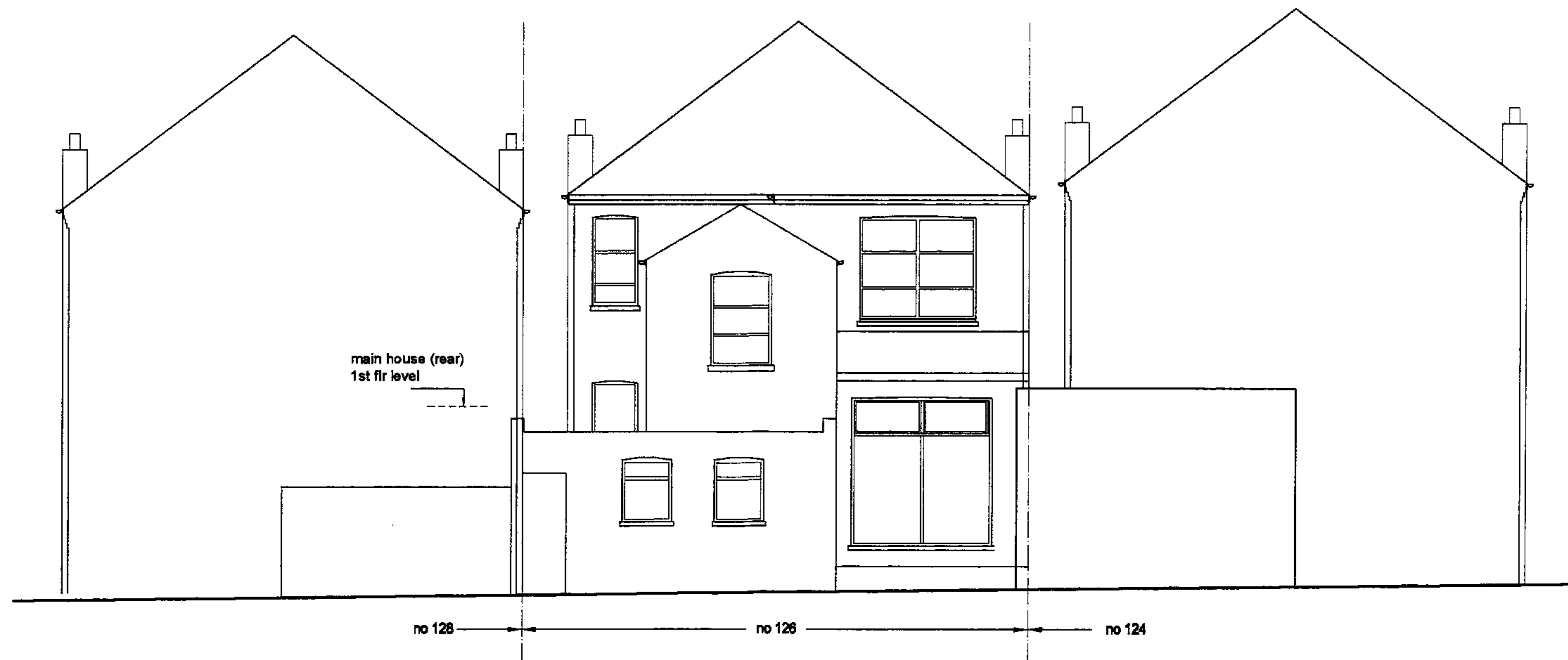
South West Elevation - to rear garden