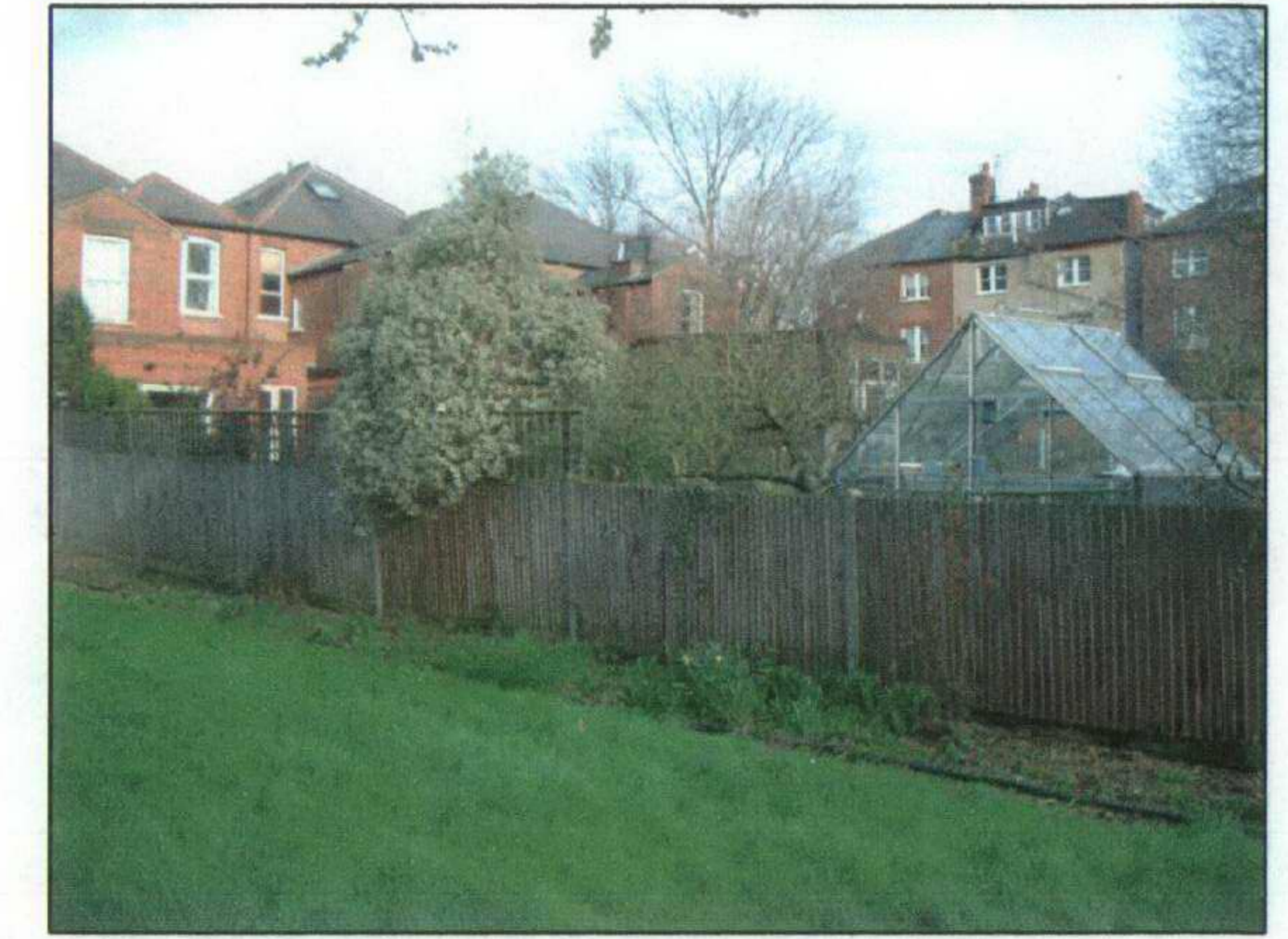
view of rear : neighbouring properties