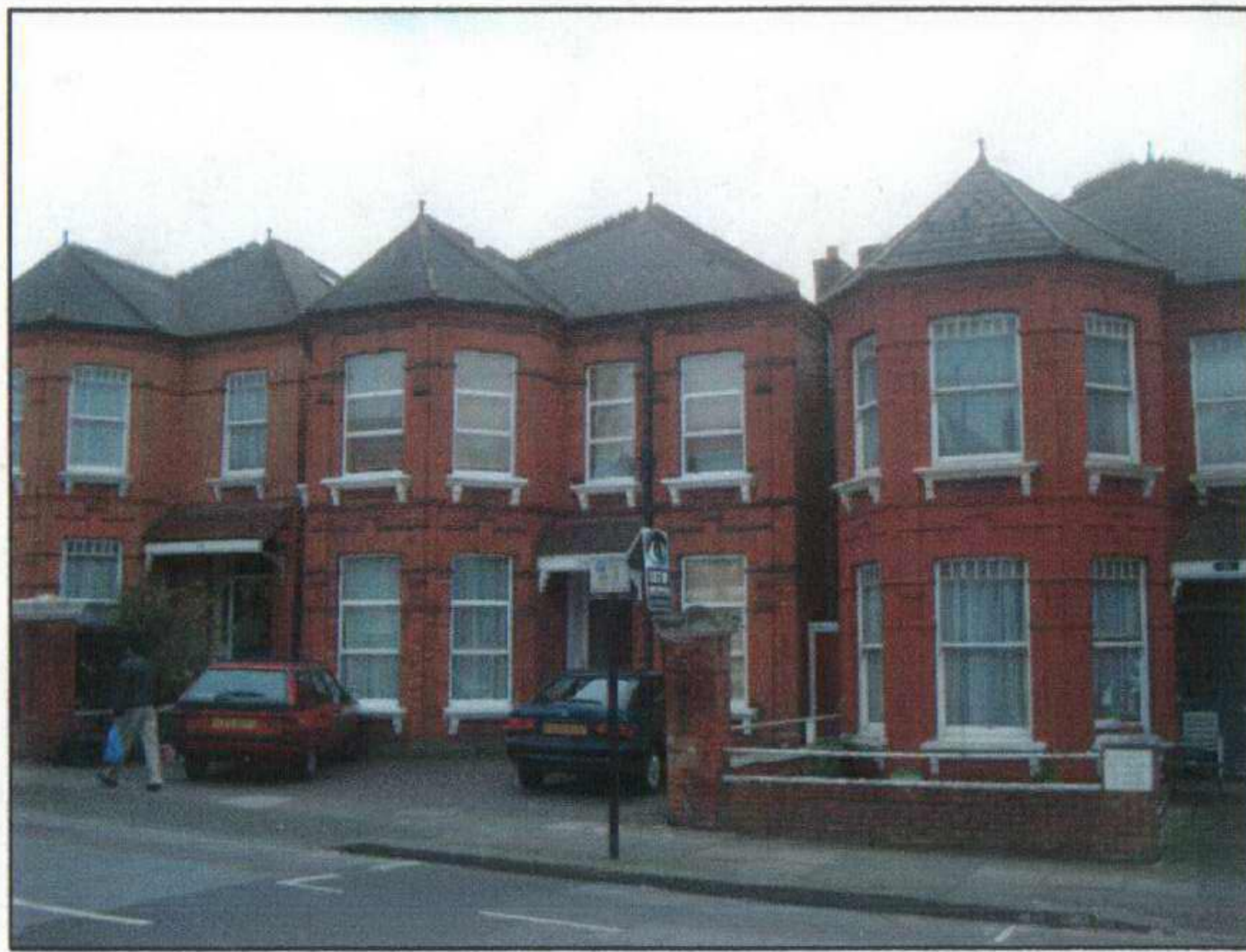
view from Fordwych Road