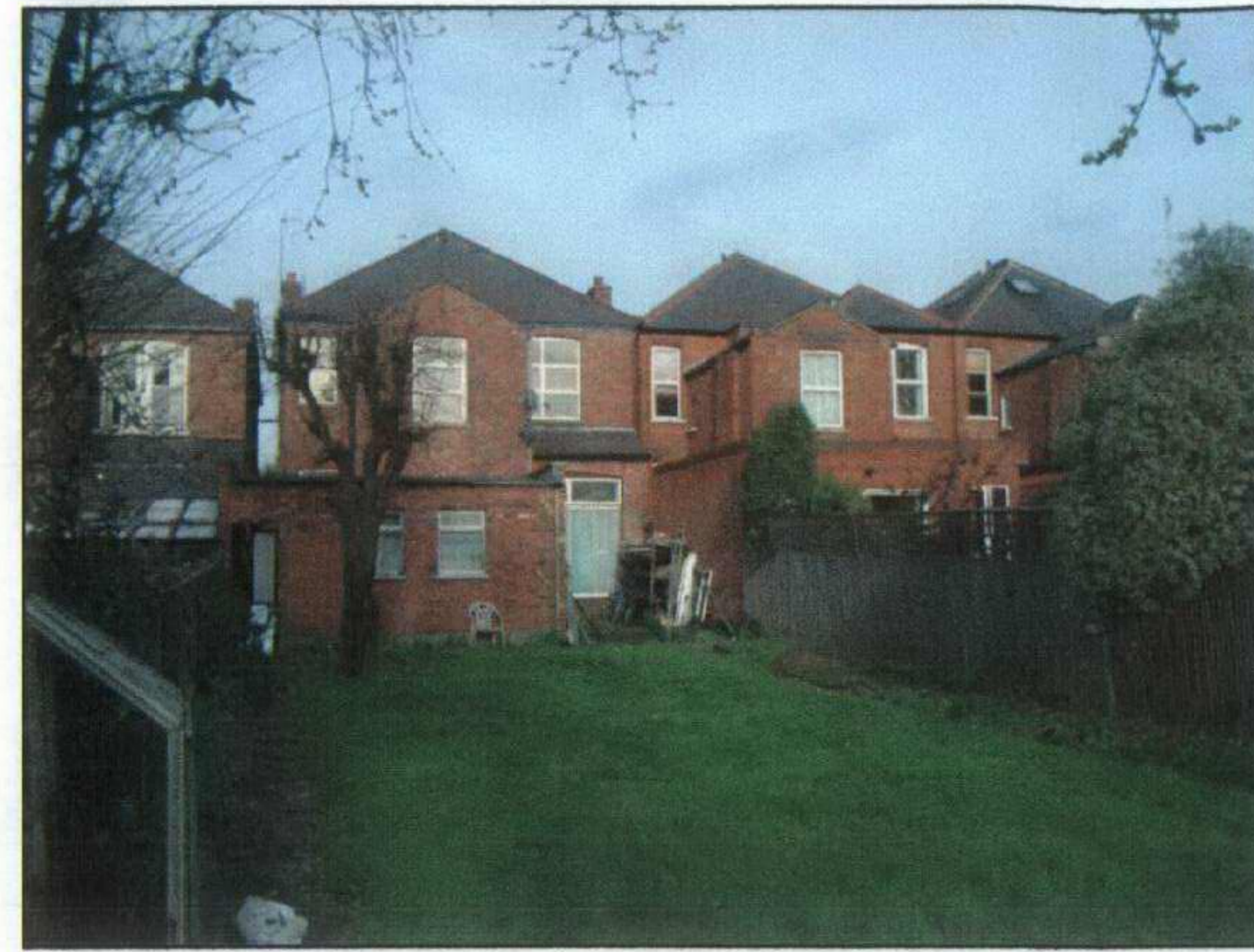
view from rear (looking North East)