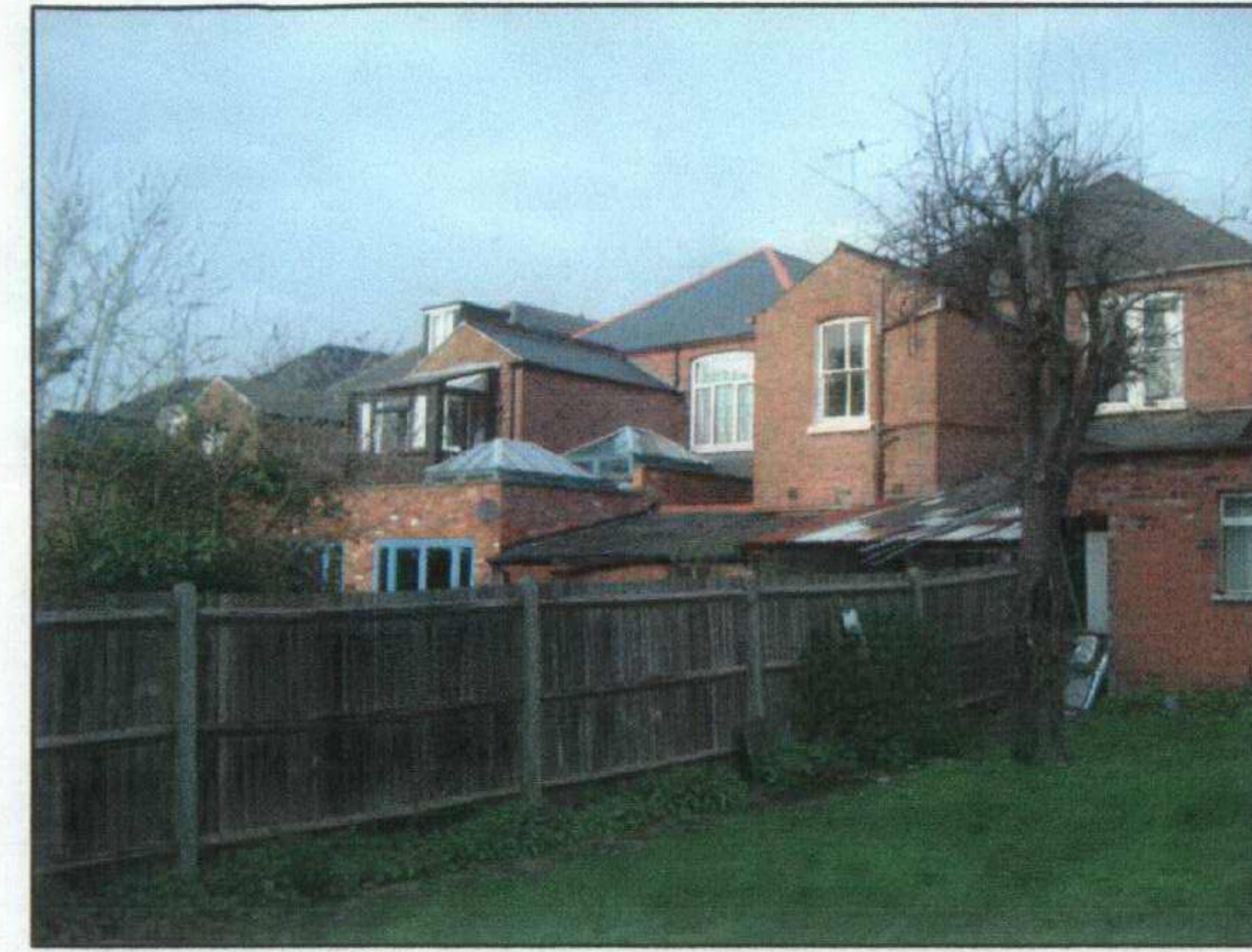
view of rear : neighbouring properties