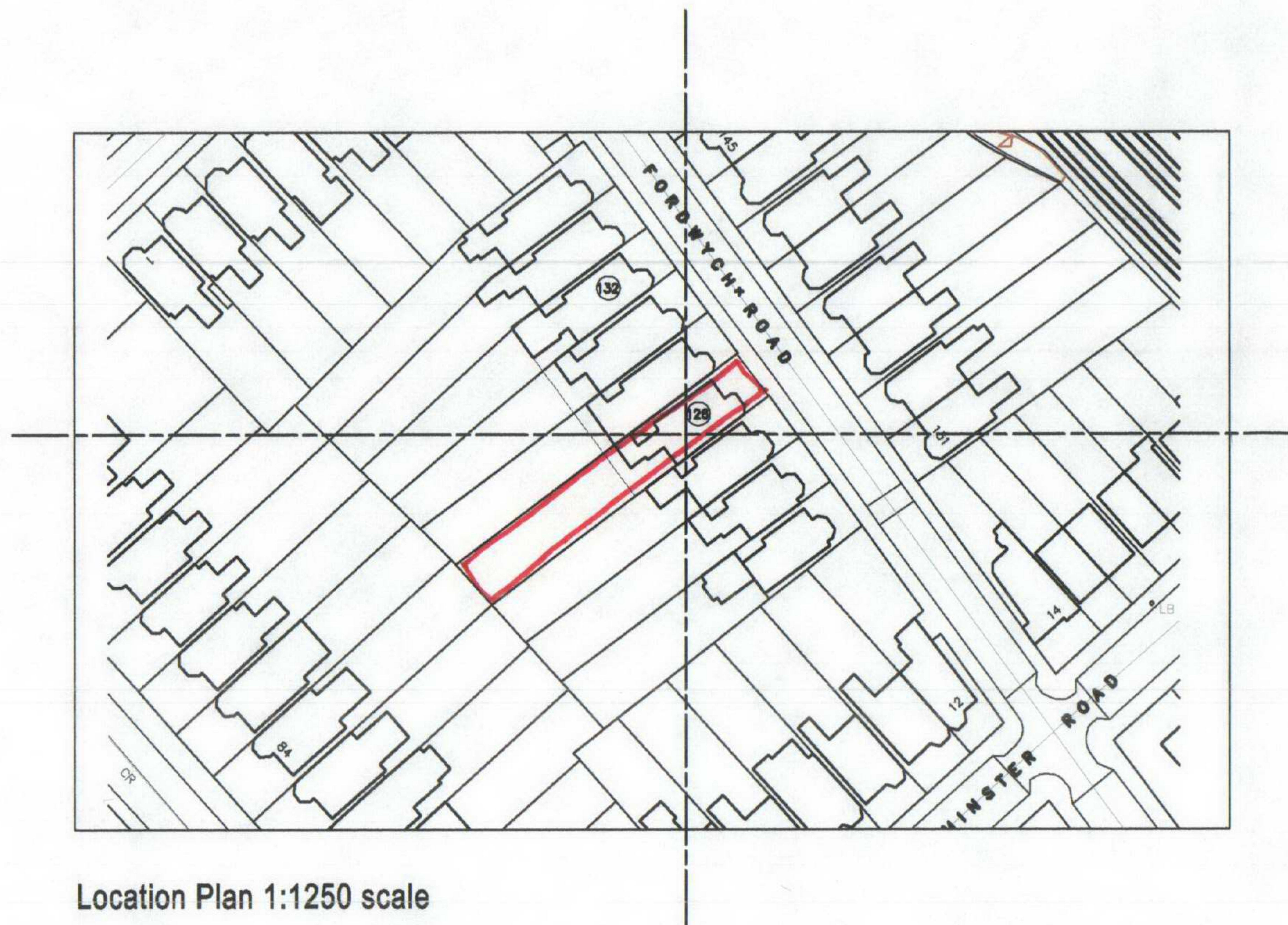
Location Plan 1:1250 scale