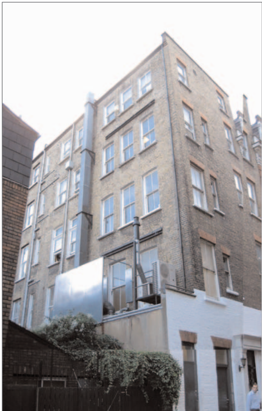
Top left: View of corner of building looking from other side of Baldwins Gardens. Note that no alterations whatsoever are proposed to the ground floor retail unit.