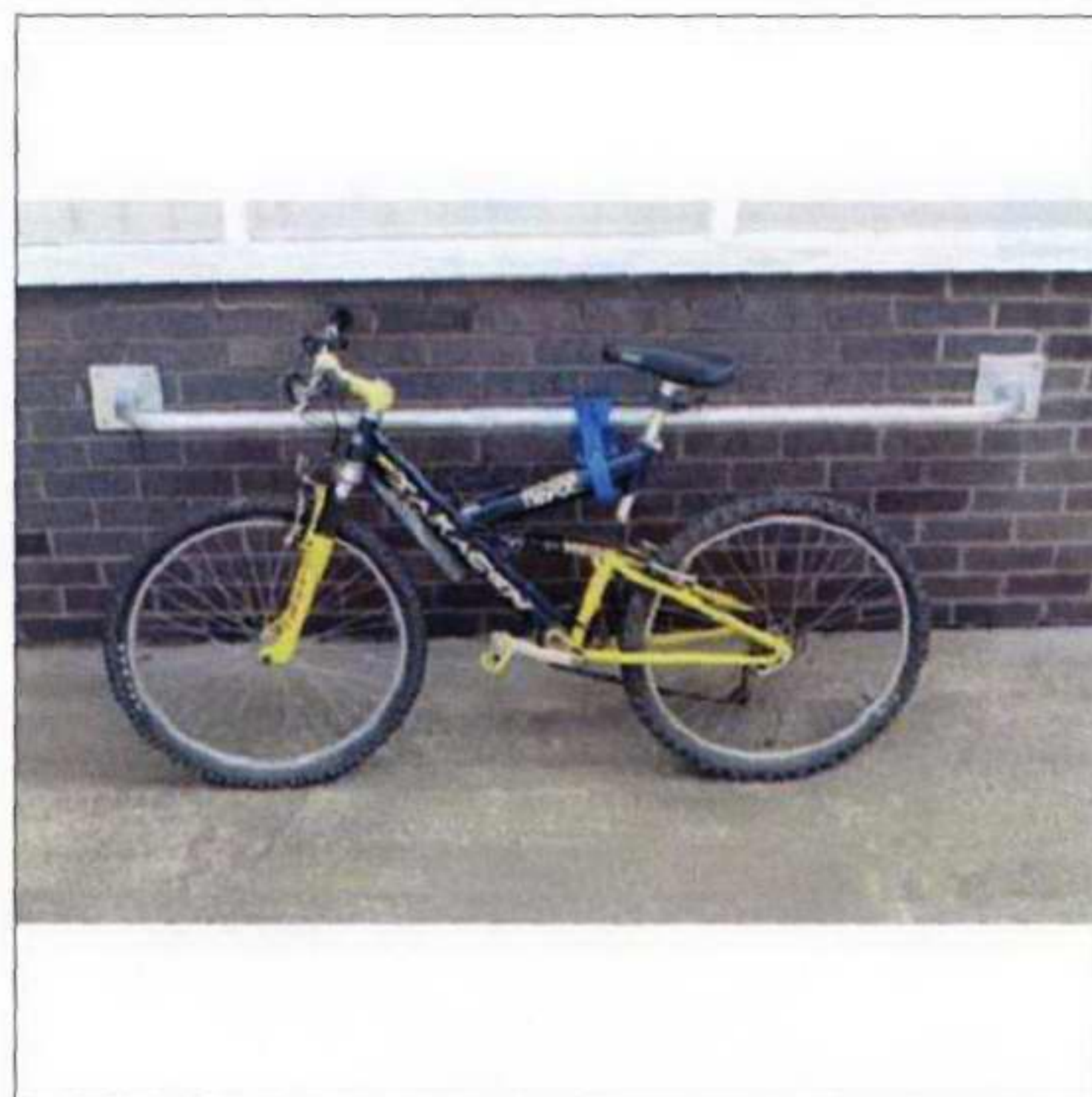
EXAMPLE OF 2m LONG "SECTIRY RAIL" FOR 2 BICYCLES. TO BE USED FOR PARKING SPACES 2, 3, 6, 7.