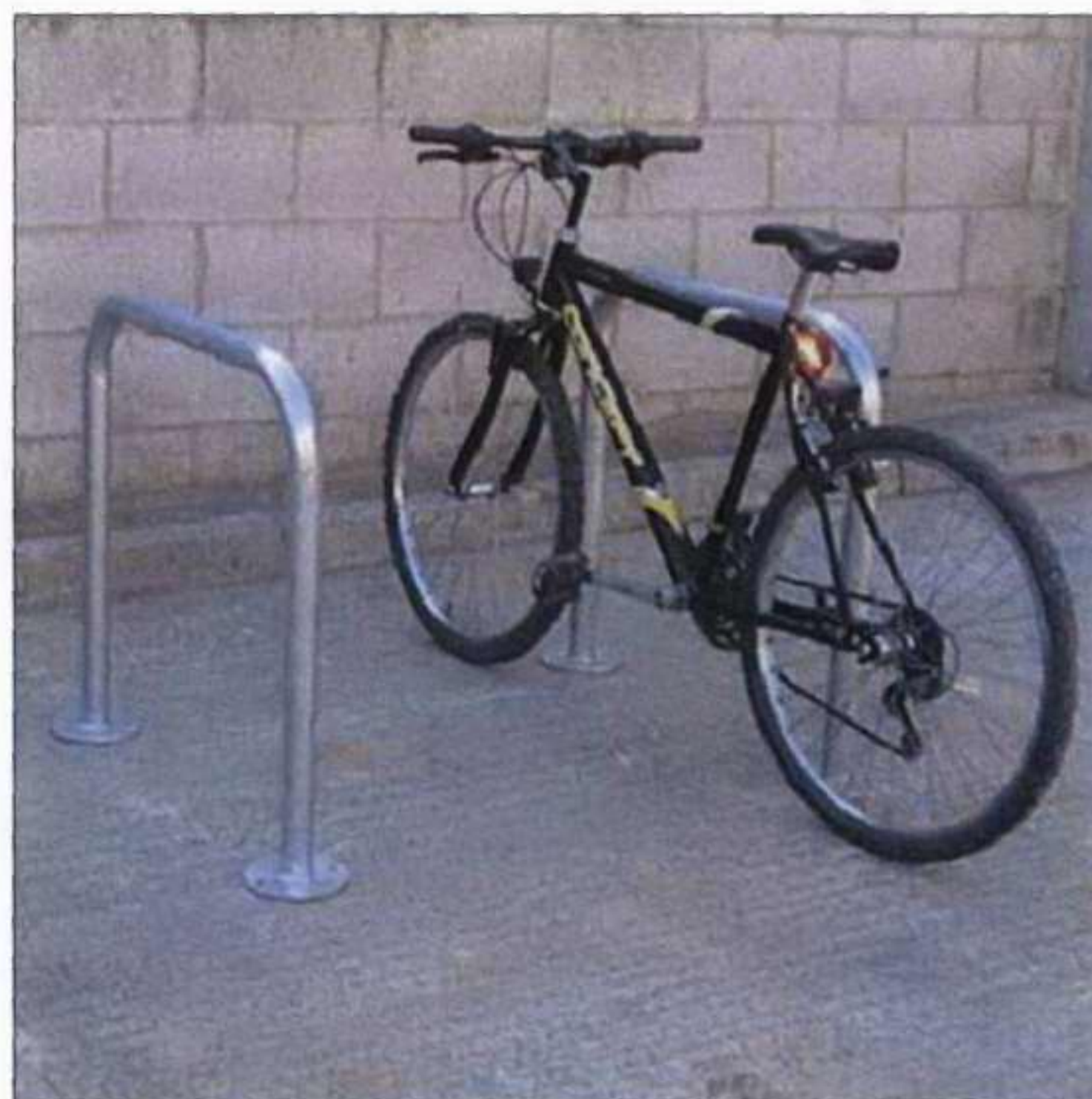
EXAMPLE OF SHEFFIELD STANDS TO BE USED FOR PARKING SPACES 1, 4, 5, 8.