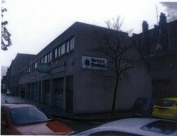
1. Front/End Elevation