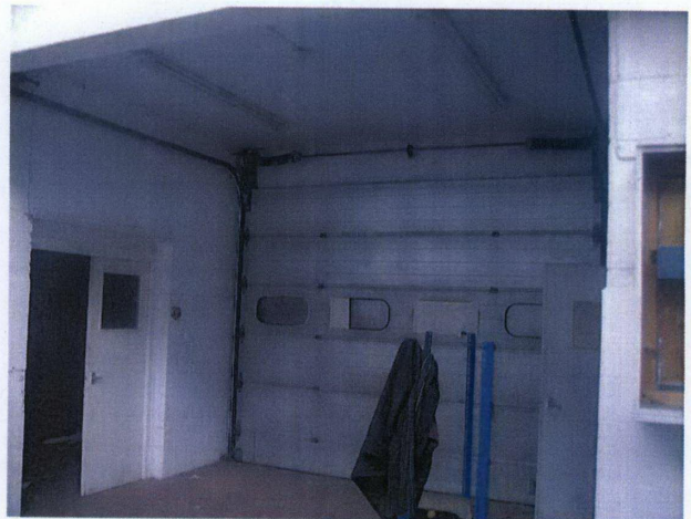
4. Typical Ground Floor Interior (No 20)