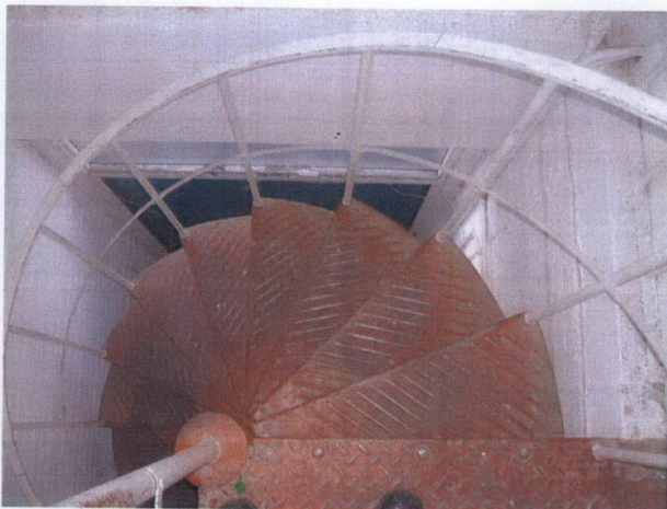
5. Staircase (No 22)