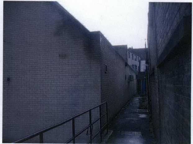
2. Rear Elevation