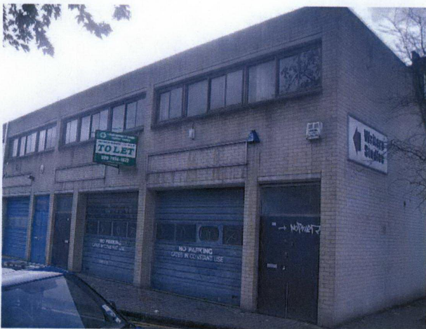
3. Front Elevation