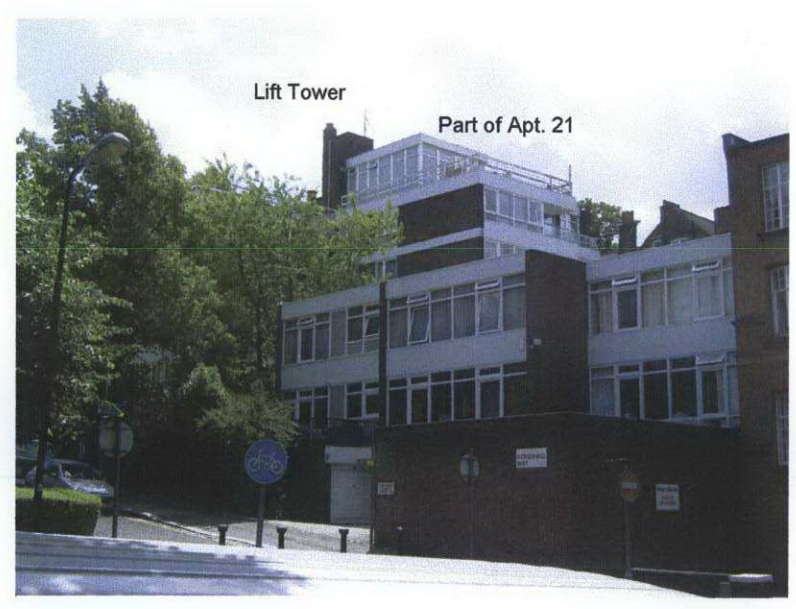
Views showing visibility of roof from surrounding streets