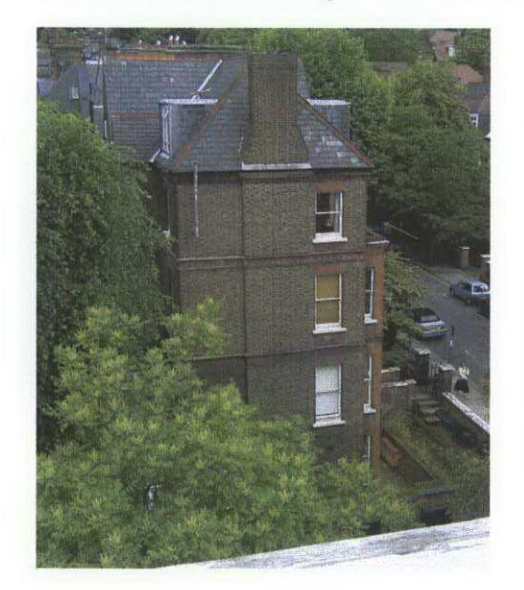
Views of surrounding streets from roof