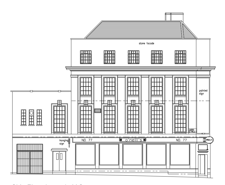
Side Elevation to Judd Street