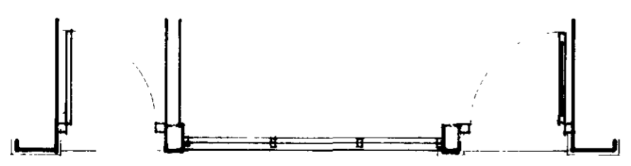
PLAN OF SHOPFRONT