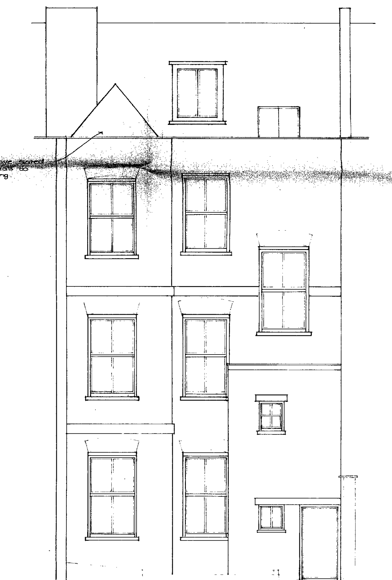
REAR ELEVATION - PROPOSED

not to be removed pieces are to be match existing