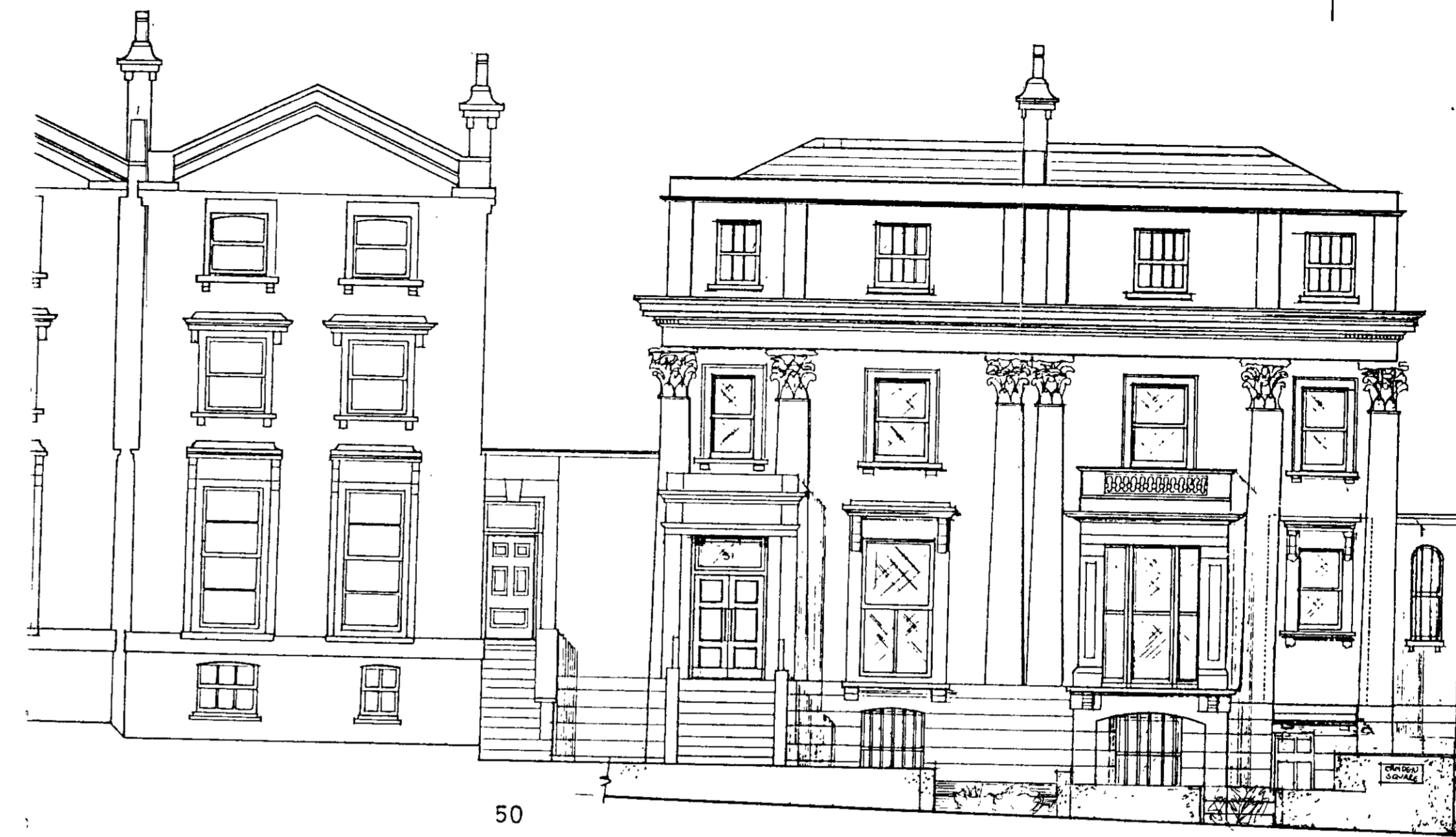
CAMDEN SQUARE ELEVATION 1:100