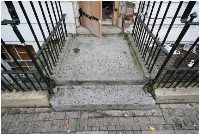
Front porch steps