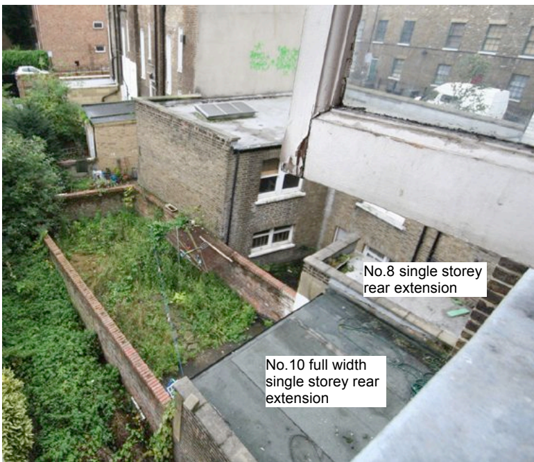
No.8 single storey rear extension