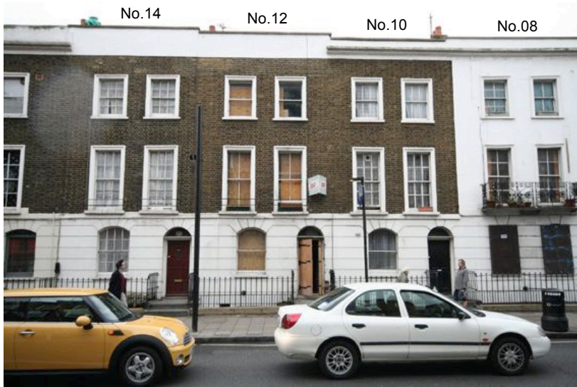
Camden Road elevation