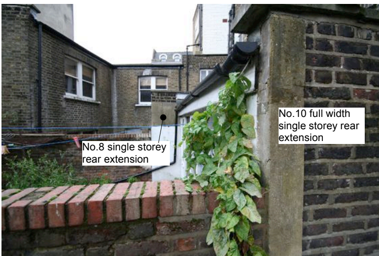
No.8 single storey rear extension