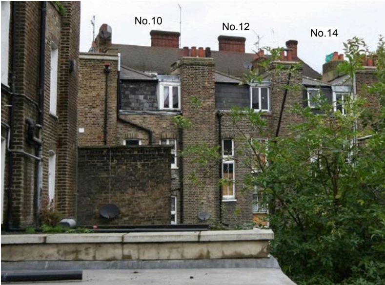
Rear elevation from Greenland Road