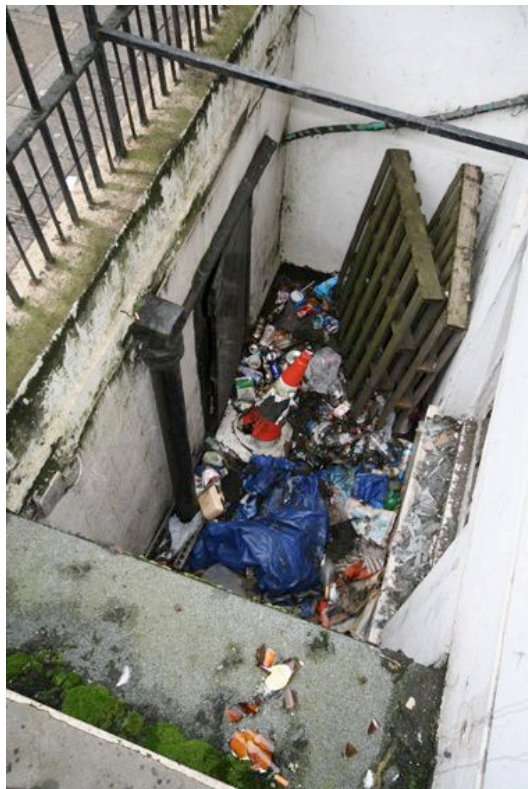
Front basement area