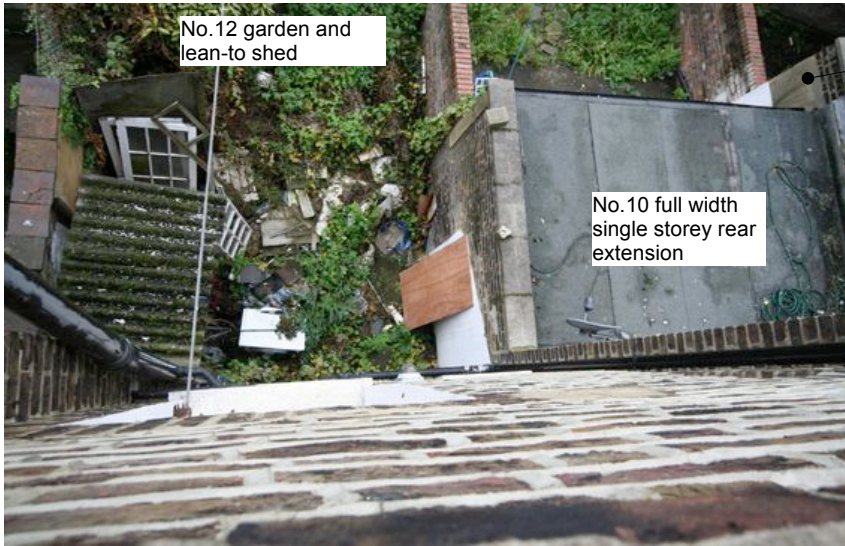
No.12 garden and lean-to shed