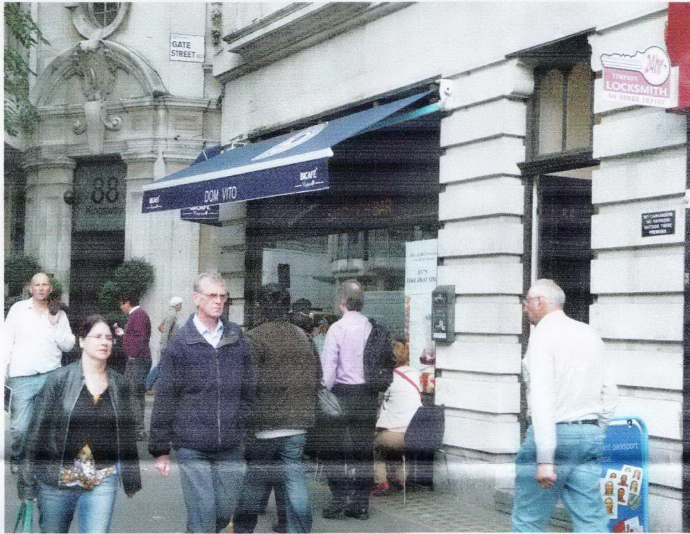
AS EXISTING EXTERIOR ELEVATIONS TO GATE ST. and KINGSWAY