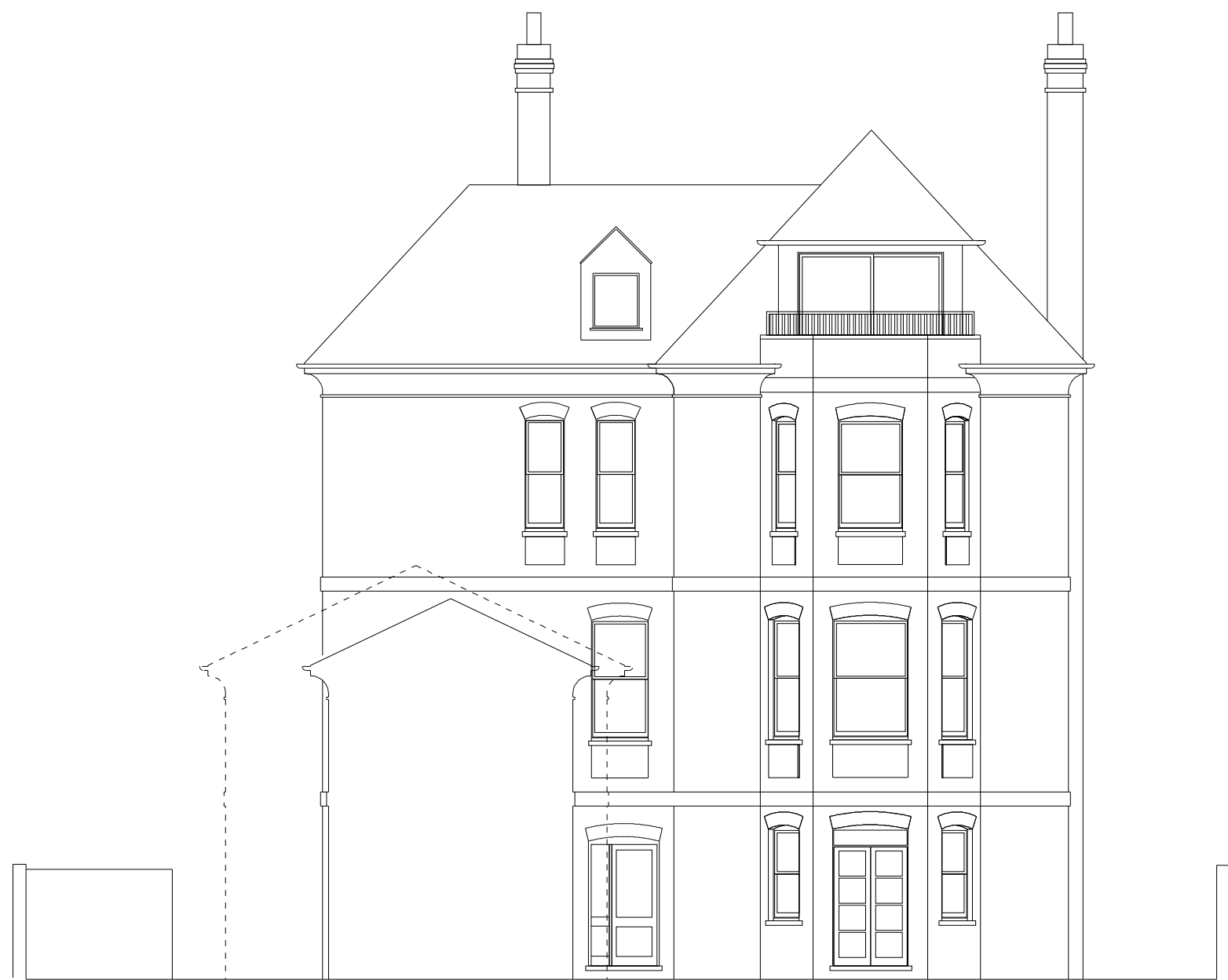
elevation facing north