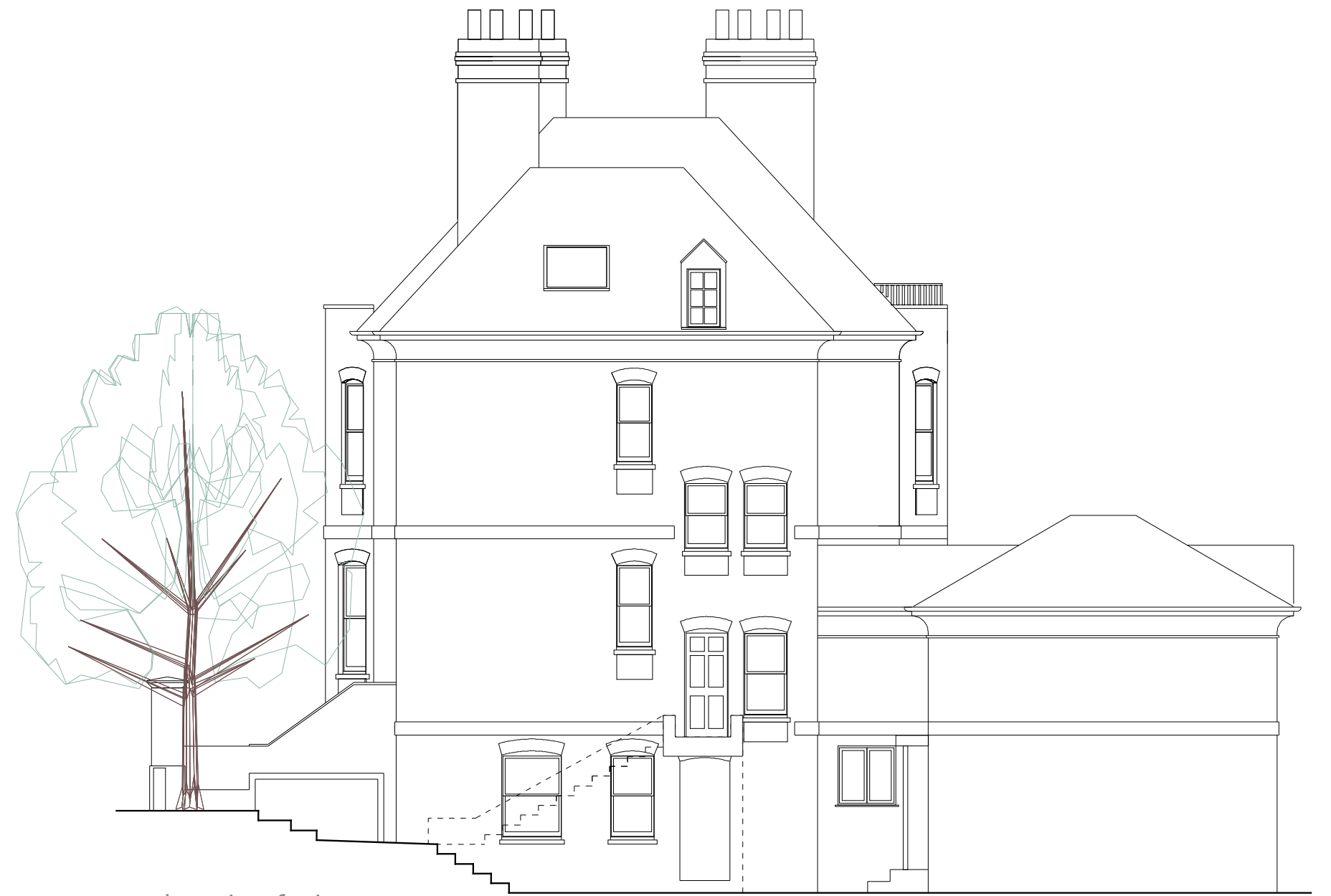
elevation facing east