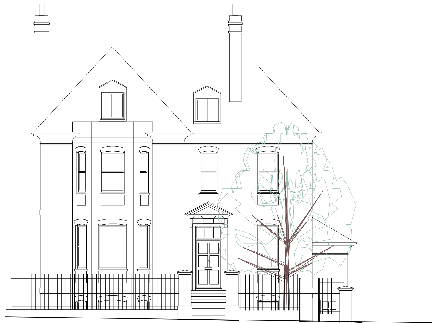
elevation facing south