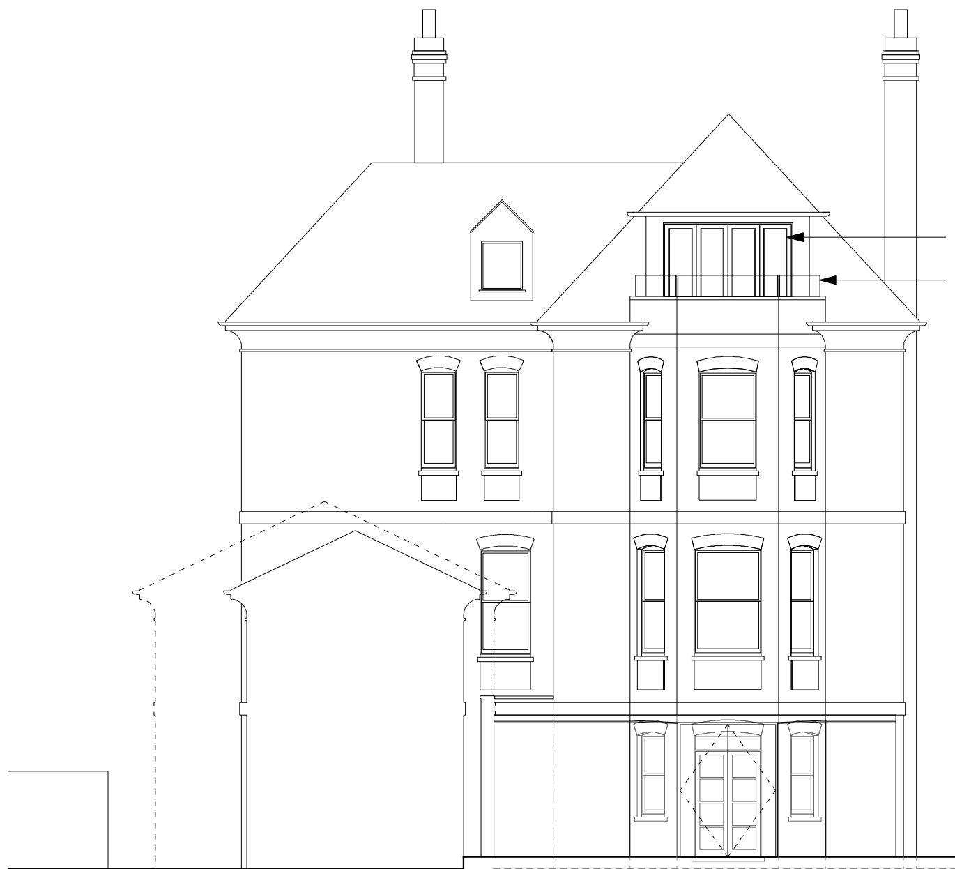
elevation facing north