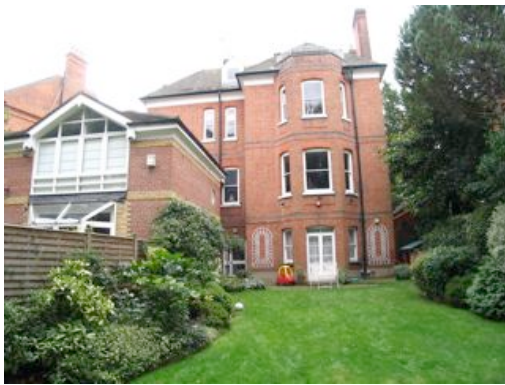
rear view of the property

The conservatory is to be a Cantifix frameless glass construction that is designed to replicate the profile of the rear bay. The design includes structural glass members and is to fit below the brick banding on the property so as not to detract from the line of the original building. The original brick walls with the new conservatory are to be retained with their original brick finish. The floor level externally is to be raised to that of the internal lower floor level to provide a seamless junction between the two areas. It is also proposed to use the same natural stone floor finish both within the new conservatory and the external patio area adjacent to the conservatory.