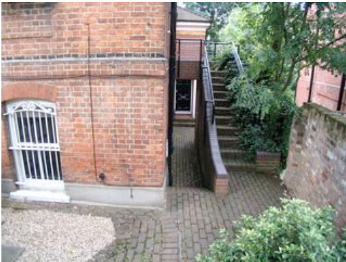
access staircase to upper flat

Built in 1881 11 Hampstead Hill Gardens is a detached brick built property with a small semi detached separate property located to the rear and known as the Garden House. The main house was converted in the 1980's to form two self contained flats and it is assumed the construction of the Garden House also took place at this time. Access to the flat on the top two stories is via an external staircase located to the right hand side of the building. Access to the lower two story flat is via the original main entrance door.