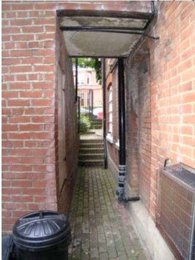
side view showing underside of the staircase and the position of the original lower ground floor doorway to the right of the picture

The original side access door is to be reinstated to provide access to the front of the property.