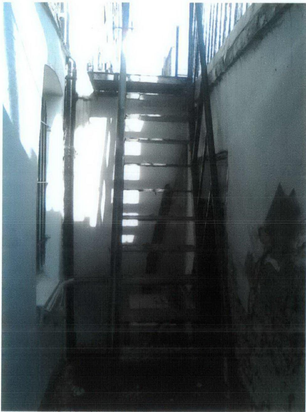
existing stair/ladder from lightwell