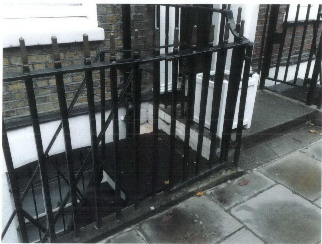
railings and gate, existing stair