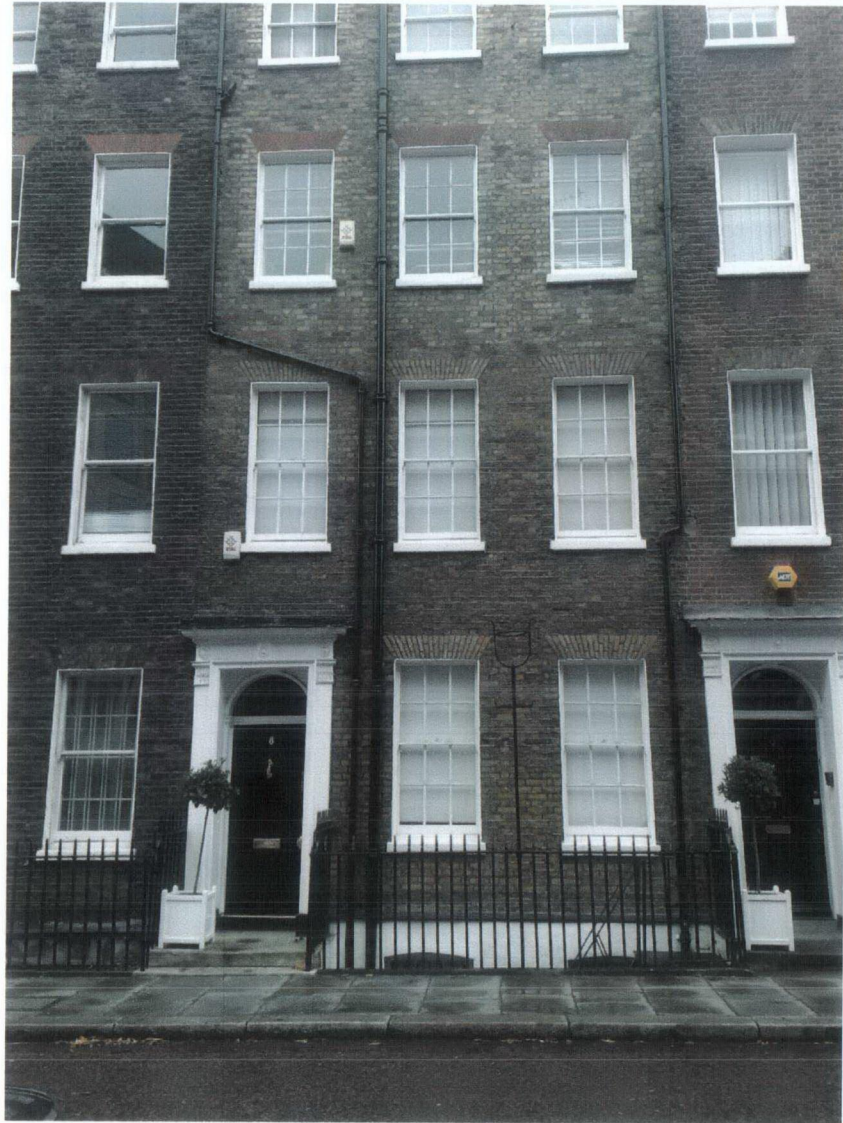
front elevation and railings