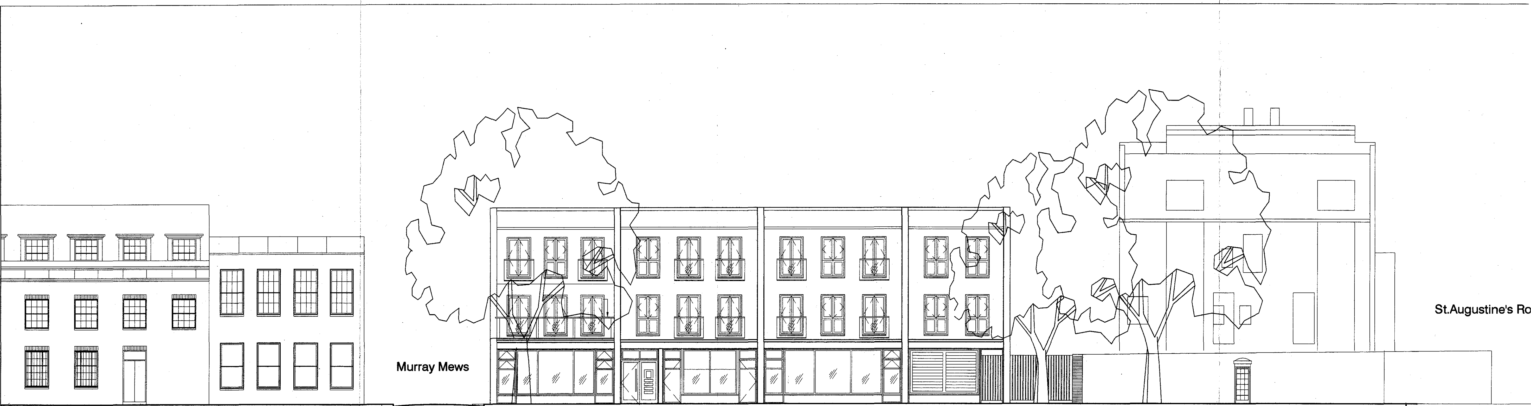
South Elevation to Murray Street as existing