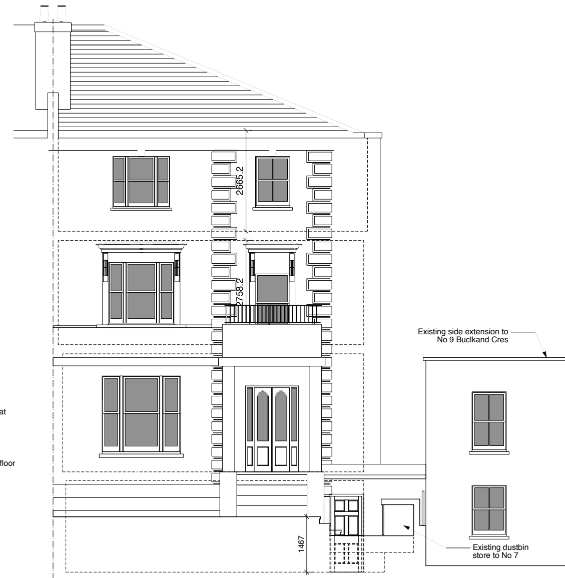
FRONT ELEVATION - EXISTING