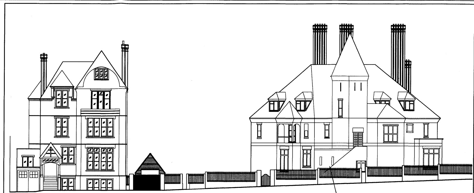
EAST HEATH ROAD ELEVATION SCALE 1 : 200