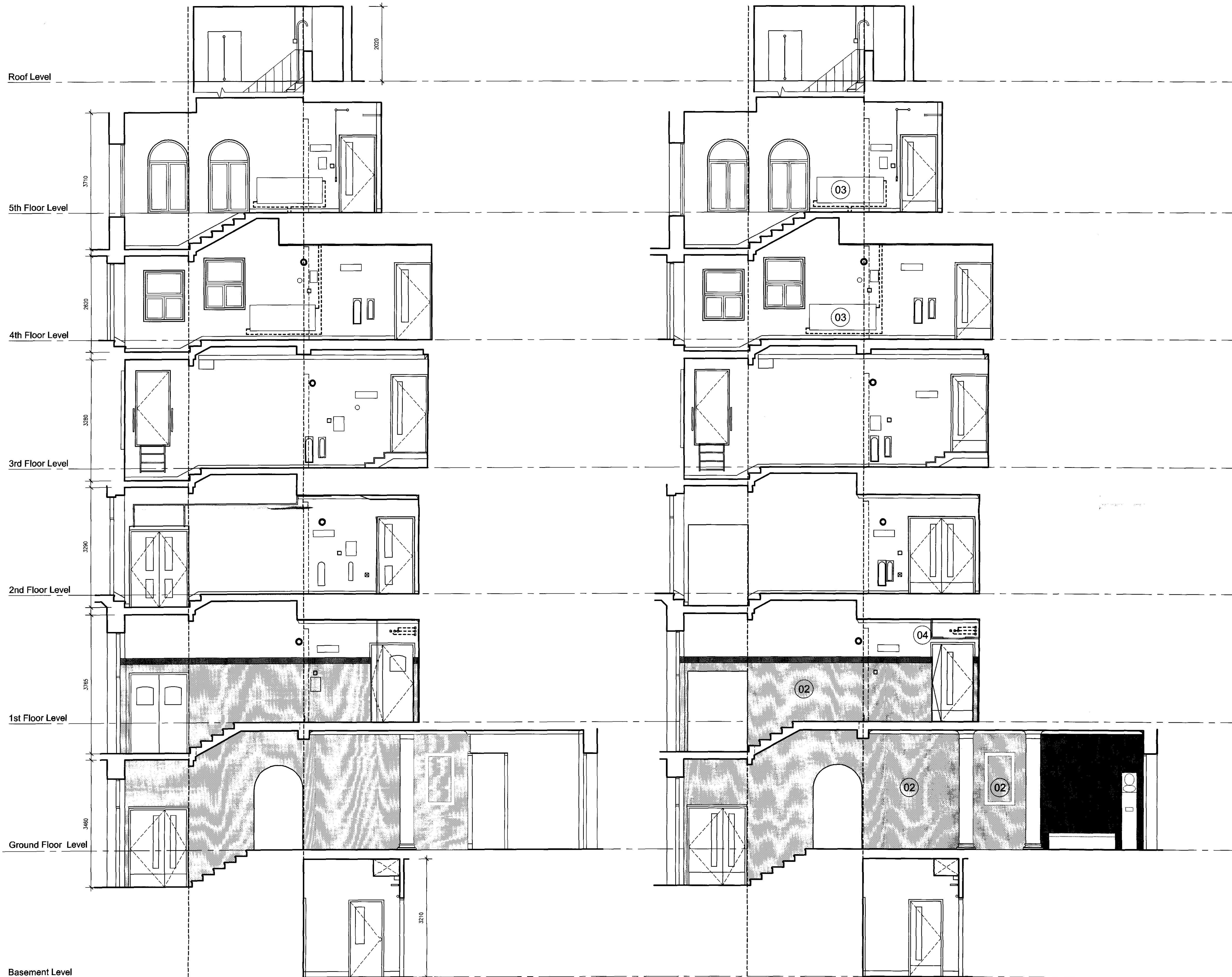
Section D - D - As Existing