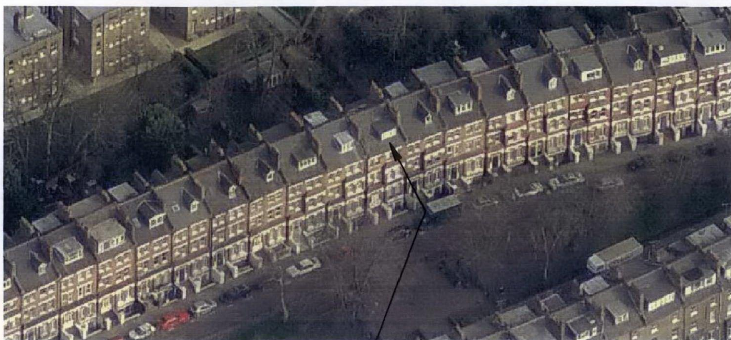
Ariel Photo no. 2 – Existing Street Facade

No.26a Existing front dormer does not take any design cues from the original facade.