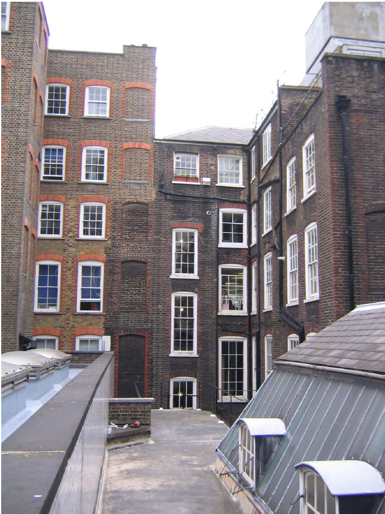
Rear of building seen from the roof of the Hall