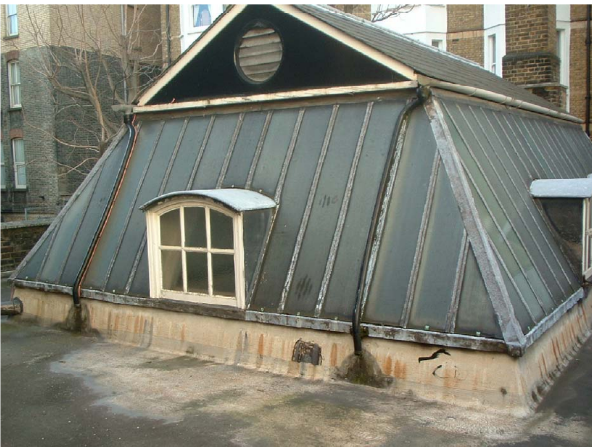
Roof of Guild Hall