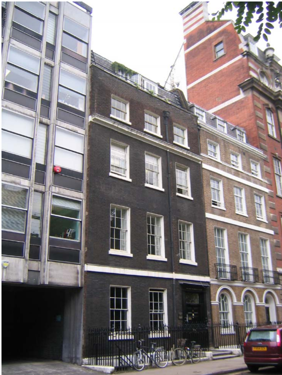
The Art Workers' Guild Entrance seen from Queen Square