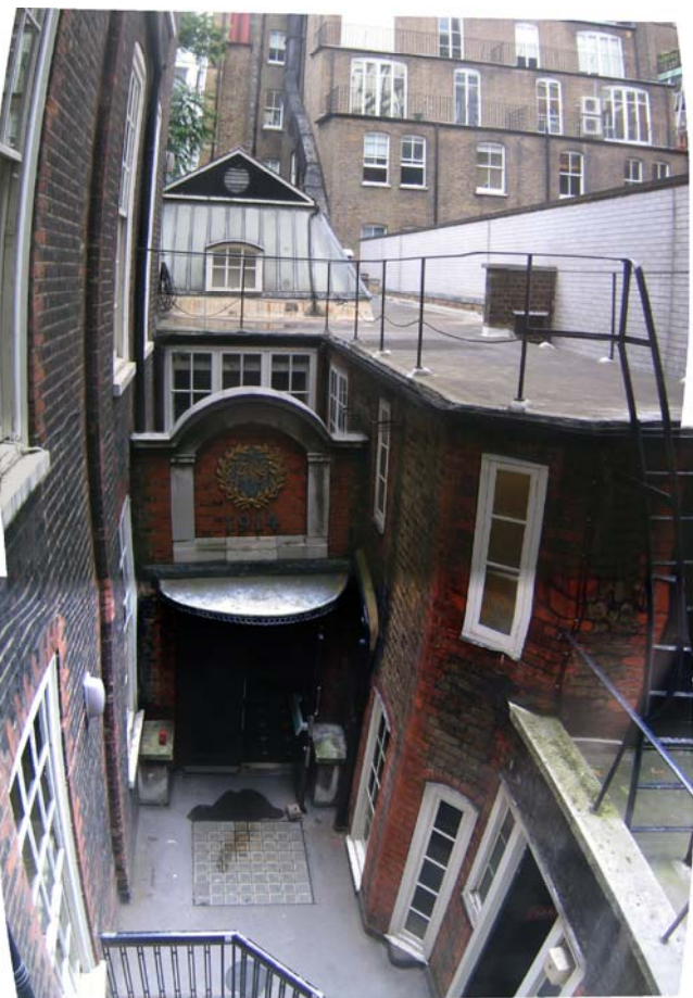
View of Courtyard seen from the staircase landing on First Floor