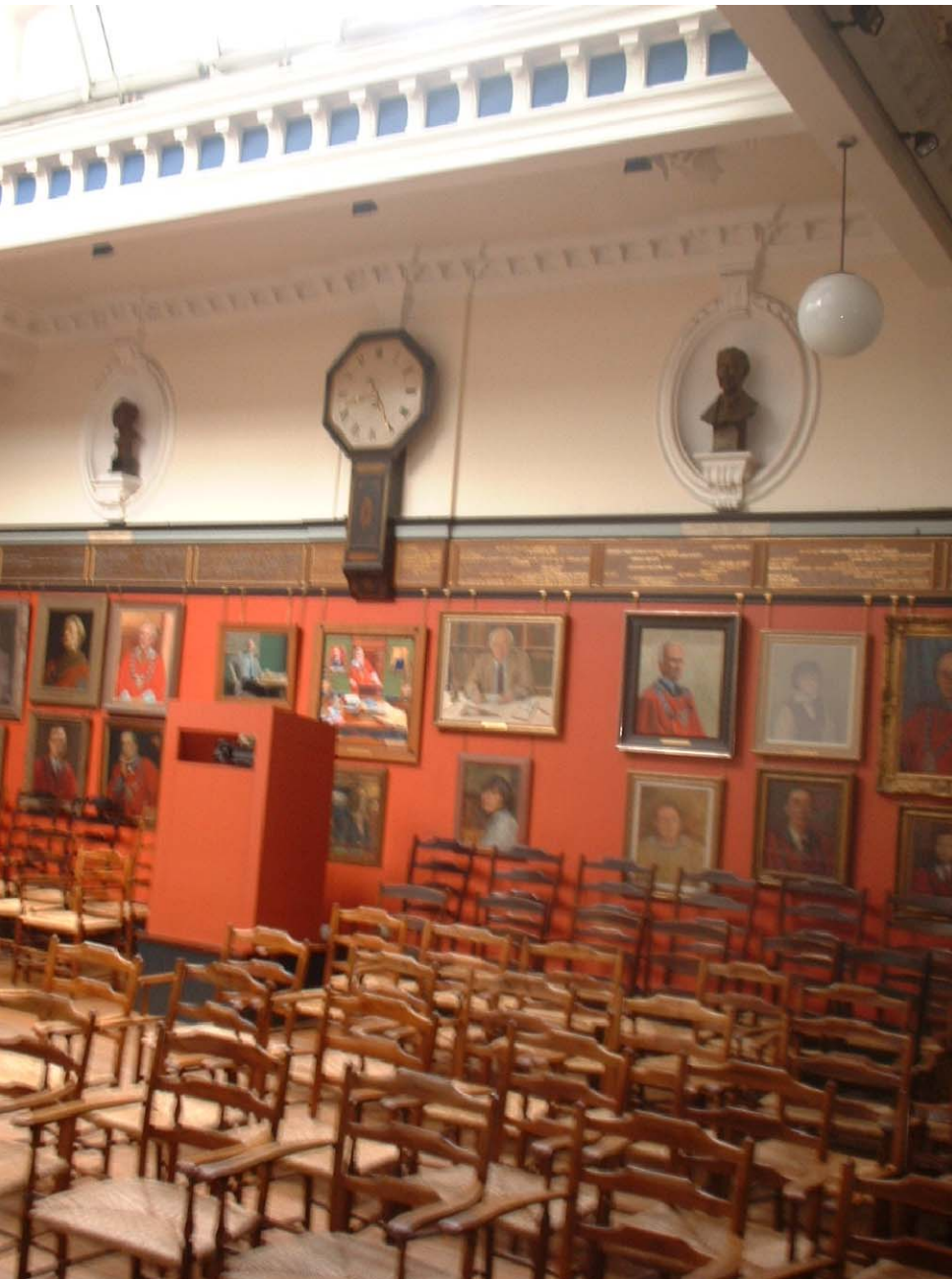
Internal view of Guild Hall