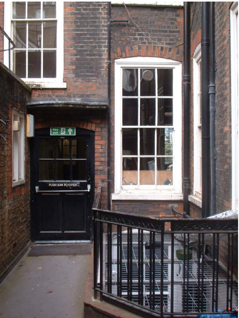
Back Entrance to main building from Courtyard