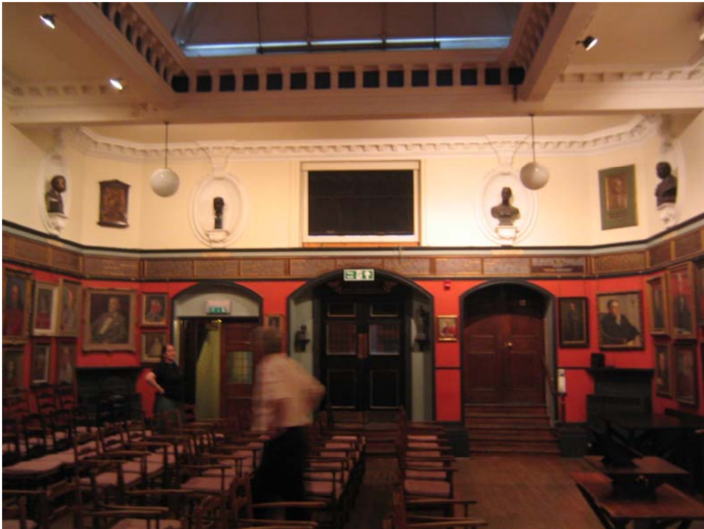
Guild Hall looking towards Entrance