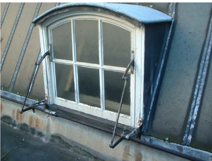
Window in roof of Guild Hall