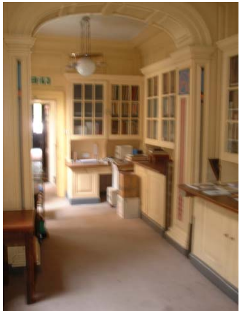
View of closet wing on Ground Floor