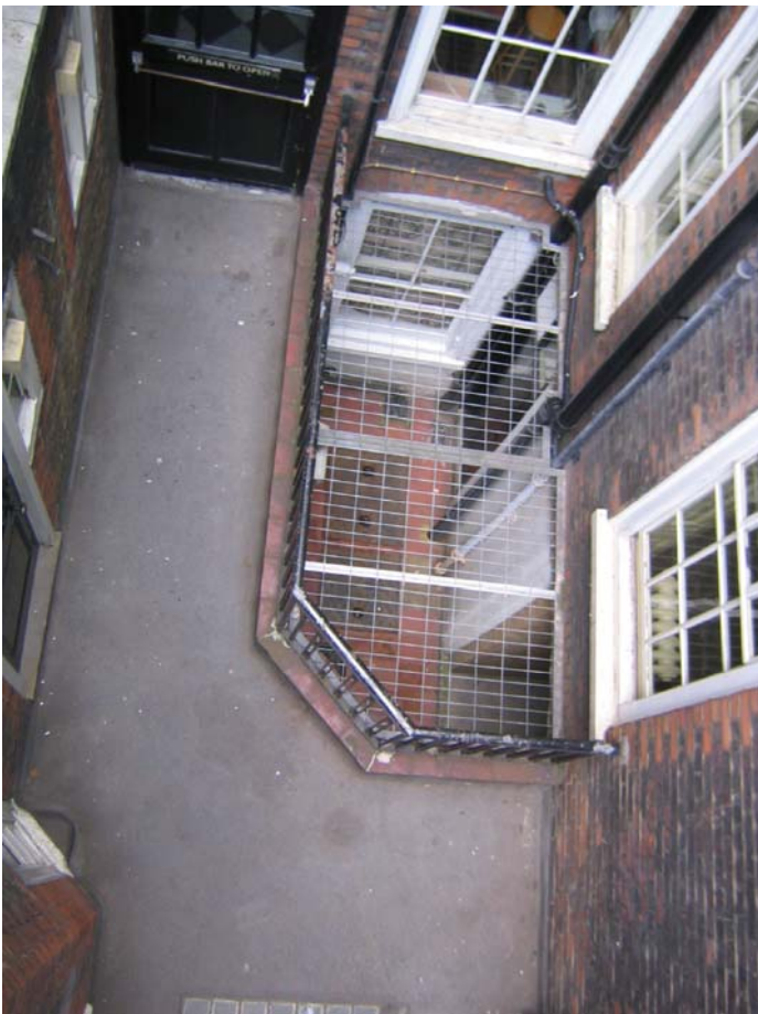
View of Courtyard seen from the roof of the Hall