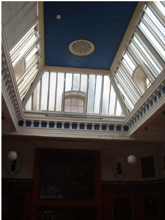
Roof of Guild Hall seen from below