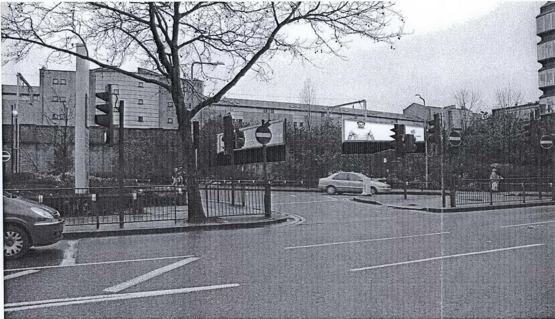
Image Showing Visual Impact on Streetscape