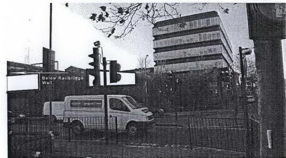
Approach to Billboards