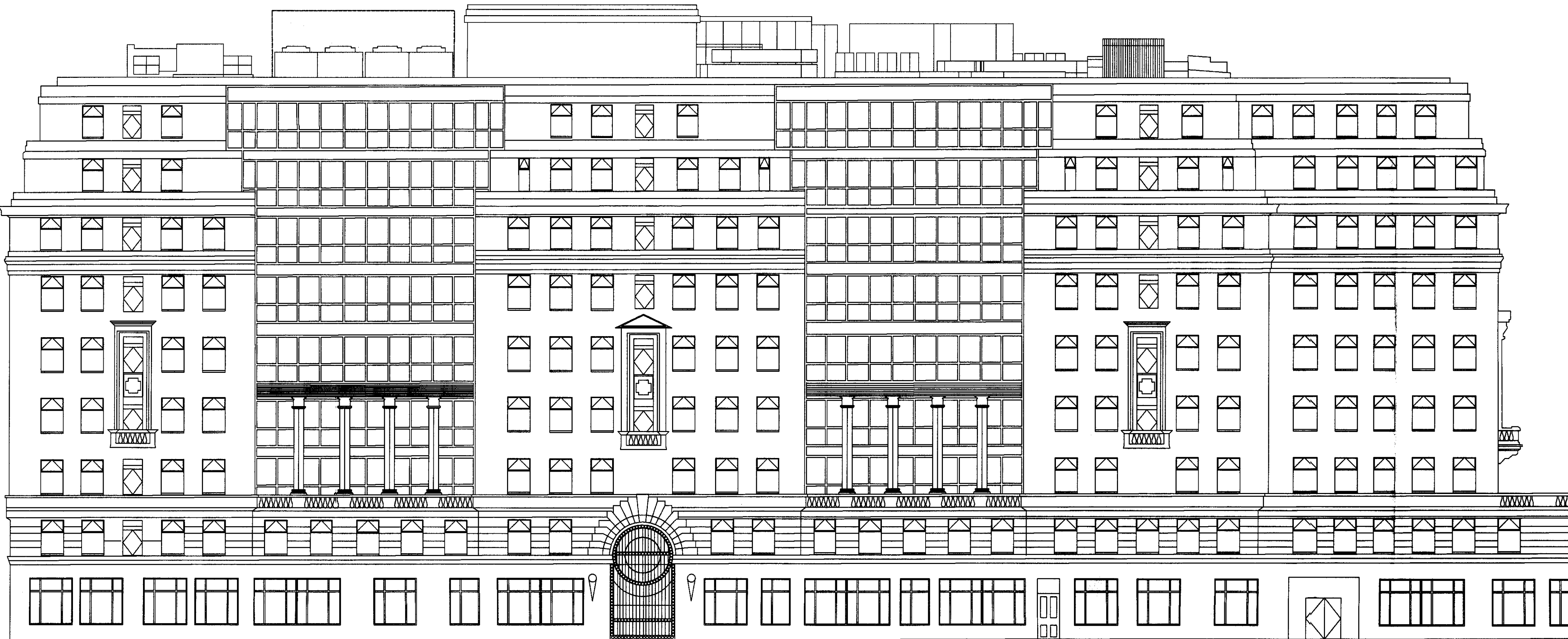
ST. GEORGE'S COURT NORTH ELEVATION ALONG BLOOMSBURY WAY