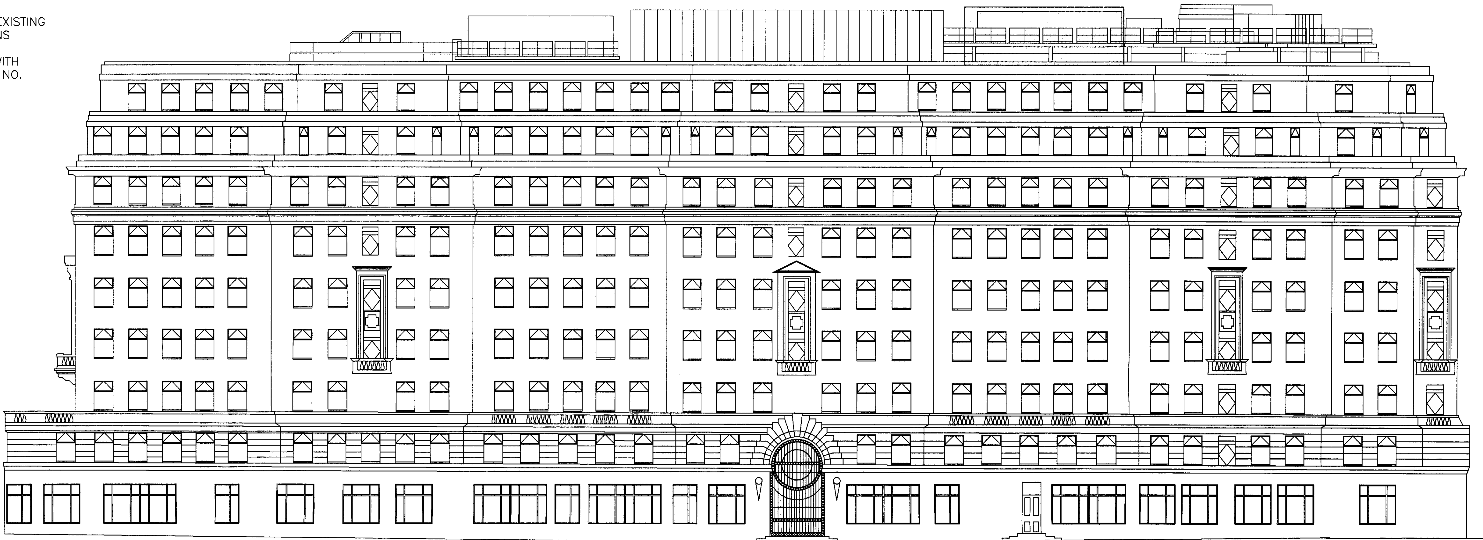
ST. GEORGE'S COURT SOUTH ELEVATION ALONG NEW OXFORD STREET

TO BE READ IN CONJUNCTION WITH ROOF LAYOUT - EXISTING, DRG NO. SGC/539944/9