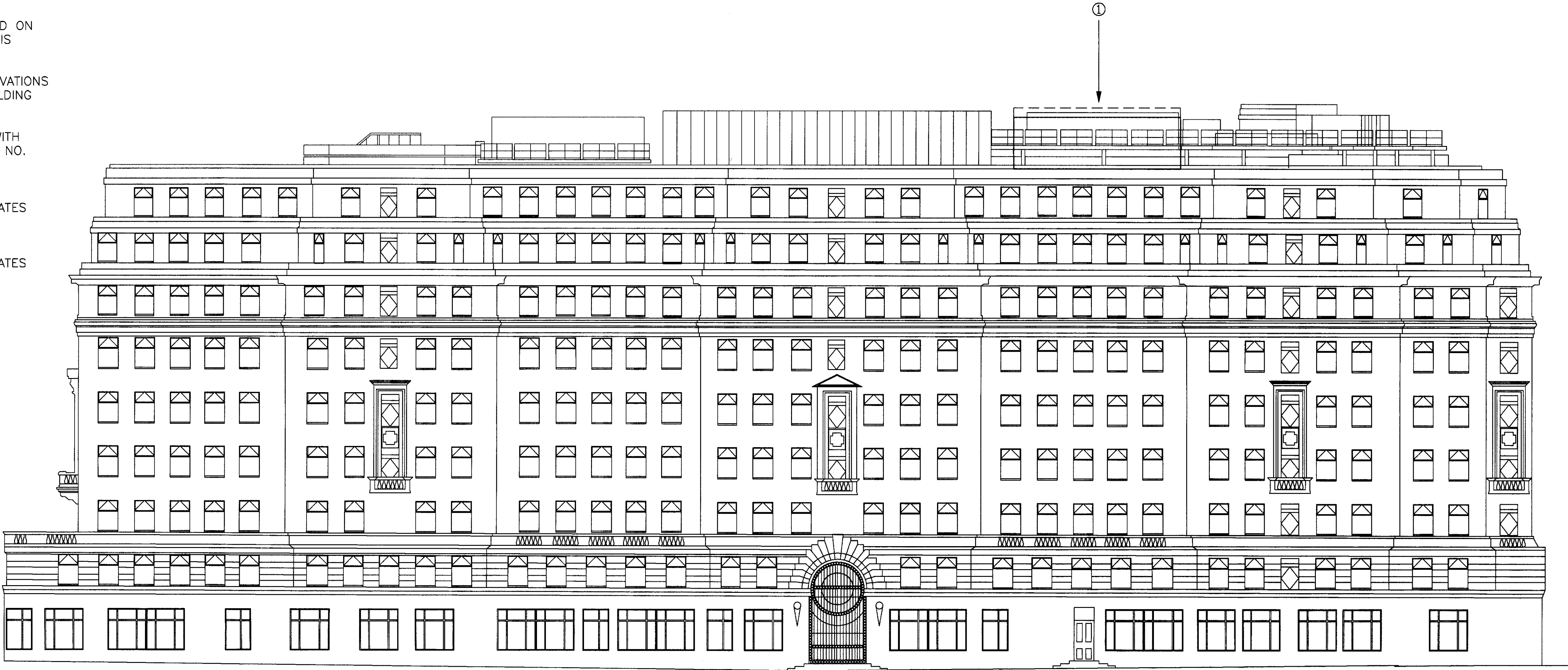
ST. GEORGE'S COURT SOUTH ELEVATION ALONG NEW OXFORD STREET