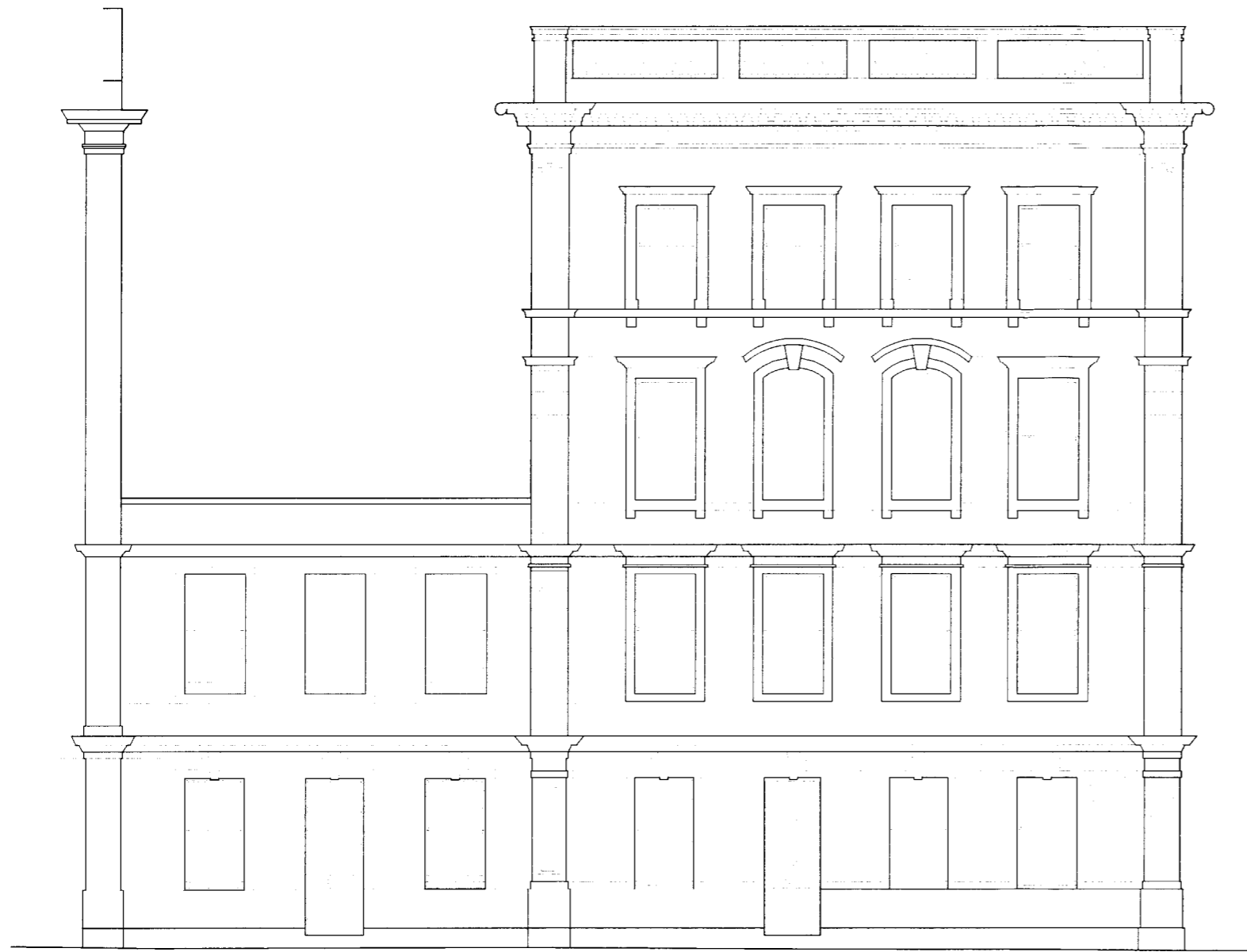
ENTRY TO 1A COPTIC STREET