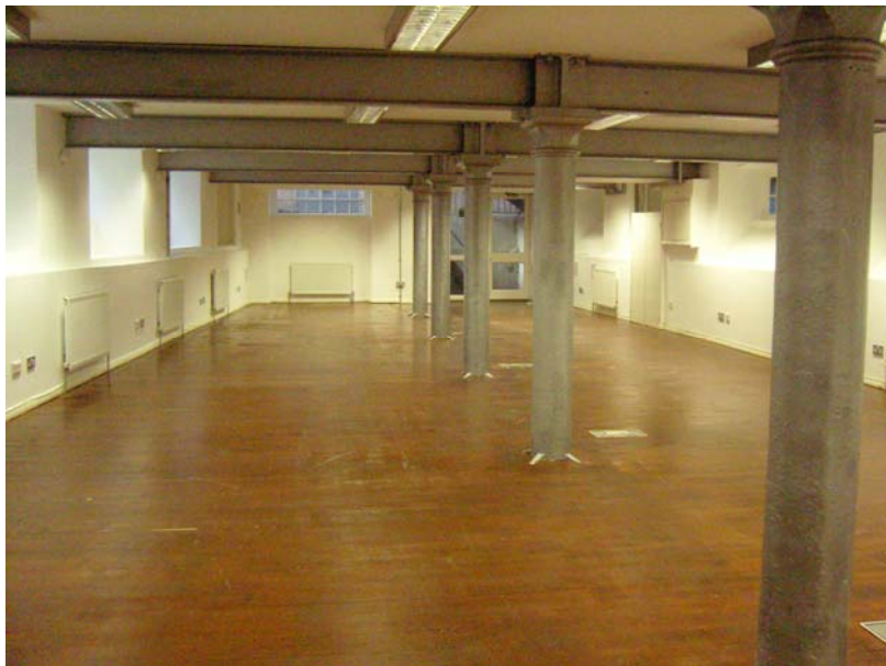
Interior view of the premises.