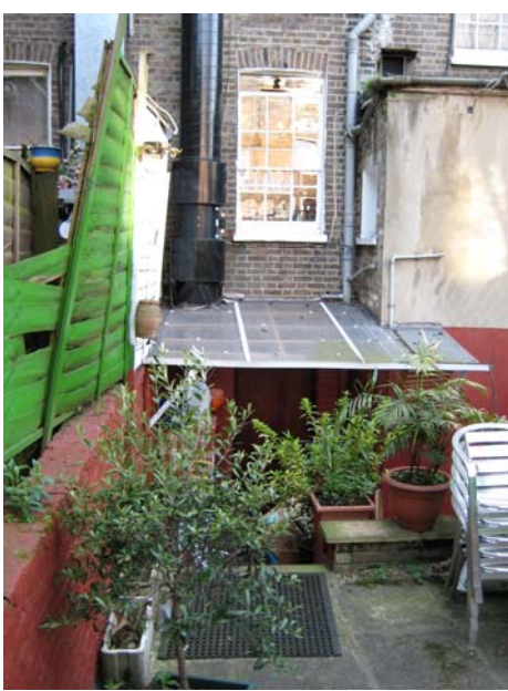
rear view no. 15