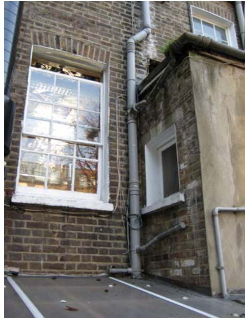
view towards no. 16