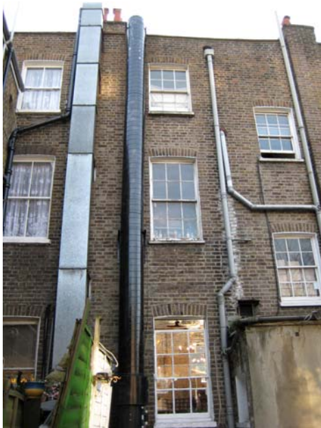
rear view no. 15