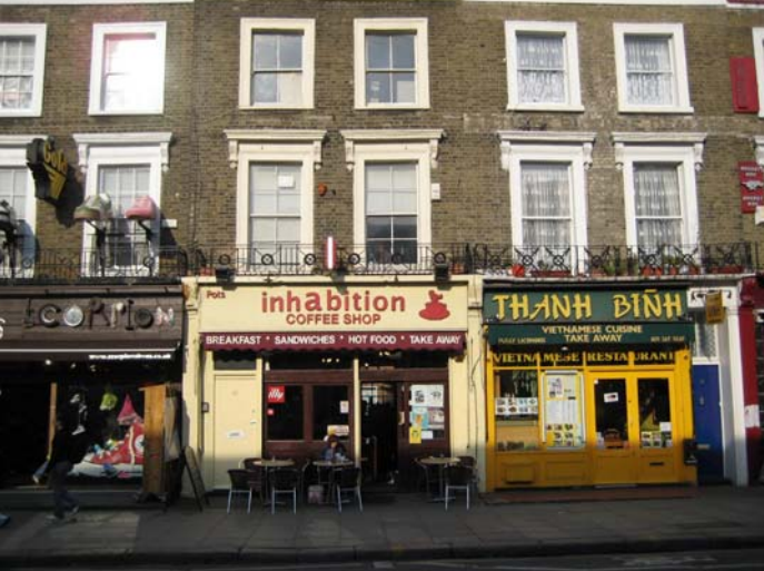
Chalk Farm Frontage