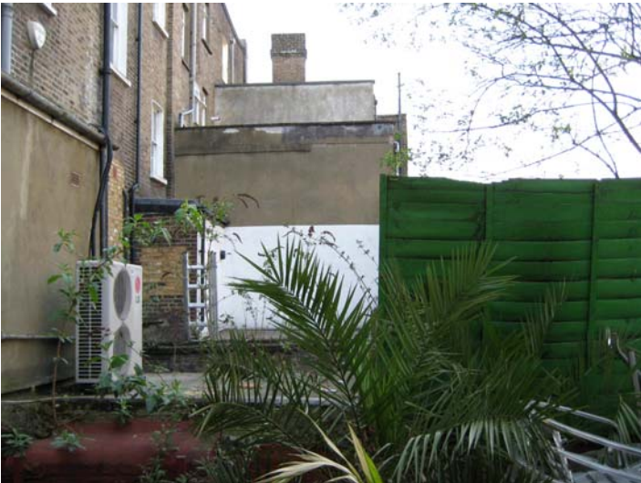
view towards no. 16