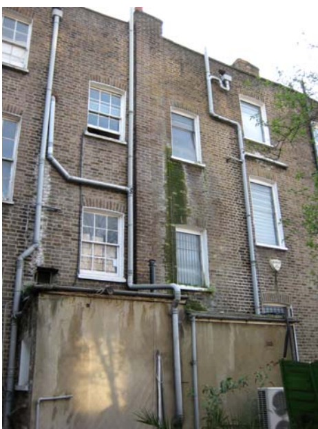
rear view towards no. 16