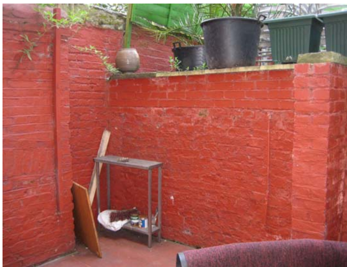
remnants of demolished back addition