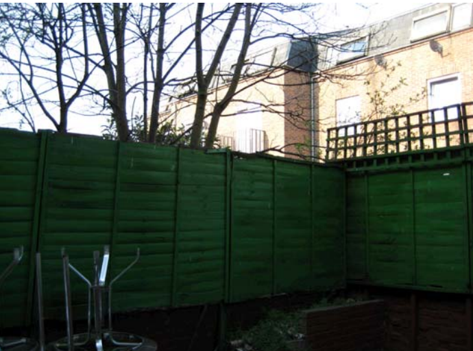
view towards Leybourne Street