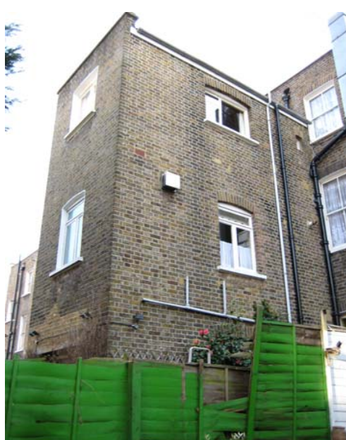
view towards no. 14