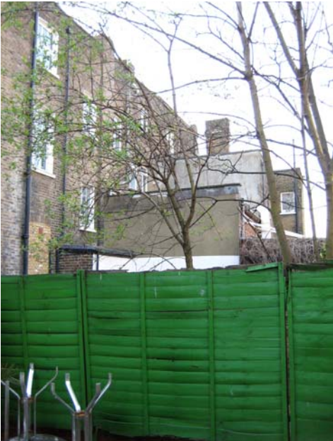
rear view towards no. 16