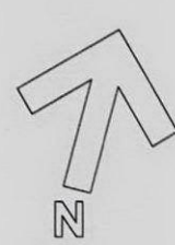
SITE PLAN SCALE 1:1250