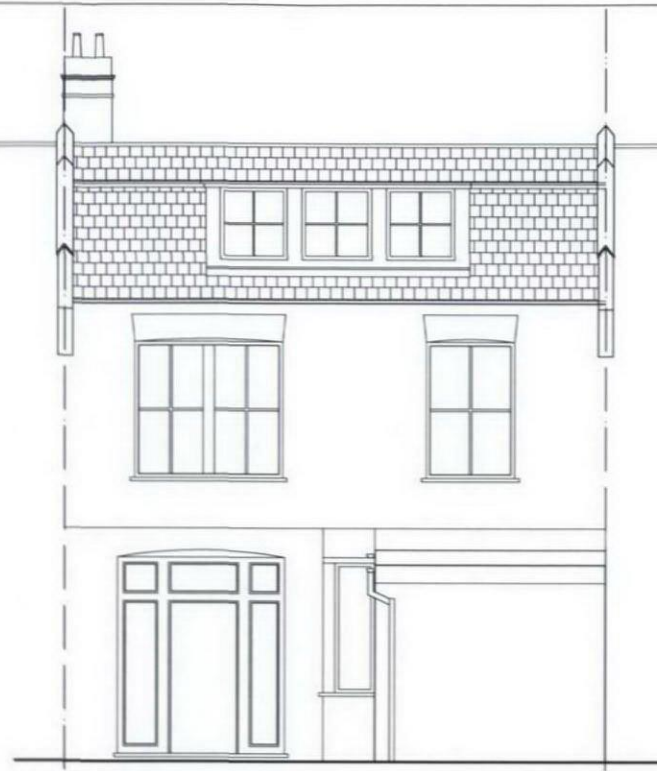
Proposed Rear Elevation Scale 1:50