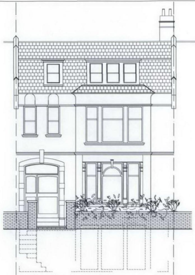
Proposed Front Elevation Scale 1:50