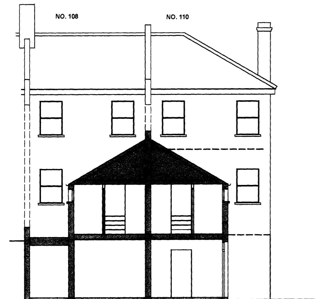
Cross Section showing Existing Entrance