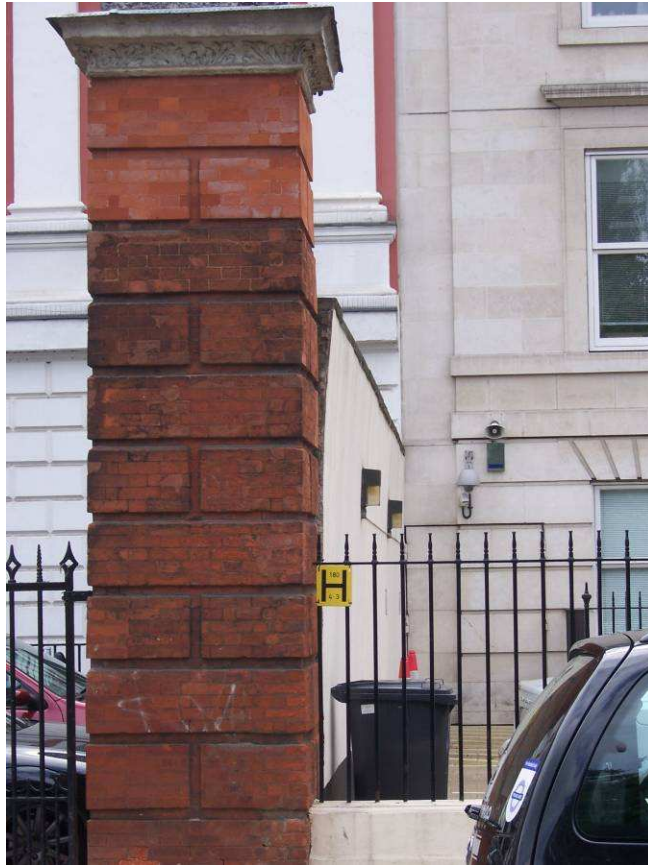
8. Leaning of the north wall.