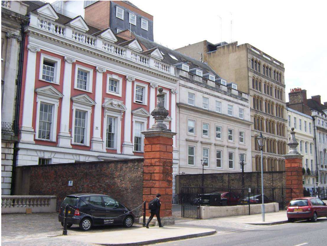
1. General view of the walls within the front yard of 59-60 LIF. Front piers are original, dividing walls are rebuilds.