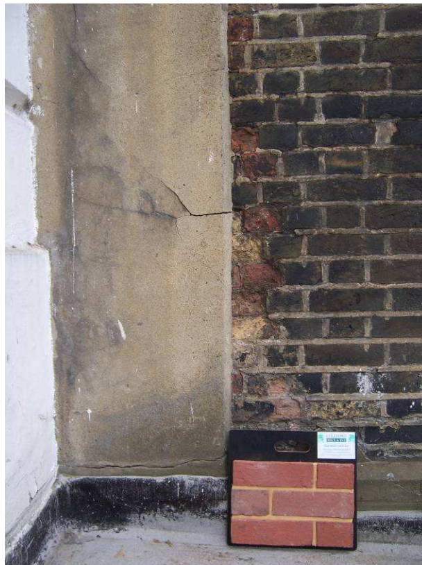
16. Proposed brick type of Colefords Dark Mixed Tudor Red, as shown against the areas of older mixed red brickwork (lhs, hidden behind render). Note that the older brickwork is heavily soiled with soot, and the clean colours are very similar.