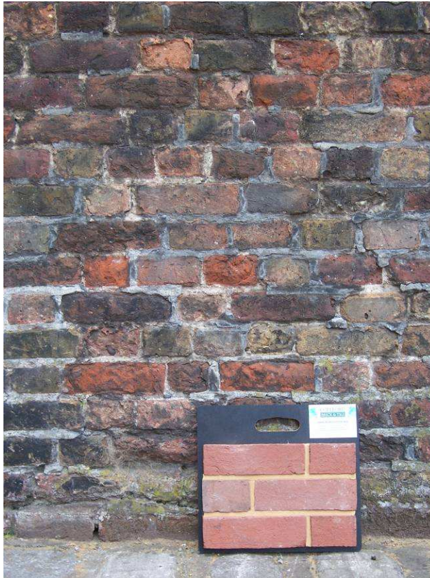
15. Proposed brick type of Colefords Dark Mixed Tudor Red, as shown against the areas of older mixed red brickwork. Note that the older brickwork is heavily soiled with soot, and the clean colours are very similar.