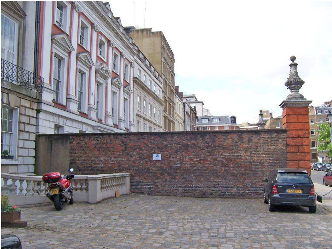
2. South wall, looking north. Note it is unclear whether the red brickwork is original, however it is older than the late c.19 th buff brickwork that exists elsewhere. Render to the lhs is a younger application.