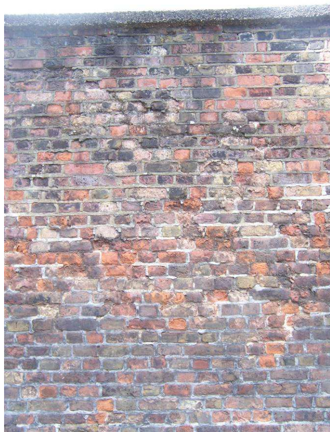
10. Mixed, mainly soft red, brickwork to the south face of the south wall.