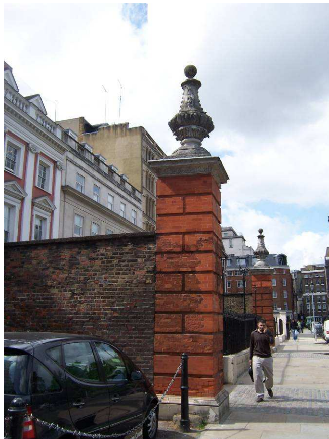
13. Leaning south pier; foundations requiring investigation.