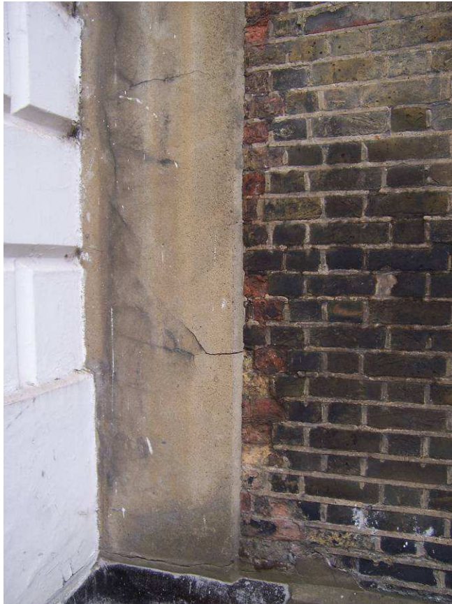
11. Evidential remains of older red brickwork at the abutment to the north wall.