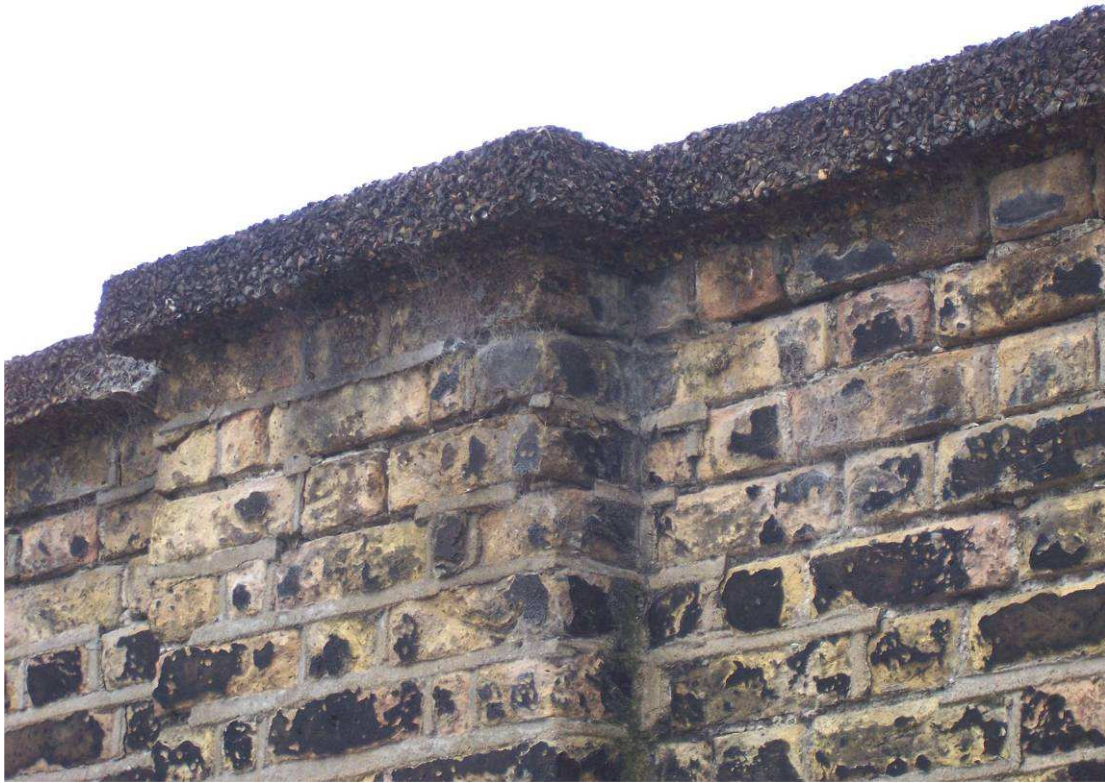
12. Current copings: Inadequate roughcast concrete, with insufficient overhangs, no drip throat, no weathering slopes (flat top) and no dpc.