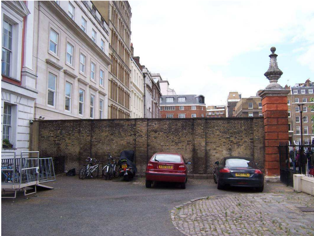
4. North wall, looking north. Note the buff stock bricks date from the rebuilding during the late c.19 th .