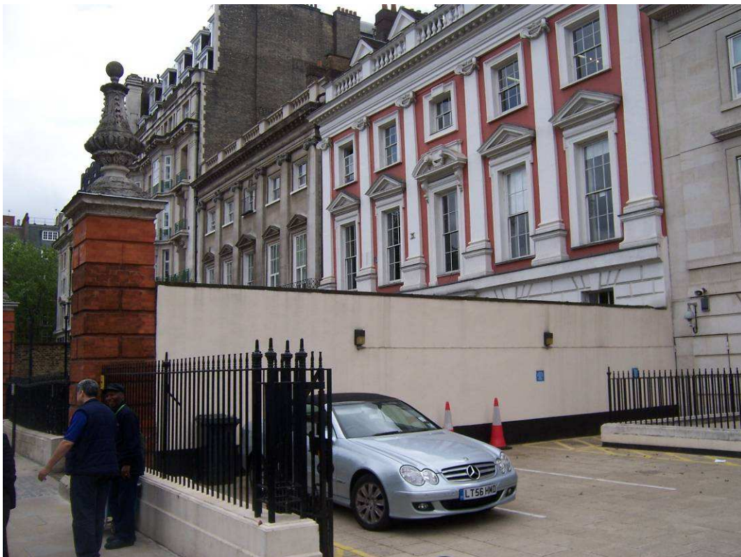
5. North wall, looking south. Note the render and decorations are modern, undertaken without authorisation by the neighbours to the north.