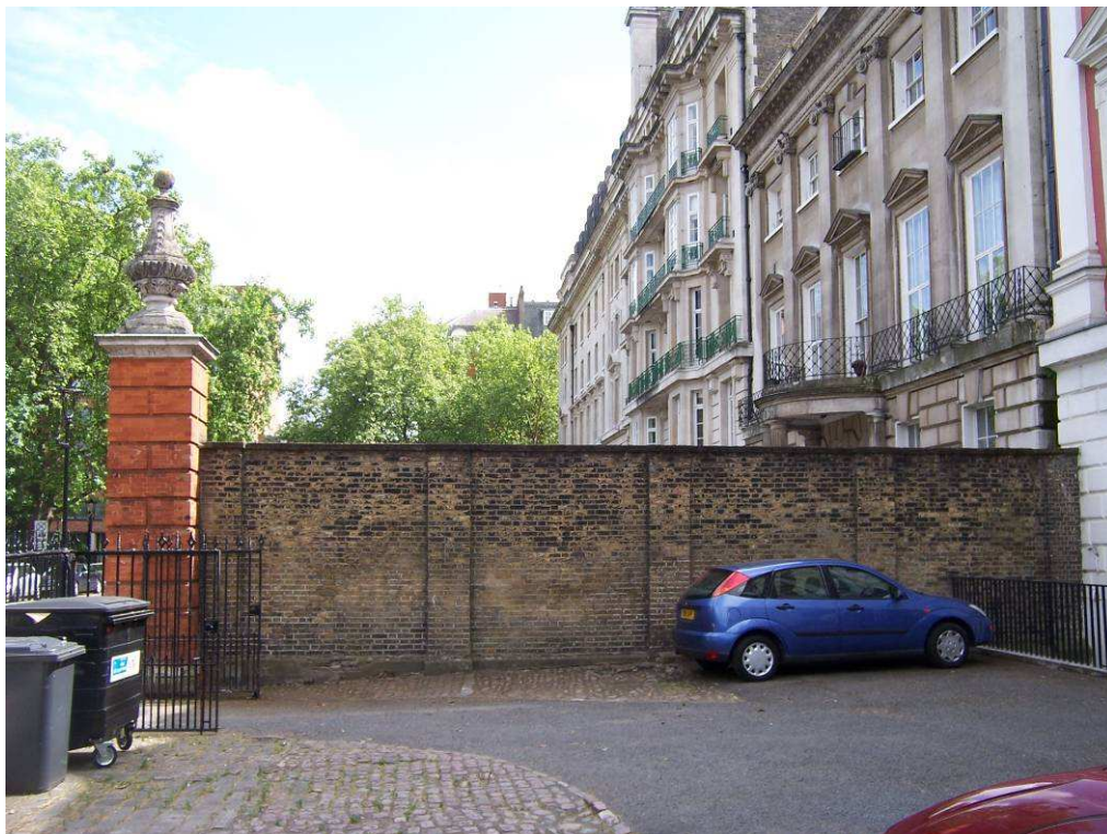
3. South wall, looking south. Note the buff stock bricks date from the rebuilding during the late c.19 th .