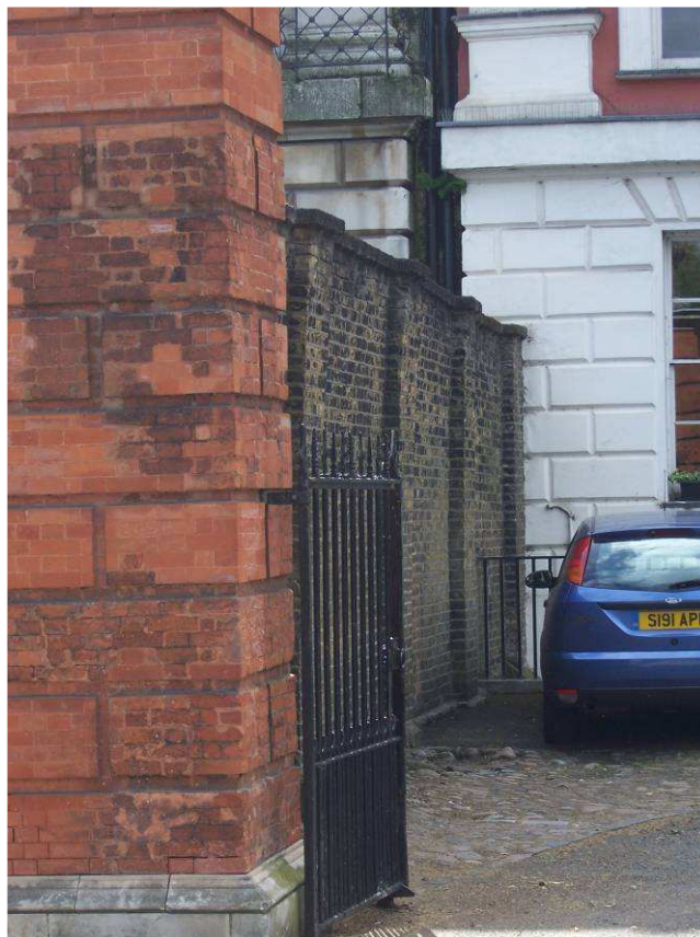
7. Bowing and leaning of the south wall.