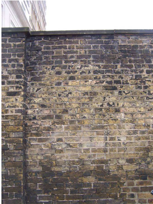
9. Buff stock brickwork to the north wall and to the north face of the south wall.