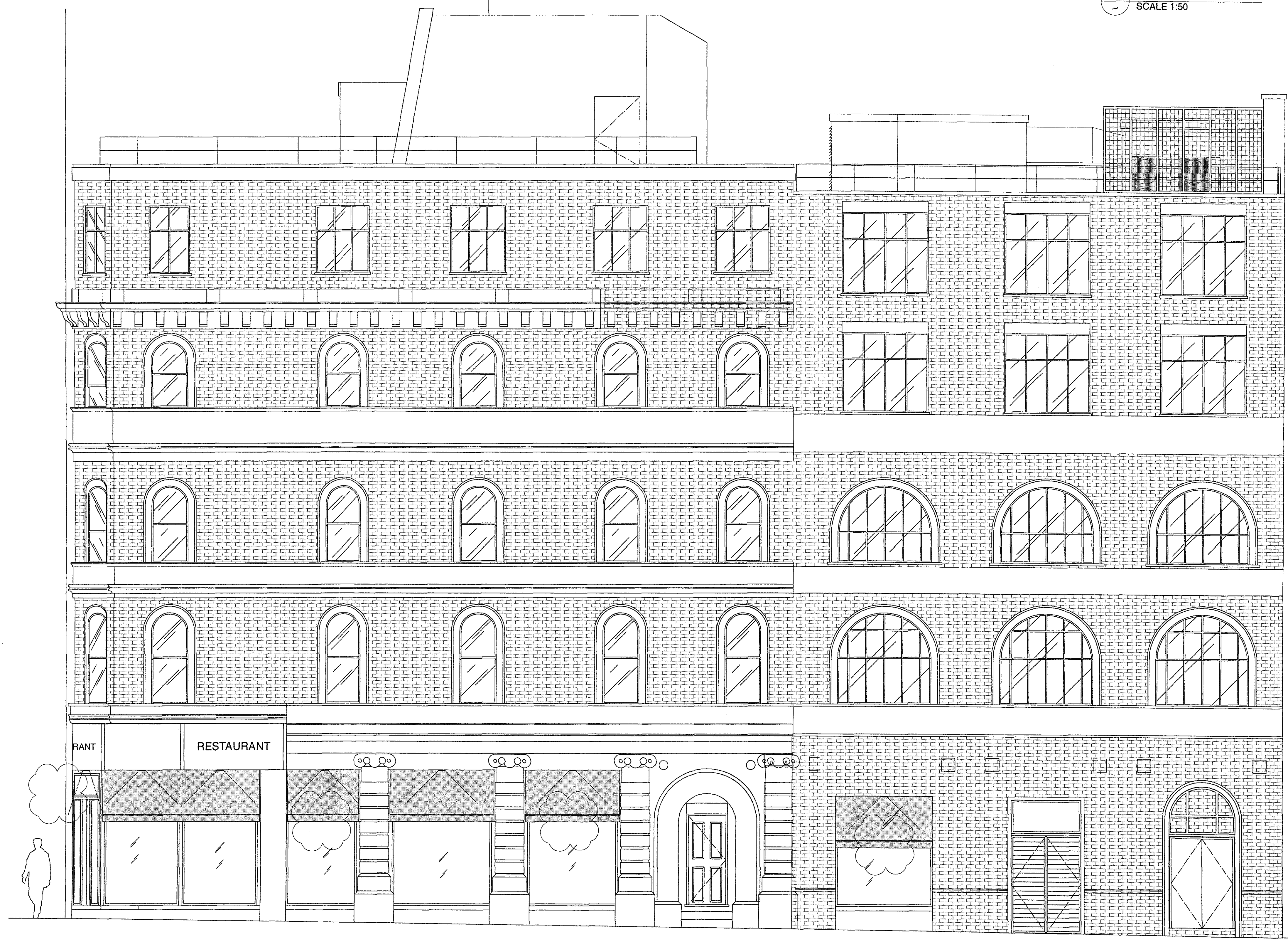
2 PROPOSED FLITCROFT STREET ELEV. SCALE 1:50