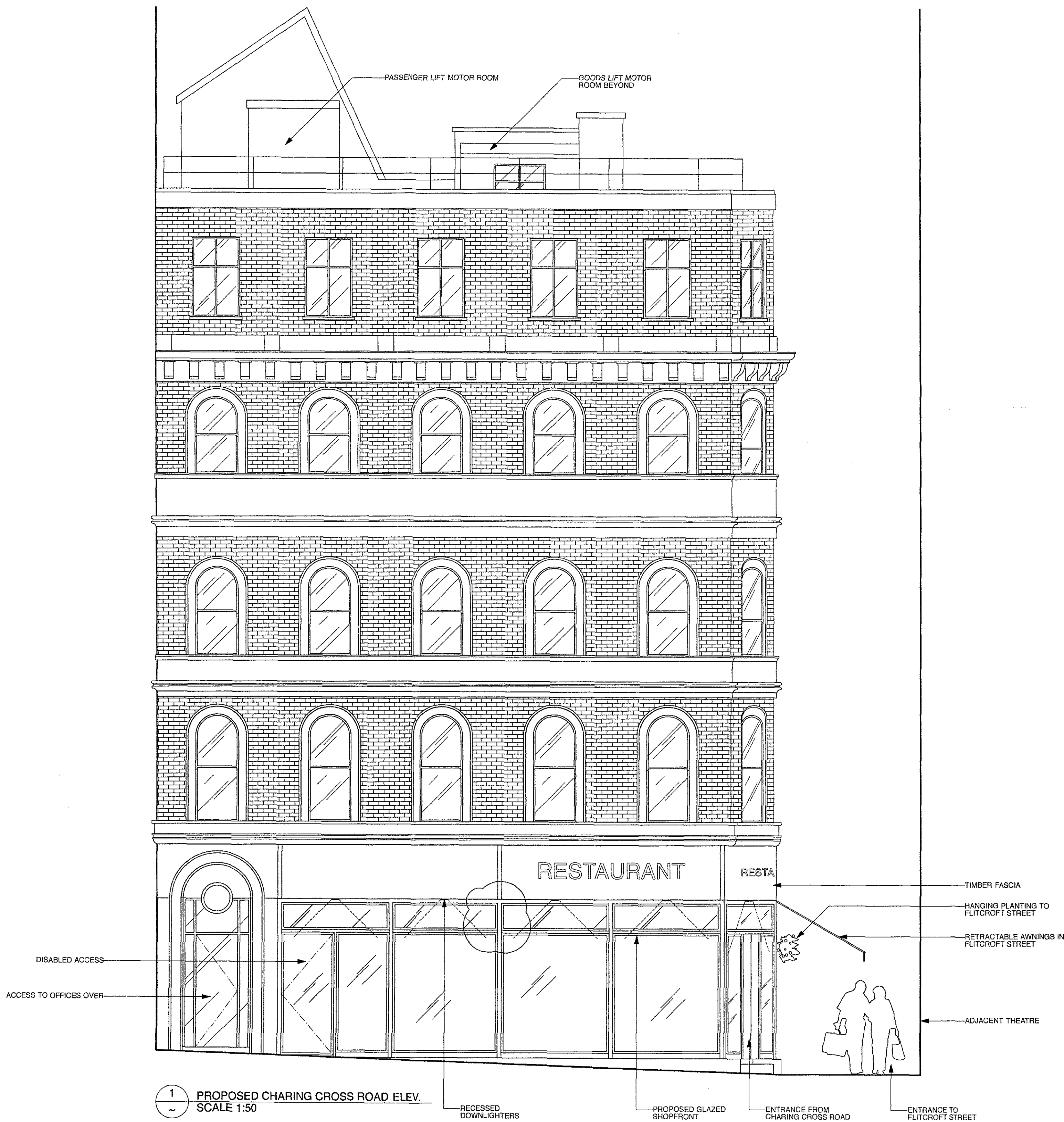
1 ~ PROPOSED CHARING CROSS ROAD ELEV. SCALE 1:50

Additional Notes: For finishes refer to TDS Finishes Schedule.