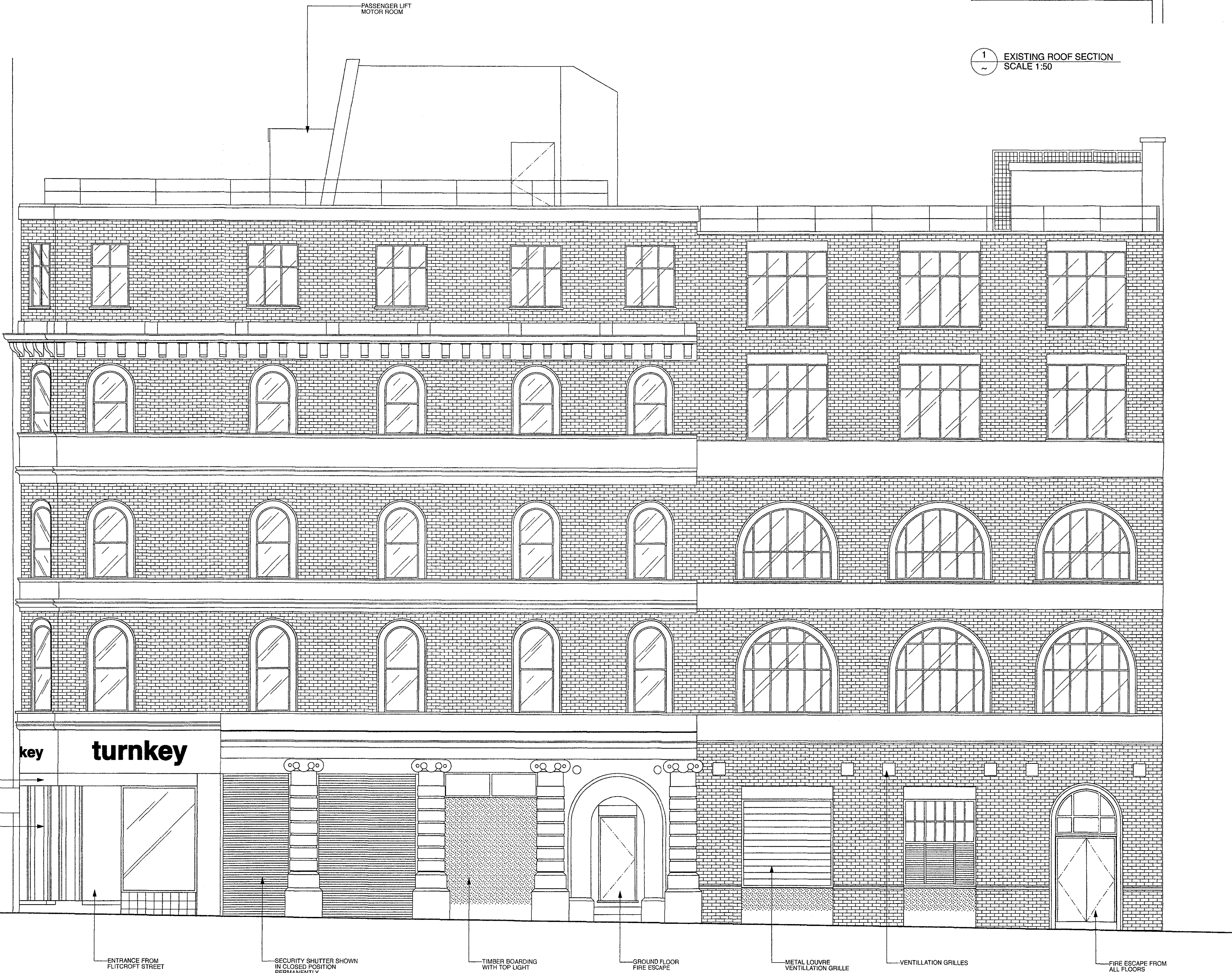
2 EXISTING FLITCROFT STREET ELEV. SCALE 1:50

Notes: This drawing should not be scaled. The contractor is to verify all dimensions and conditions on site. This drawing is the property of The Design Solution and they reserve the copyright. It is issued on the understanding that it will not be copied, reproduced or disclosed in whole or in part to any unauthorised party without written permission from The Design Solution.