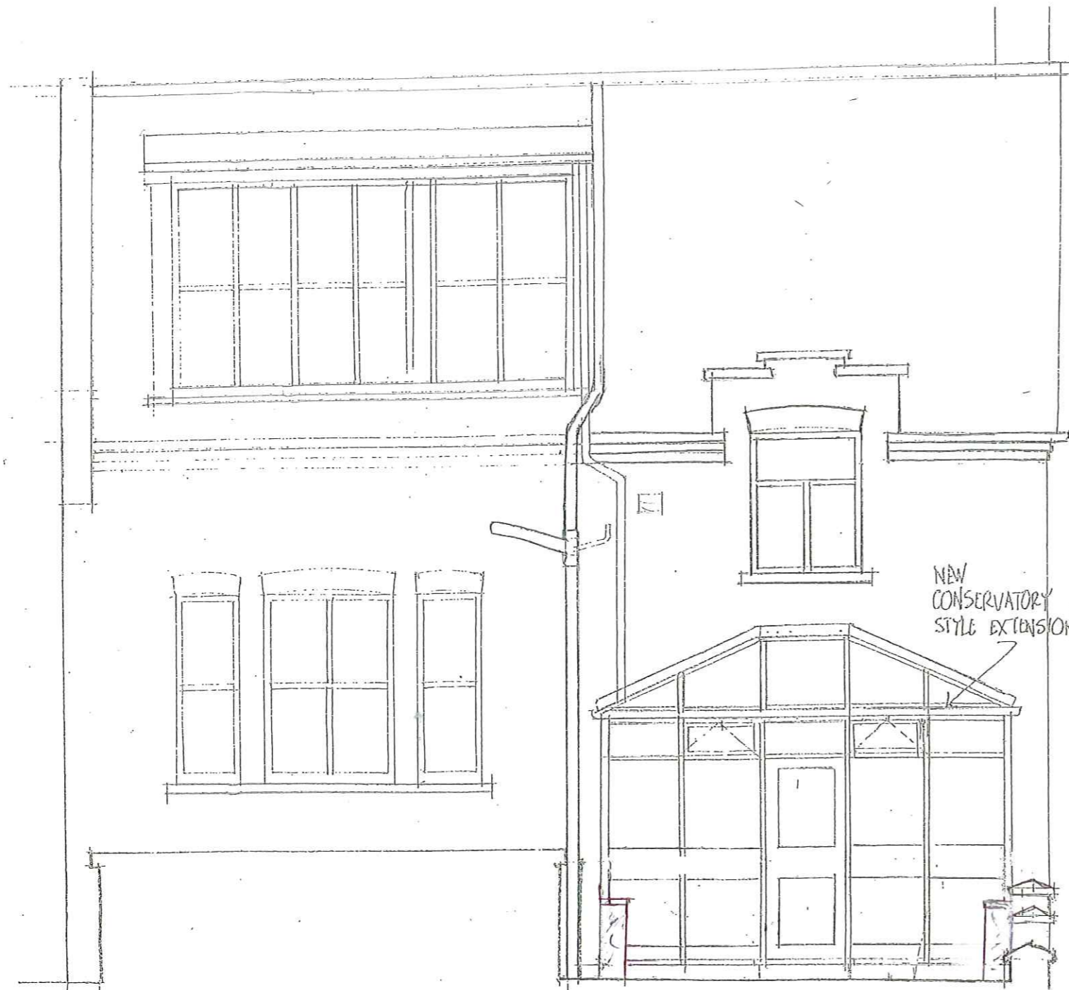
REAR ELEVATION PROPOSED